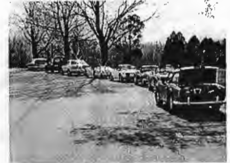
Triumph Fanatics In Line At Serpent Mound

We've been to Serpent Mound before on the 1997 Fall Tour, but I like the park, and I knew some good roads to get there. We pulled in the parking lot and lined up: