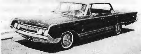
FOUR-DOOR HARDTOP "BREEZEWAY" WITH 390V8 4-BBL. AUTOMATIC TRANSMISSION ALL POWER OPTIONS, A/C. VERY GOOD CONDITION - MANY NEW PARTS, ALL RECEIPTS, ALL MANUALS, SOME SPARE PARTS & A TRUNK THAT ONE CAN FIT TEXAS IN. DRIVES ANYWHERE. $5000 OBO. 937-376-9246 OR CLOUGH@CRHNET.COM

up! And look for us to be sportin' the Inca Yellow wedge at a sports car event near you.