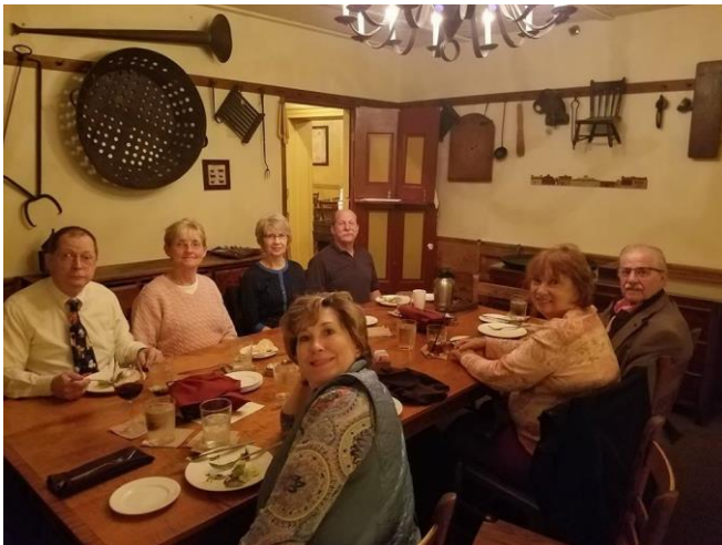
MVT Members Just Hangin' At The Golden Lamb