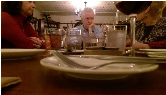
V-Day Dinner from the fork's view. More inside!