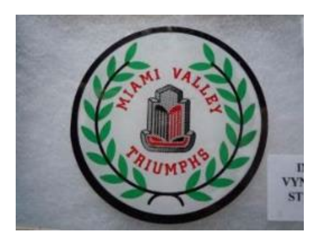
MVT Window Sticker - $1.00