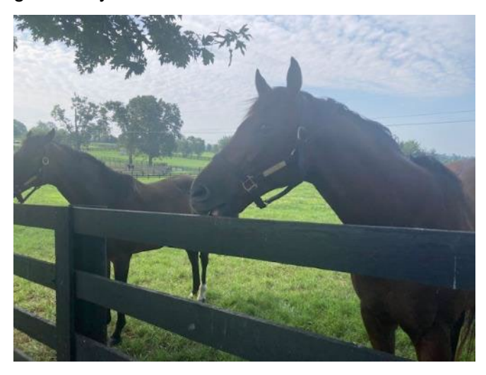
Some of the locals stopped by...

They were very appreciative of MVT and TRA generosity and invited us back whenever.