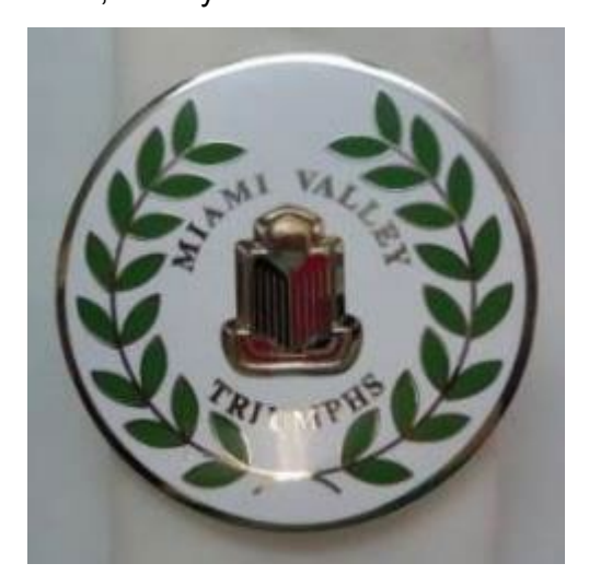
MVT Enamel Car Badge - $30.00

The Club has the following fantastic, wonderful memorabilia for sale. Show your colors in public, on your car, or on you! Look at all we have: