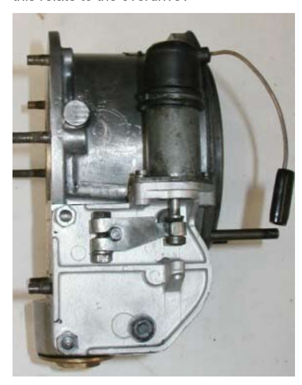
Your friend and mine, the solenoid in position on the overdrive

What is a solenoid? Well a simple explanation is that it is a big electro magnet surrounding a piece of metal that moves when current (electricity) is applied to the coil of the electro magnet. How does this relate to the overdrive?