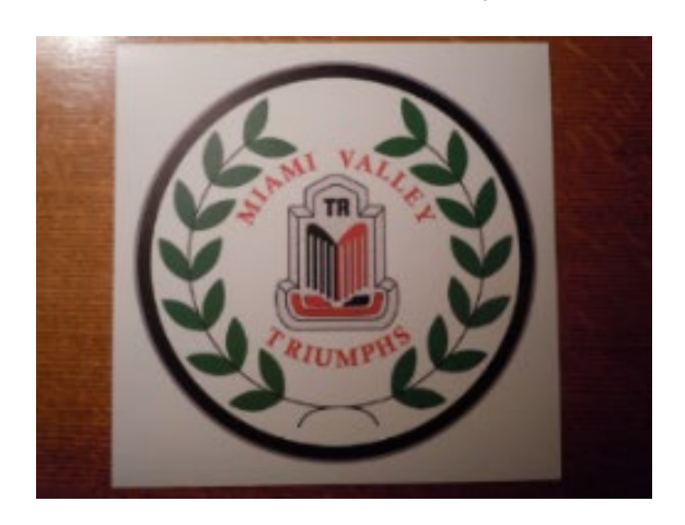
MVT Magnetic Signs – these can be easily cut so they are round. They are 12"x12", 11" in diameter if cut round. - $12