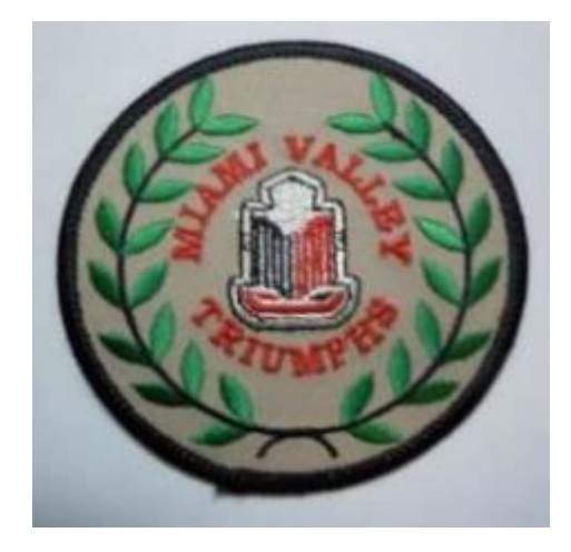
MVT Cloth Patch - $12.00