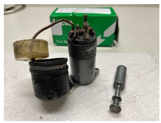
One disassembled solenoid

This meant that the main coil of the solenoid was bad but the holding coil was OK. Time to replace the solenoid. Actually, very simple IF you could actually get to the solenoid. For a TR2-3 to get access to the transmission and overdrive you need to remove the center tunnel and to do that remove the carpet and seats. When the tunnel is removed, only two screws/bolts hold the solenoid on, a quick job at this point.