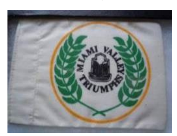
MVT Car Flag - $5.00