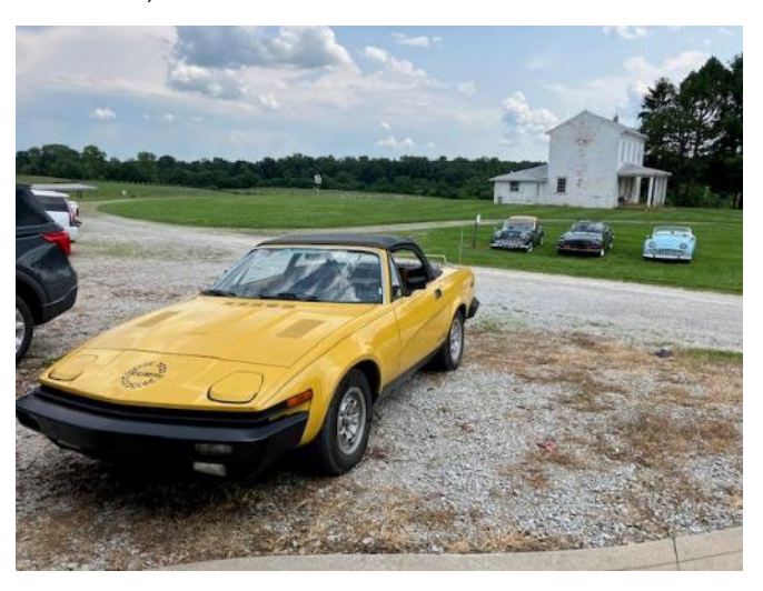
MVT Cars resting at CCW while their owners porked out...

Thanks to those who came out for the WineFlashMob – that was a pick-up game that turned out very well! The charcuterie was overflowing as well as the wine bottles, and the weather was almost great – we had one minute of hard rain, but that was all.