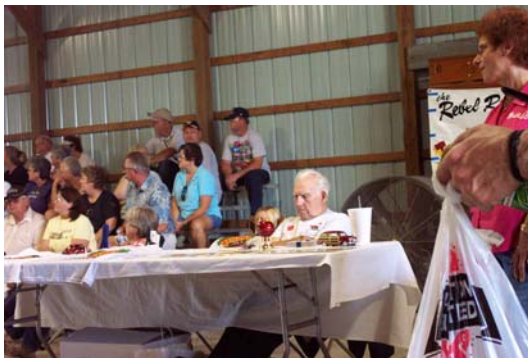
Figure 1 What famous car guy fell asleep at the rock concert?

Please send comments/suggestions to: news@miamivalleytriumphs.org or to the P. O. Box.