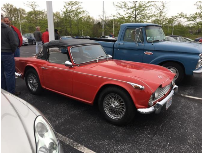
TR4A that showed up for the tour