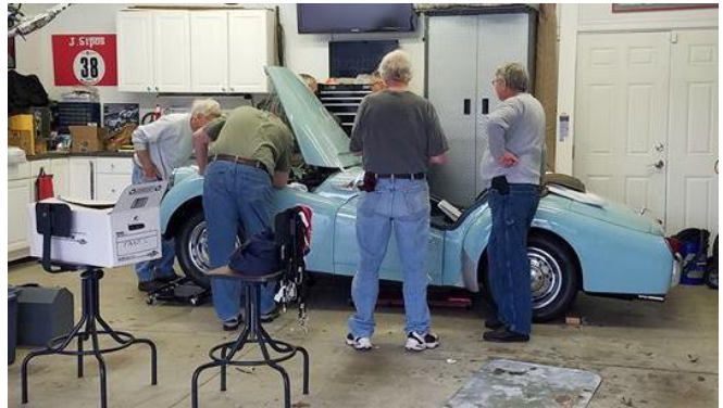
“Yep, I see the problem – you have an engine in here, don’t you?”