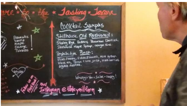
Now you know how to make Old Fashions