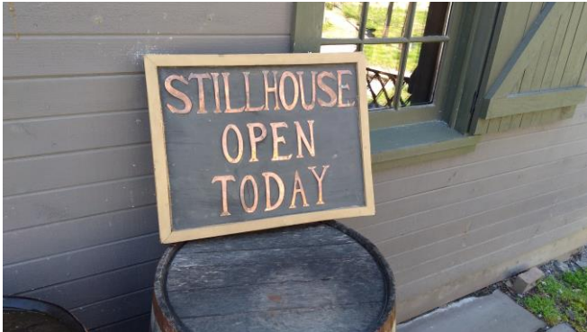
A welcoming sign...

Farm and Indian Creek Distillery. The folks there gave us a very informative tutorial on booze making on the American Frontier circa 1820 and then gave us a taste test. The look on some of the faces when tasting the demon liquor was precious. The stills they use are the still used in 1820, and they are the second oldest stills still in operation in the world (oldest is in Scotland we believe, while the largest is in Ireland).