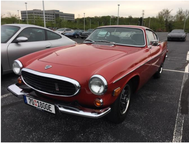
Even when John whimps-out he look cool...

It was a cold and raw day but the rain went south and we only had some drizzle for while in the morning. Nevertheless I wimped out and took the Swedish Triumph. There were a few brave souls in MG-Ts that did run sans top.