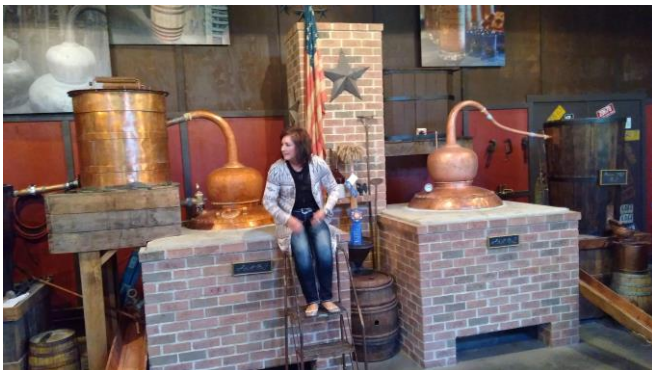
The current owner, a descendant of the original (1820) distiller, informs us of the process on the pot stills