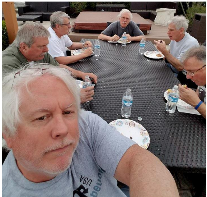
All being happy