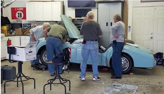
Searching for Donuts