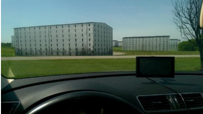
Rik Barns, Heavenly Hill Distillery