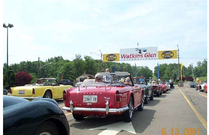
Figure 2 Waiting to enter the Glen