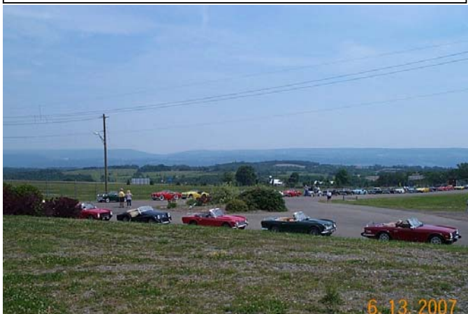
Figure 4 Rolling Hills,still TRs. Below: Seto, Bolich and Corcoran TRs.