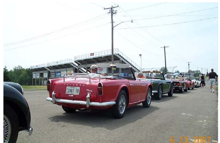
Figure 3 Whites TR 4 keen for action.