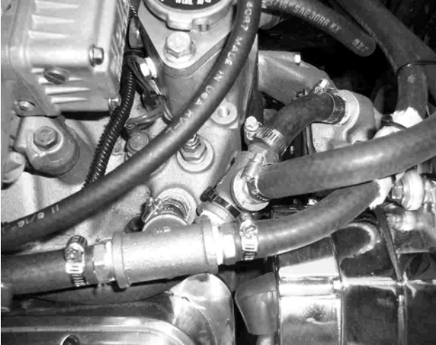
Mess Of Extra Plumbing I Had To Install For The Aux Cooler – Thank Goodness Lowes Is Open Until 10PM!