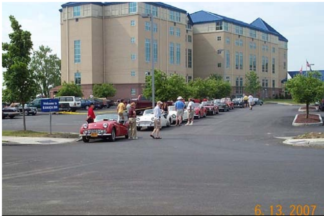
Figure 1 Overnight stay.