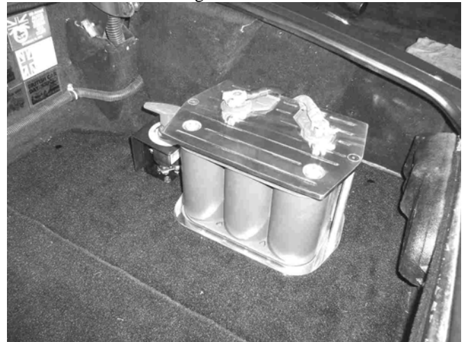
Optima Gel-Cell Battery and Cut-Off Switch Mounted In Trunk Close TO The Location Of The Battery That Was In The Car When I Got It, Without The Duct Tape!