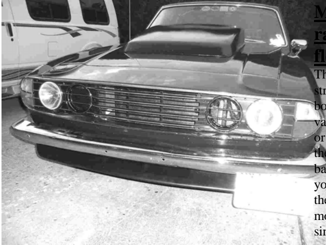
New Grill With Extra Air Holes Where Inner Lights Used To Be. Looking More Like A Rod Everyday! Great TR6, errr, Stag Front Spoiler