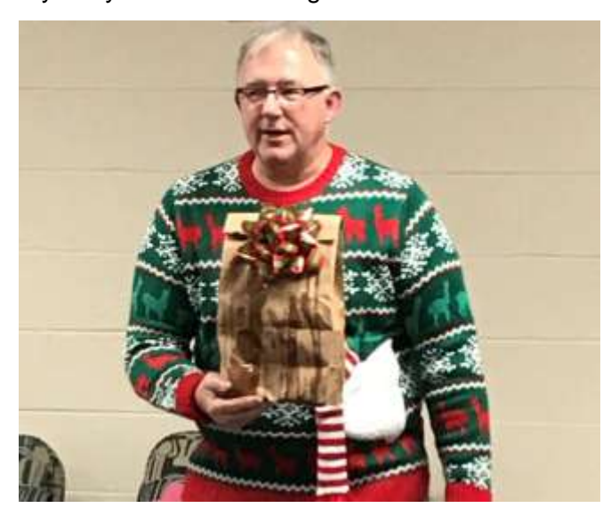
Will somebody turn that sweater off, please?