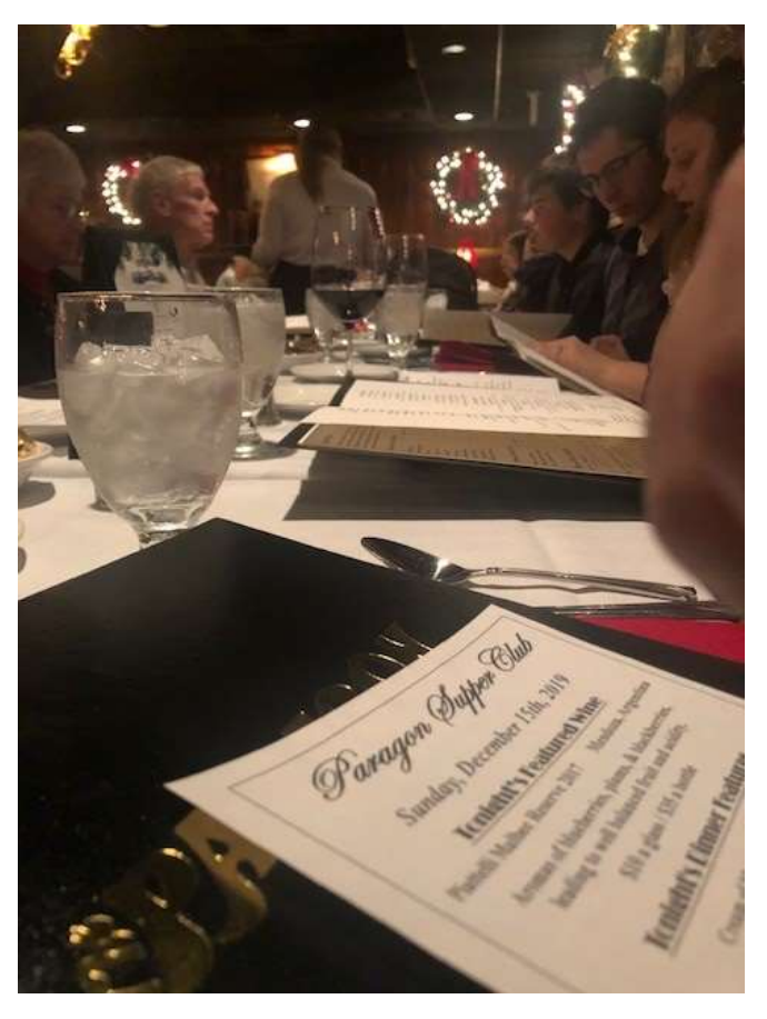
Great time at the paragon – burp!

The next tech session will be in January - look further on here in events to find it!