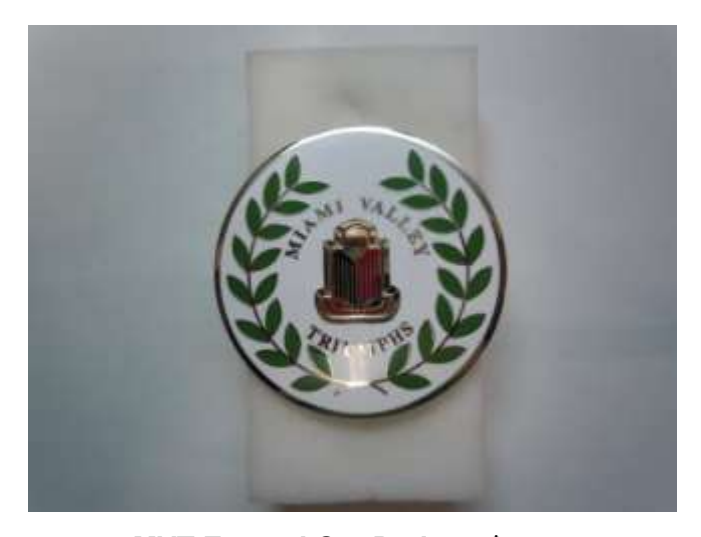
MVT Enamel Car Badge - $30.00

The Club has the following fantastic, wonderful memorabilia for sale. Show your colors in public, on your car or on you! Look at all we have: