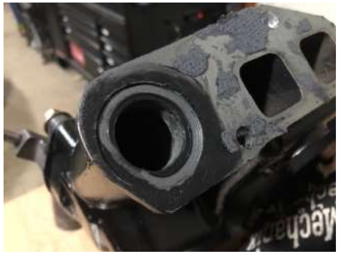
I found out why the manifold was leaking on Carma – the O-Ring went a bit sideways on installation. Got a new o-ring installed but am still waiting for manifold gaskets from the UK