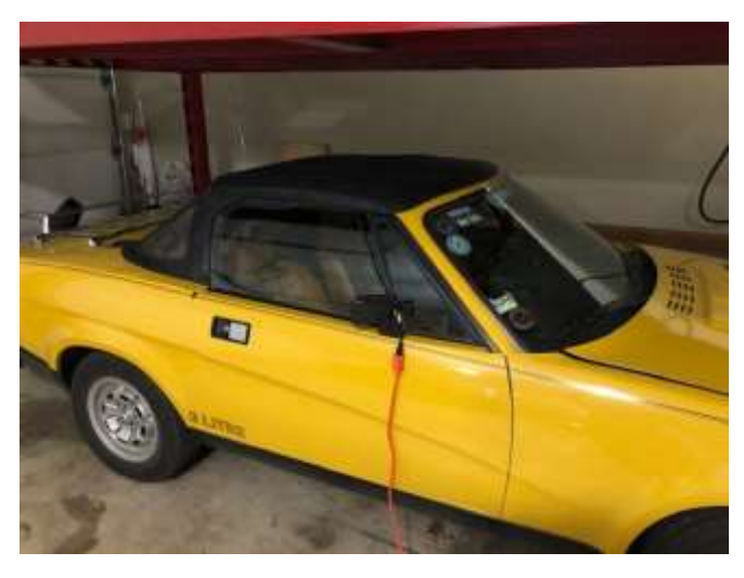
I needed to get Inca's top up in the heated garage, put the top up as far as you can, roll up the windows, and put a space heater in it CAREFULLY ARRANGED so no fires happen. After 15 minutes it was 90F in there and the top attached fine!