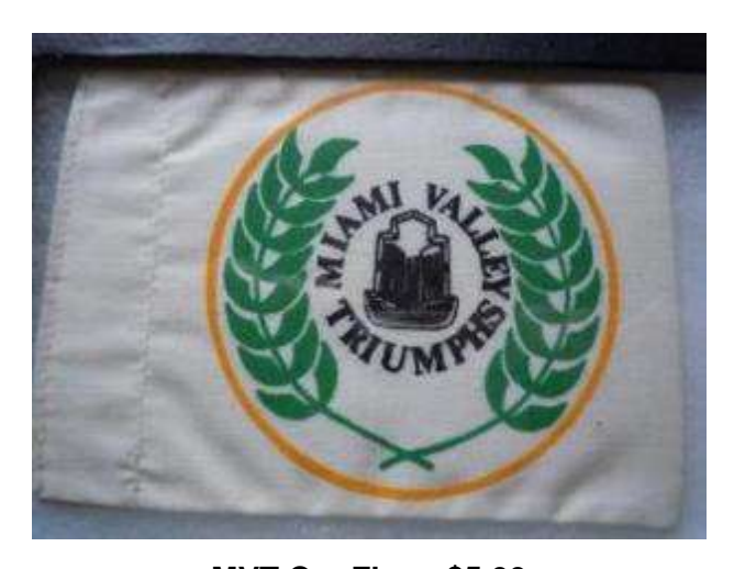
MVT Car Flag - $5.00