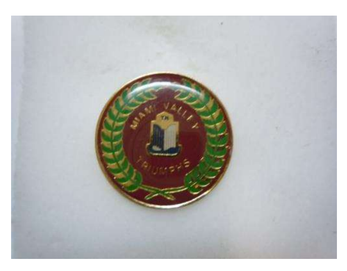
MVT Pin - $5.00