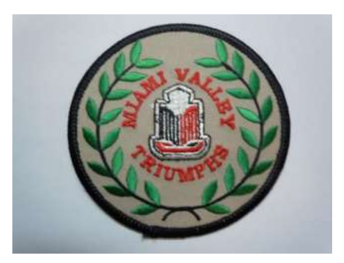
MVT Cloth Patch - $12.00