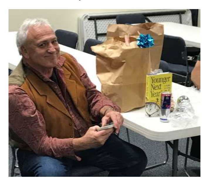
Mr Disco - Saturday Night Fever!