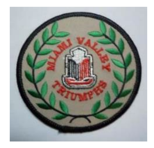
MVT Cloth Patch - $12.00