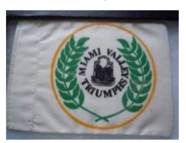
MVT Car Flag - $5.00