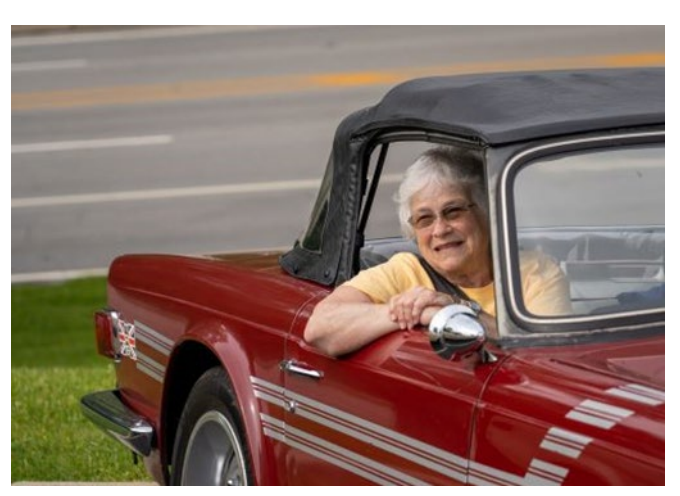
Ya'll come to our tour now dangit!

Fresh off the presses, we will be meeting at the Fairborn, OH T.J. Chumps, 1100 East Dayton-Yellow Springs Road, 45324. Dinner at 5:30, meeting after that. Meeting agenda will be sent out later