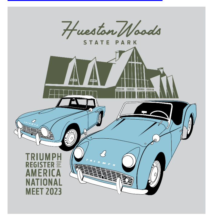
18-23 - TRA 2023 - Hueston Woods State Park - If we have to tell you a lot about this, then we have failed (lol). C'mon down for fun, education, beer, and squirt guns - it is getting real close.