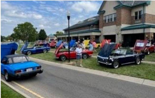
Meanwhile Spits were relegated to the tarmac...