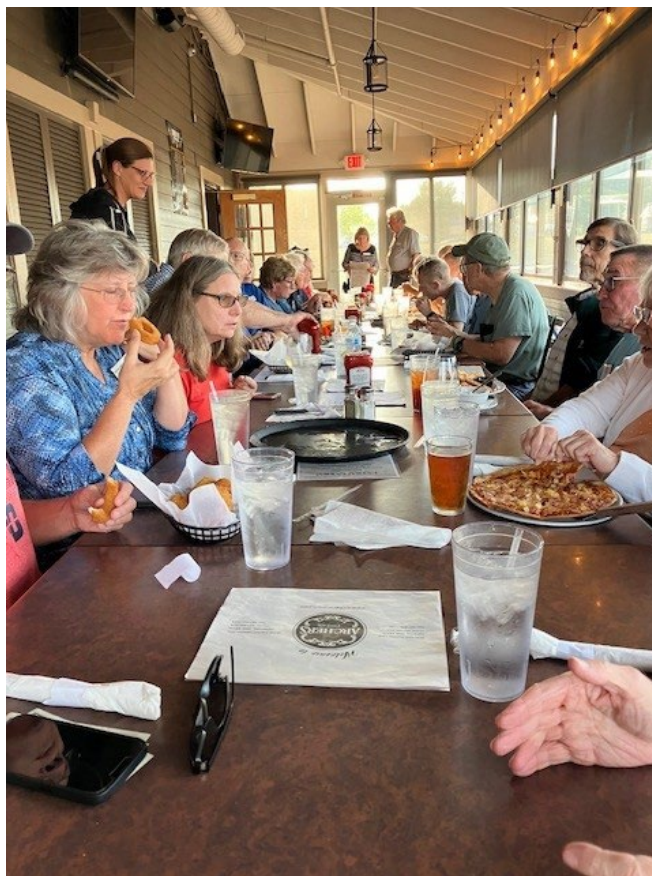
32 members at the MVT September meeting – new worlds record!