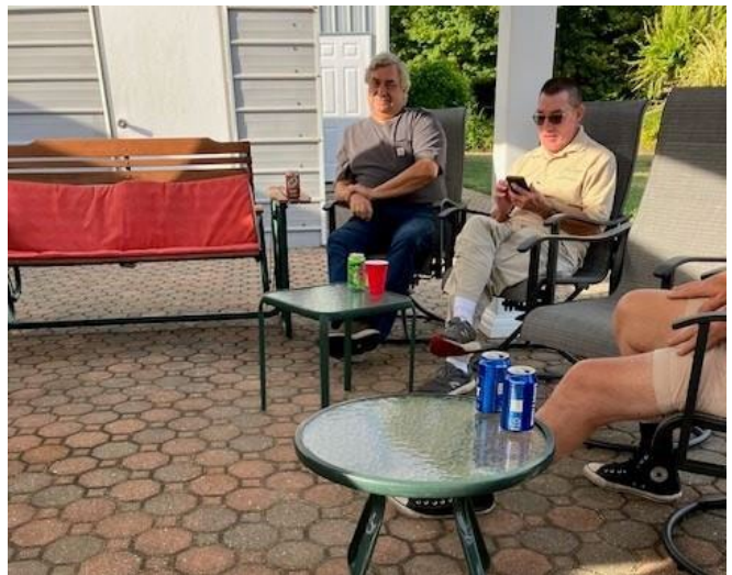
Free beer sighting