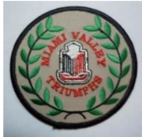
MVT Cloth Patch - $12.00