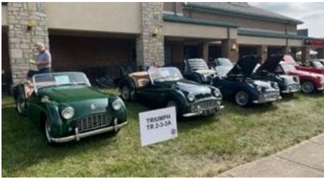
TRs on the green...