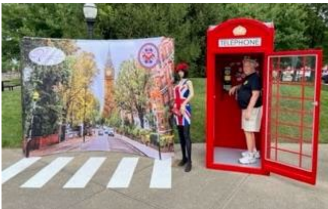
Just a little Anglophile stuff