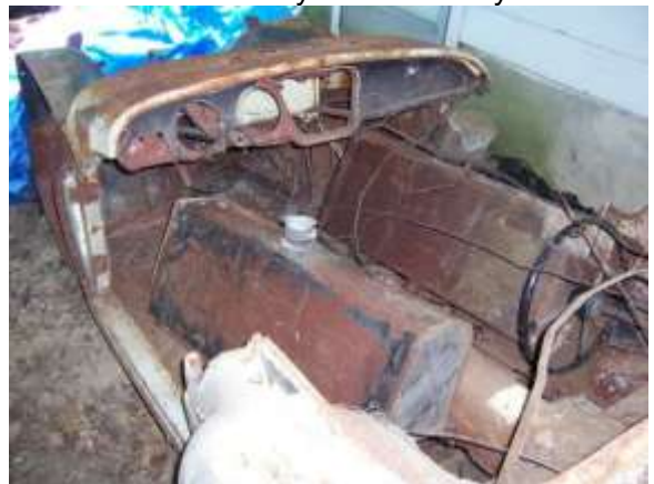
Anyone need another project? Yikes!

I get another aeroscreen, and I think I need grey wire wheels – what do folks think? Oh, and due to the fact that I need to carry and move multiple folks and stuff for TRA 2014 I'm not going to be taking it. Probably the Stag, or maybe a Subaru if I think I really have to carry stuff!