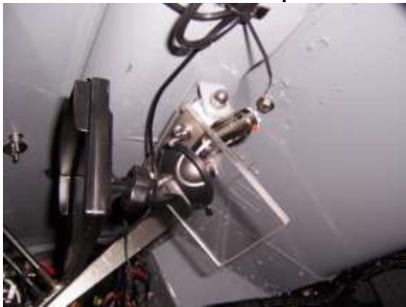
With the heater gone I moved the rear view camera farther under the dash using the heater mounting bracket I had made earlier. Easier to see in the sun this way.