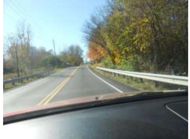
TBD – Fall Tour – The New Wineries of Ohio

14 - 2014 Concours d'Elegance at Carillon Historical Park, Dayton, Ohio. Featuring: Ferrari, Corvette Stingray C2, and Aston Martin automobiles. Weekend events include: Saturday, Sept. 13th, Classic Road Tour & Preview Party. Sunday, Sept. 14th, Dayton Concours d'Elegance. Info: http://www.daytonconcoours.com/ or call 937-432-2841