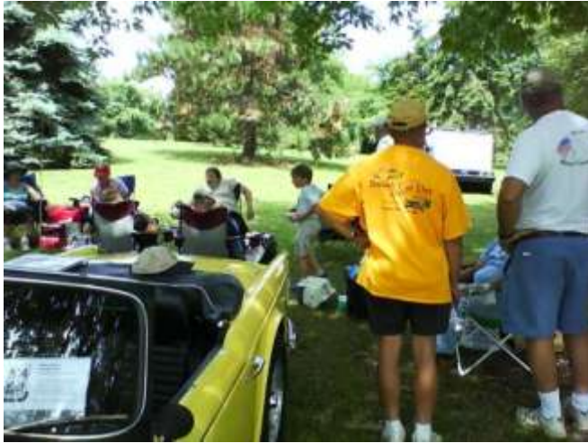
13 – Cincinnati British Car Day – Assuming Harbin Park in Fairfield. If so we will meet at the Bob Evans Restaurant in Middletown (OH 122 Exit of I-75) for the drive down for those coming from up north. Breakfast at 8, leave by 9.