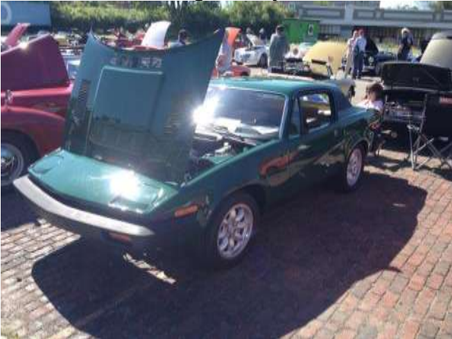
The Clifford's Freshly Restored TR7 – they never came off the line this good!