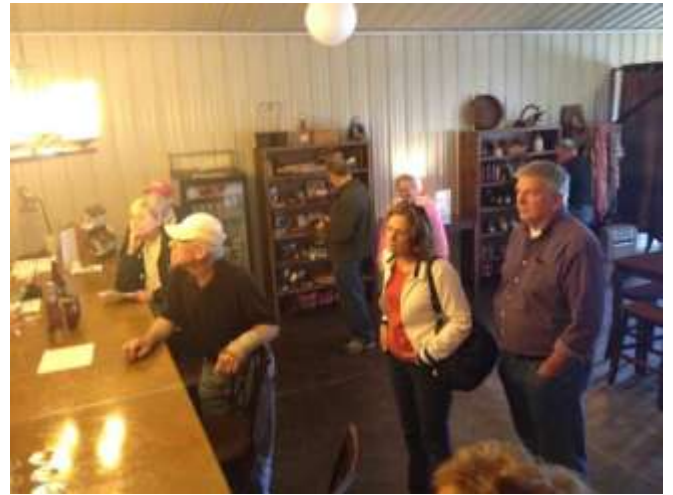
Team MVT At Manchester Hill Winery

After that we met the rest of the crew at JR Hooks for breakfast – a great breakfast as a matter of fact, We then wandered around to a few shops in Circleville and talked them into being stops for the TR3zee Run after the TRA Saturday Morning Brunch. We then hit the road... ...and went in a round-about way to a couple of wineries.