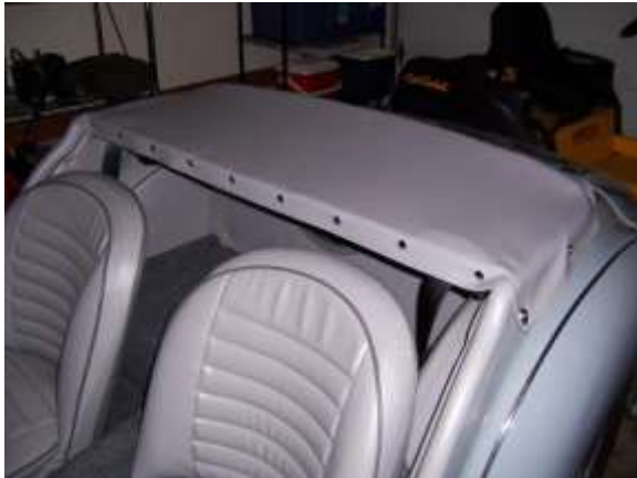
The back cover – yes, I still have the tonneau to seal the interior up.