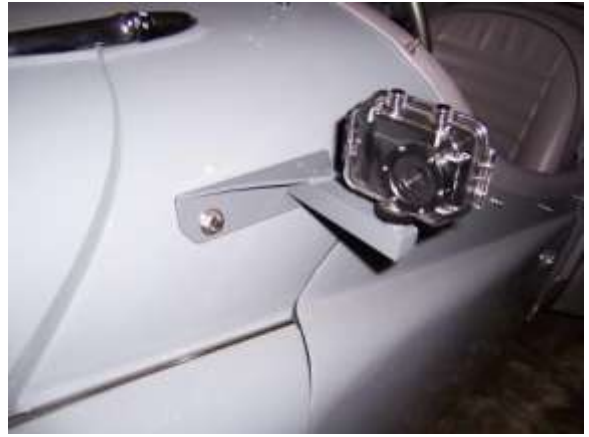
Camera on its mount – no unused bolt holes go to waste.....