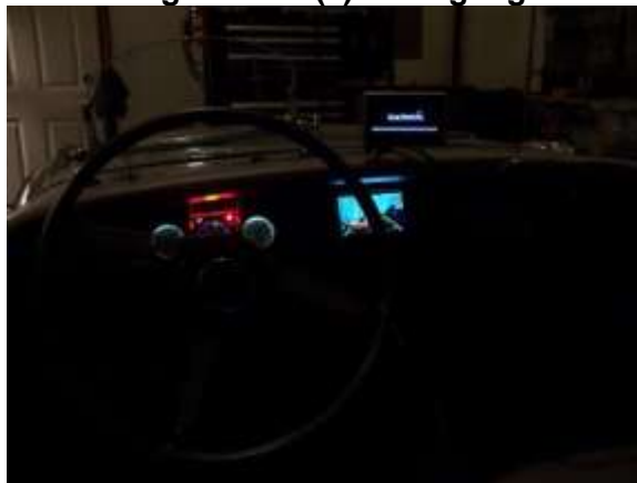
Moving the displays – you can see the rear camera has excellent dark viewing and the alternator and oil pressure idiot lights are on.