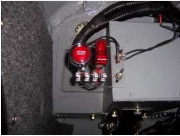
Switch Panel under the dash – very compact