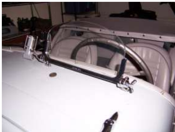
Aeroscreen – I need to make this plural...