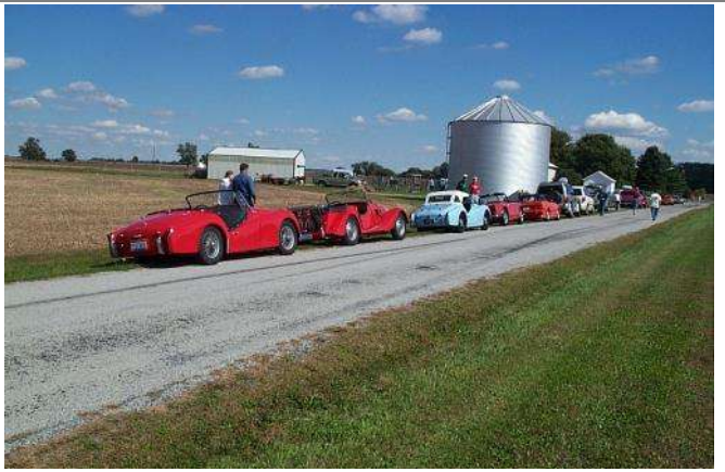
TBD – Harvest Tour –