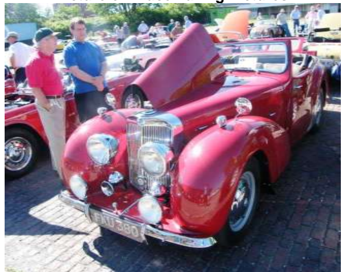
Best of Show – 1948 1800(?) Triumph Roadster