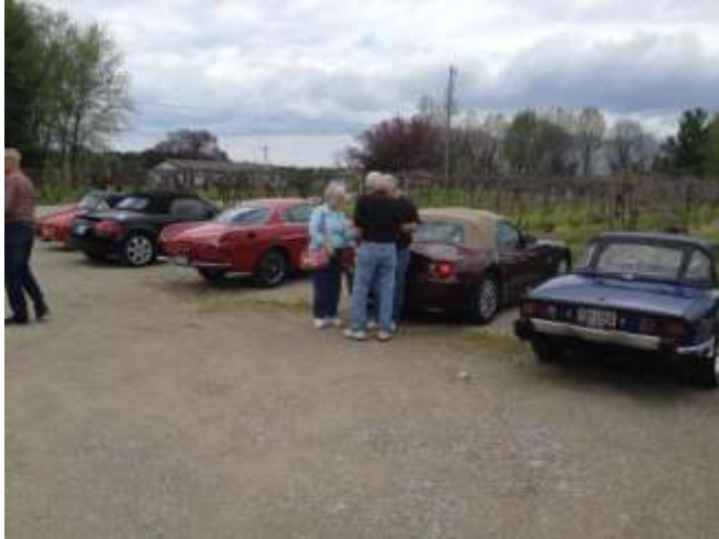
Slate Run Winery On Spring Tour

All went well. Some left early and went to a decrepit garage sale, a there-ain't-no-quilting-stuff-here-even-though-you-promised-it garage sale in Circleville.