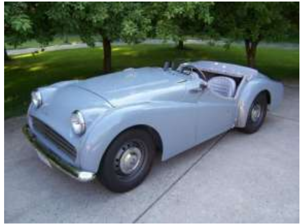
All together now, but I need another aeroscreen!