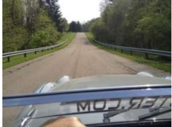
The road ahead on the good-long drive from above where the driver was looking

I took it for a good-long drive. Down a few roads with Duncan at my side taking pictures. Ate bugs? Yes, a few. Did the rear view mirror work? Not at all – field of view is very limited and everything is blurry due to vibration. How about that windshield? It does look cool, but cuts across the vision just at the wrong height, blocks some vision if you can imagine that.