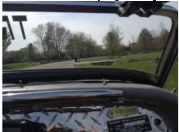
Duncan's View of the drive

Got it back to the garage and decided that the cut-off windscreen is not the way to go for long drives.