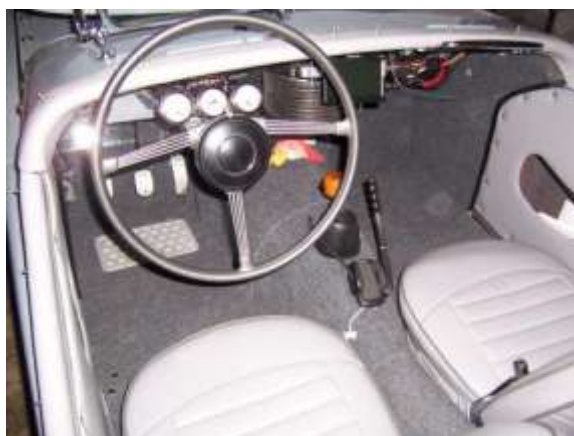
New Plexiglas Dash(s) – the gauges float