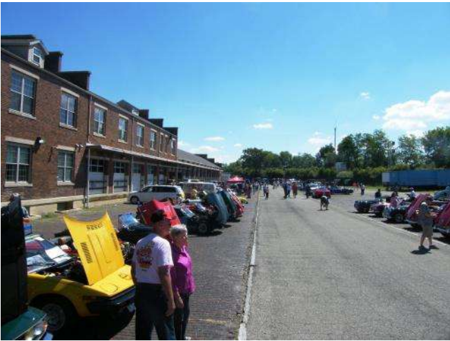
Another shot of the great day and fantastic cars