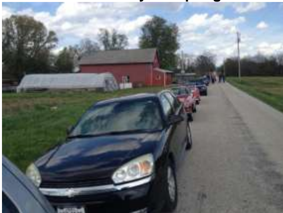
Lining Up For Honey at the Farm

After that we met the rest of the crew at JR Hooks for breakfast – a great breakfast as a matter of fact, We then wandered around to a few shops in Circleville and talked them into being stops for the TR3zee Run after the TRA Saturday Morning Brunch. We then hit the road... ...and went in a round-about way to a couple of wineries.