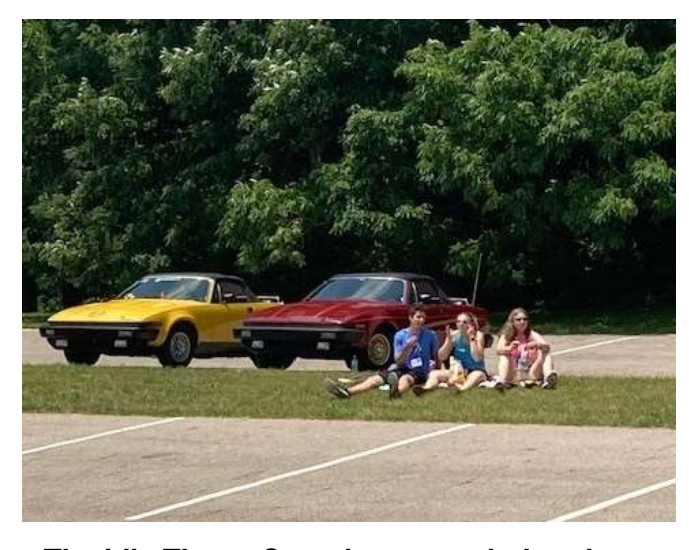
The Idle Threat Crowd was tough that day...