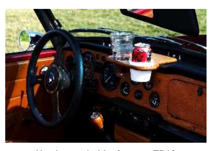
Need a cup holder for your TR6?