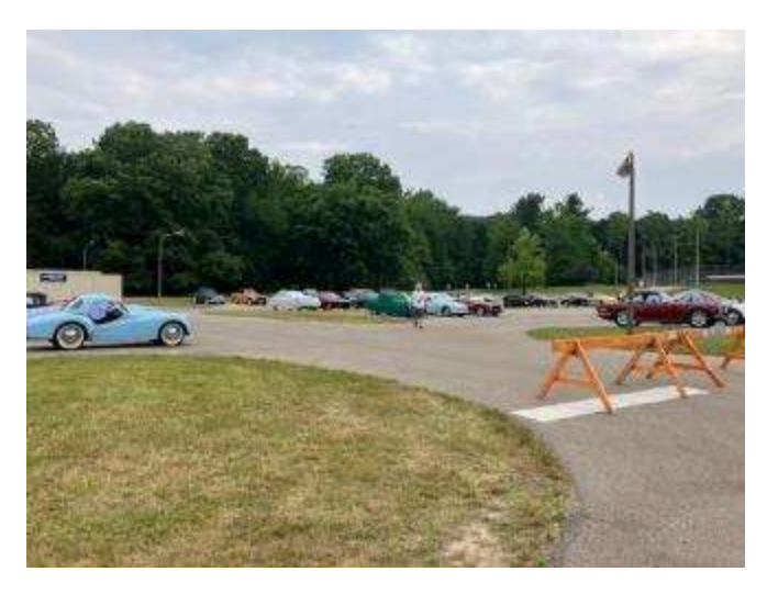
Parking lot Sunday evening as folks arrived - talk to Bruce about the trailer parking...