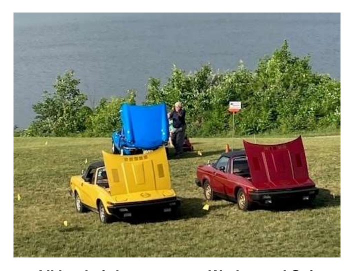
All by their lonesomes – Wedge and Spit parking at the show...