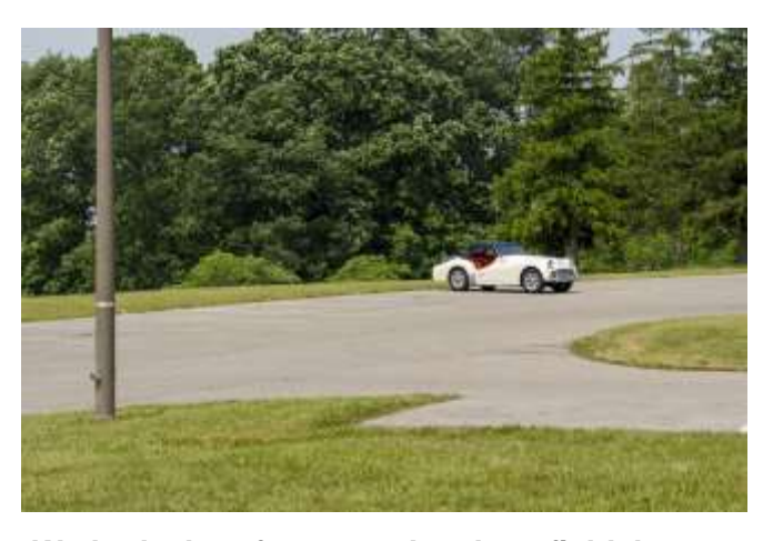
We had a lot of cars on the show field, but we still had 10 or so cars not in the show – here is one looking a bit lonely!