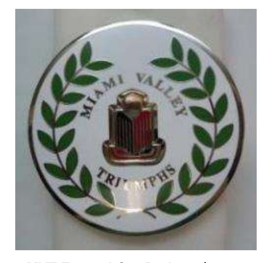
MVT Enamel Car Badge - $30.00

The Club has the following fantastic, wonderful memorabilia for sale. Show your colors iblic, on your car or on you! Look at all we have: