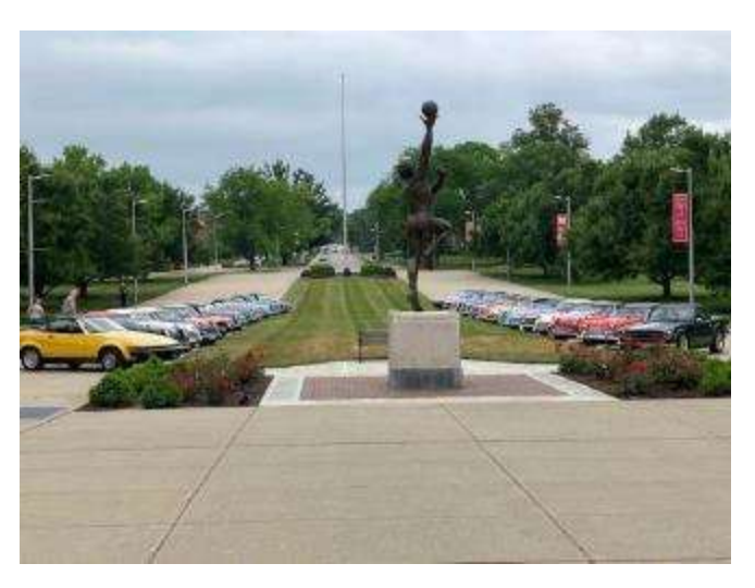
Picnic @ Miami U – Millett Hall Parking – fantastic being able to park on the wide walkways into the building