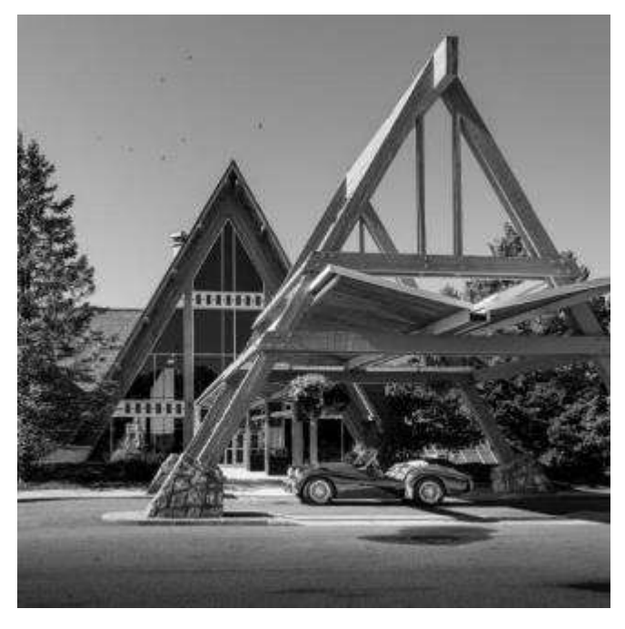
Artistic shot by Frank – hotel staff loved it so much they asked for some use rights!