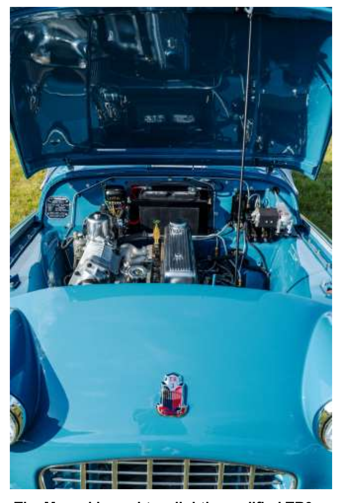
The Macys' brought a slightly modified TR3...