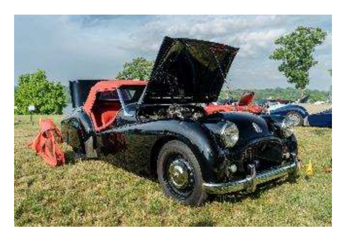
Kelleys' Long door TR2 - stunning car and Best of Show Concours