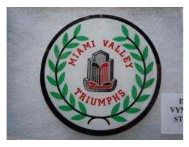
MVT Window Sticker - $1.00