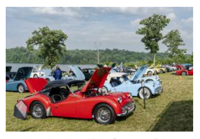
Another short of the Concours field