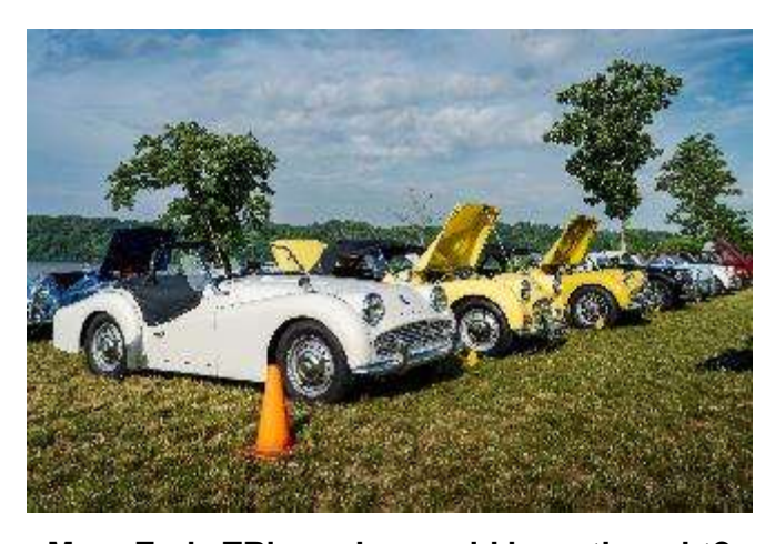
More Early TR's - who would have thought?