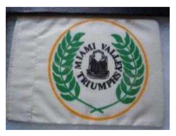
MVT Car Flag - $5.00