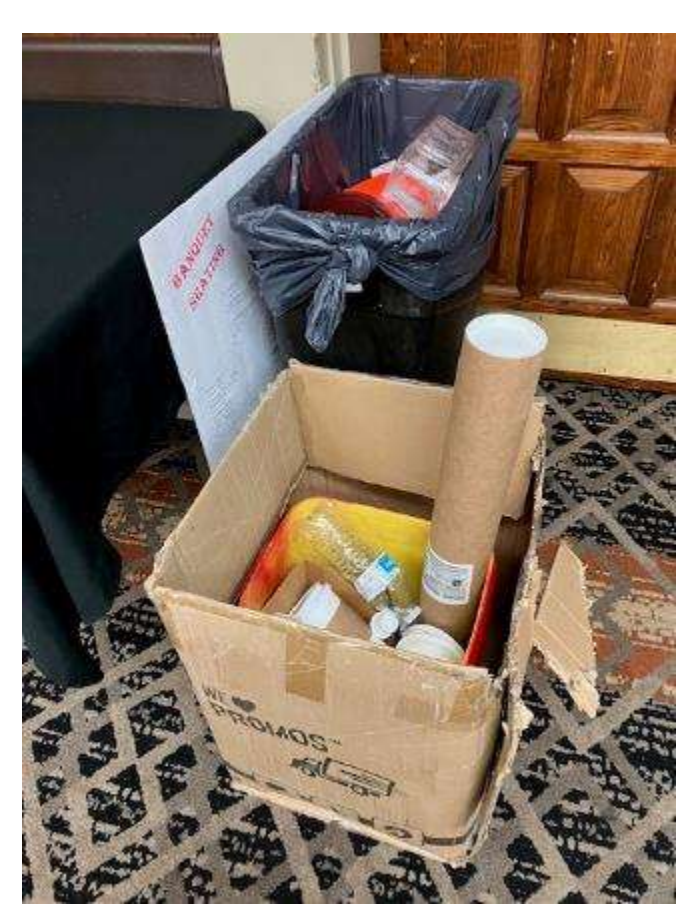
All that was left of the registration room Friday before we left. All that work and this was all it came down to – lol...