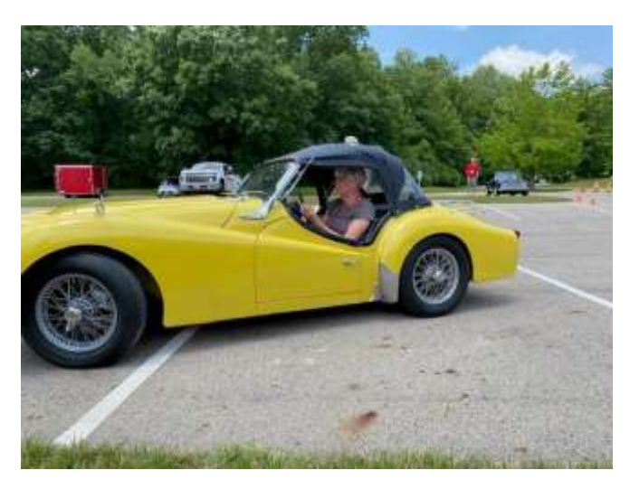
After the car show was over we ran The Idle Threat – an anti-autocross that judges how slow you can go around a course – here is