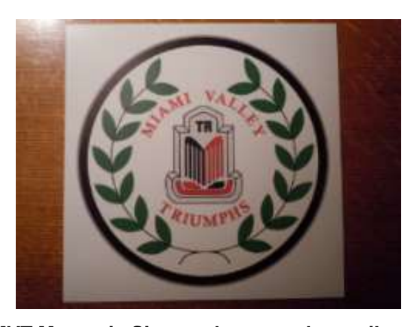
MVT Magnetic Signs – these can be easily cut so they are round. They are 12"x12", 11" in diameter if cut round. - $12