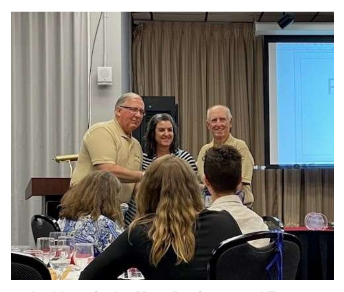
And here is the Meet Registrar and Trusty Sidekick winning an Award (think it was second place in the Hotel Rally?) - full list of winners in next Marque