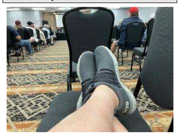
My favorite position at TRA 2023...