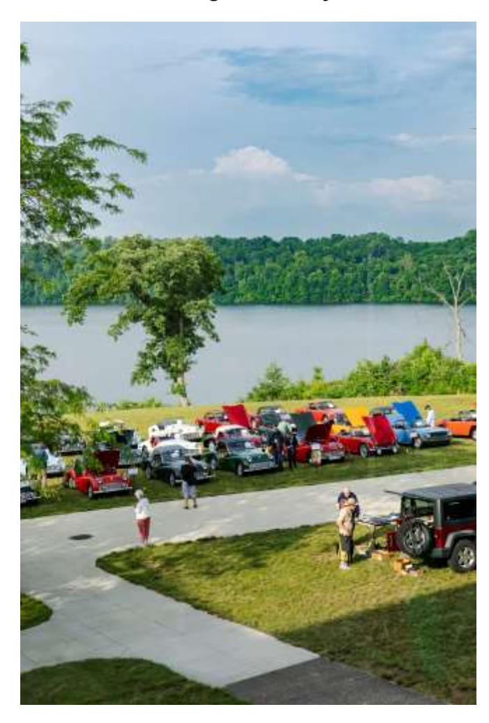
One of many shots of the car show on the shores of Acton Lake – Chris Yanity in the foreground setting his autojumble display up – he made good money – ask him to buy your dinner!