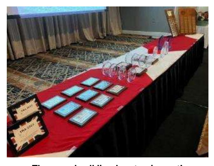
The awards all lined up to give out!