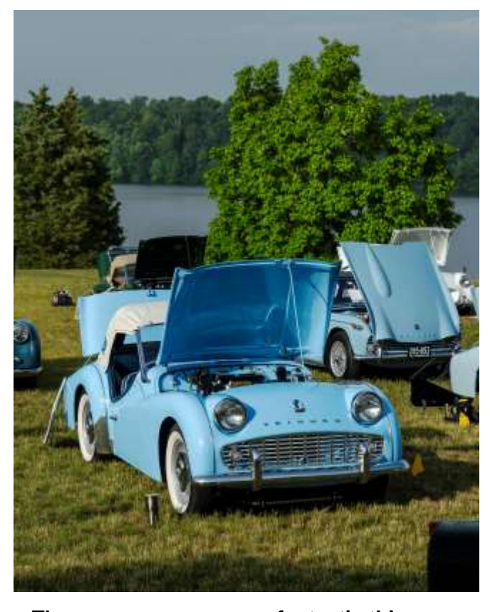
The concours cars were fantastic this year. TRA has very strict judging guidelines and all the cars scored above 90 points.