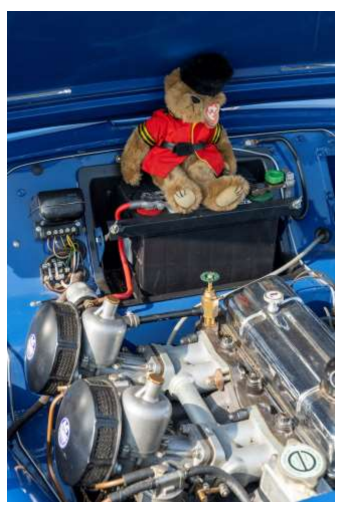
PSA: No animals were harmed before, during, or after the execution of TRA 2023...