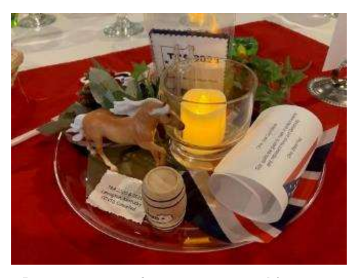
Banquet centerpieces were reused from our abortive tries at 2020 and 2021 – thanks Chris!