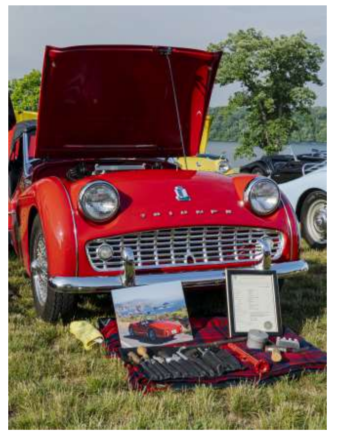
The Sissons were from California, so they did the traditional Triumphfest display at their car!