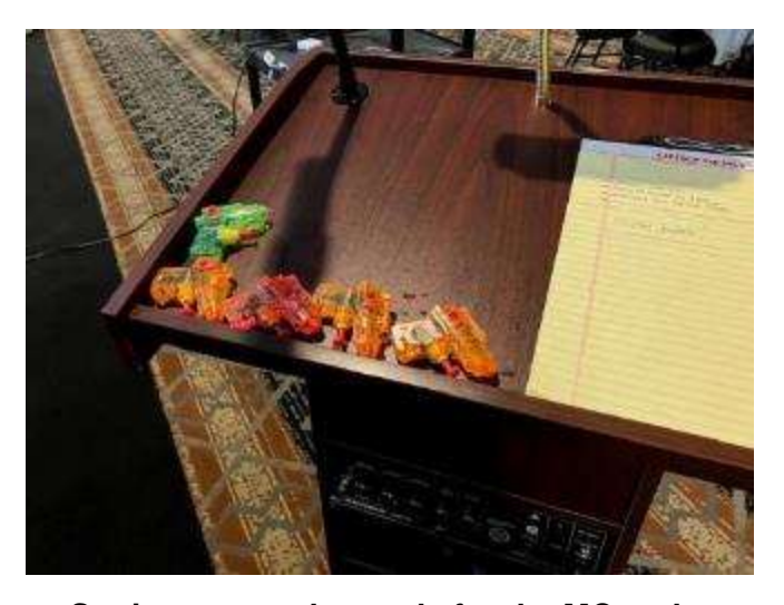
Squirt guns at the ready for the MC at the banquet – squirt guns were out in force at TRA 1987 and made a strong comeback at TRA 2023...