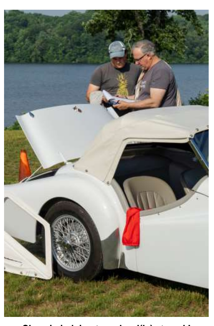
Chassis judging team hard(ly) at work!