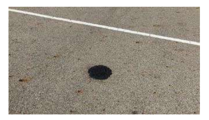
Marking its territory...