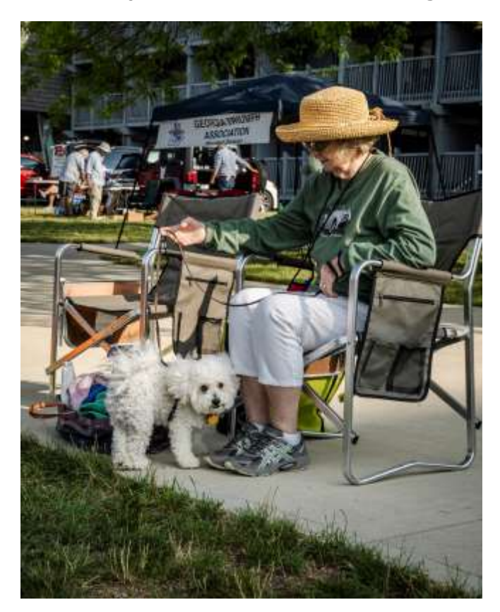
Not all TRA participants had just two feet...