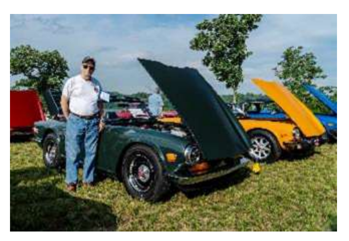
Hey look - it's our VP!