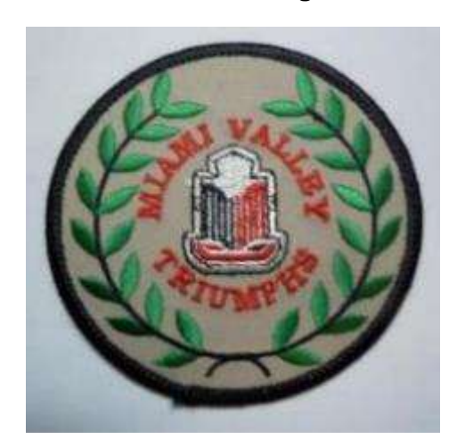
MVT Cloth Patch - $12.00