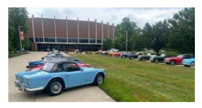
Another shot of the TRs in front of Millett Hall