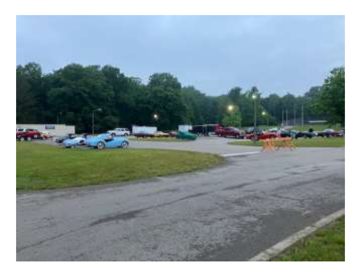
All good thing must end - parking lot early Friday morning before the exodus - safe trip home everyone

So that was it - a week filled with fun that I just scratched the surface with a few pictures.