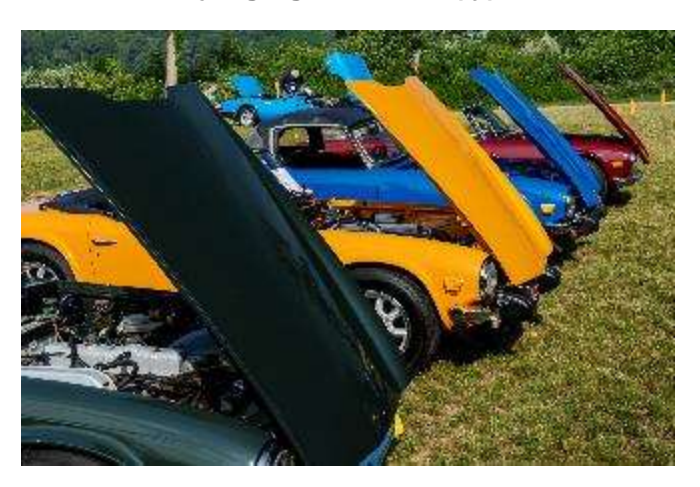
We had a great selection of TR6's at TRA 2023 – and all were very nice cars!