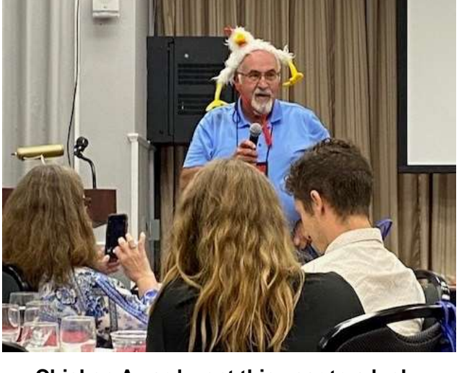
Chicken Award went this year to a lucky individual that almost lost both front tires due to misalignment – how stylish!