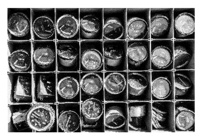
Doug's Parts brought a few gauges to the Autojumble...