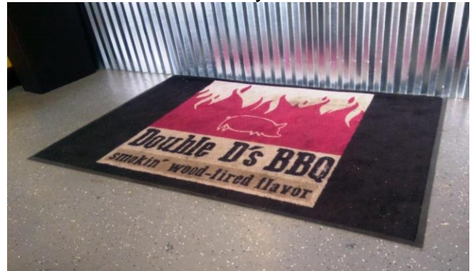
A new force to be reckoned with in Corwin