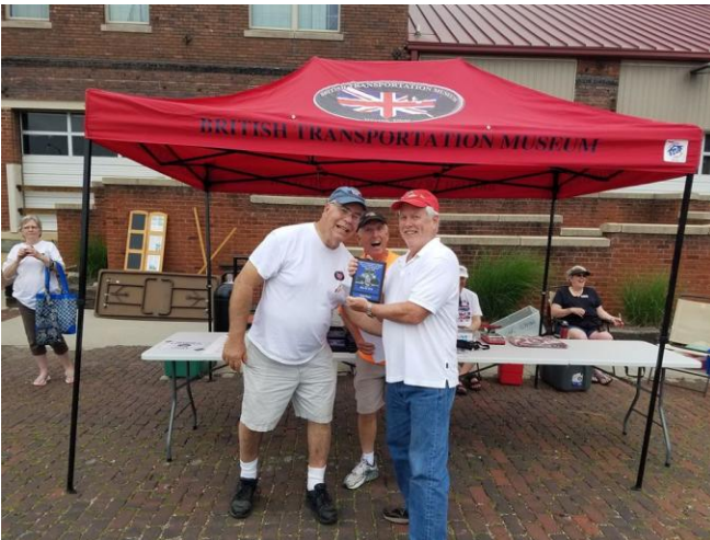
What a bunch of loons!

-JUDGING CLASSES- CLASSIC/MUSCLE-TRUCK-STREET ROD-BEST ENGINE-BEST PAINT DOOR PRIZES - 50/50 RAFFLE - MUSIC - FOOD JUNE 3RD 5PM - 9PM VOSS USED CARS 99 LOOP RD CENTERVILLE OHIO 45459