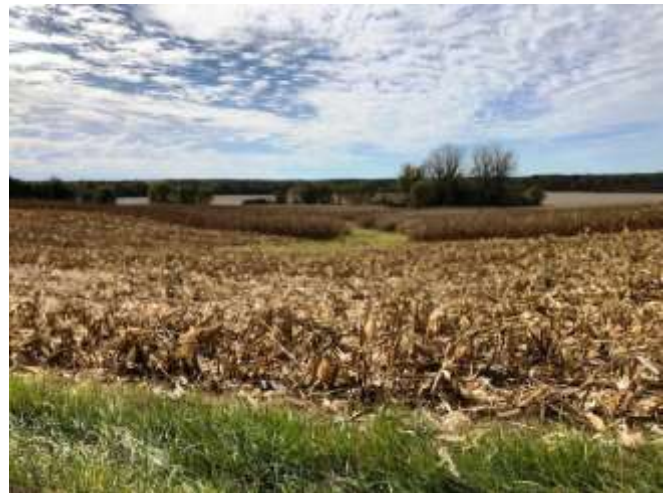
Looking SW over Little Miami River Valley East of Waynesville

17 – TRA 2020 Committee meeting – Thanks to all who came out to the TRA 2020 planning meeting @ Zemore's. The place was jammed and the chef only had himself and two wait staff working due to the rest of the staff (including his family) off at his daughter-in-law's rehearsal dinner. Even with that dinner came out fairly quickly and was uber tasty. We had a good turnout as well as meeting – went over a lot of stuff. Planned a lot of stuff. look for topics discussed and more comments later in the Marque.