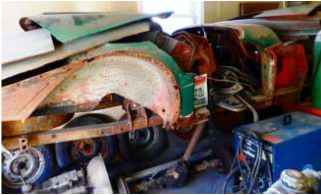
Just a little bit of work here...