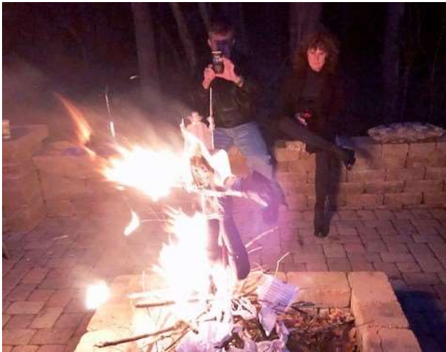
Burn, you treacherous rascals!