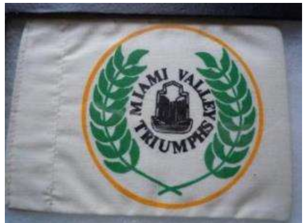
MVT Car Flag - $5.00