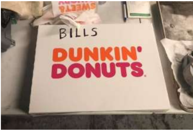
The bait was set for the 12 Oct OYJ Tech Session. No subterfuge here, nope...