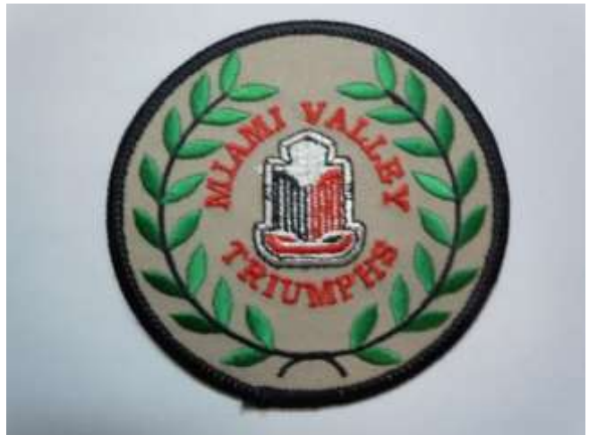
MVT Cloth Patch - $12.00