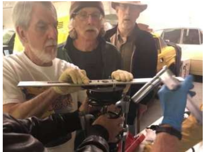
Ooooooo, Ahhhhh, Wowwwwww!

17 – TRA 2020 Committee meeting – Thanks to all who came out to the TRA 2020 planning meeting @ Zemore's. The place was jammed and the chef only had himself and two wait staff working due to the rest of the staff (including his family) off at his daughter-in-law's rehearsal dinner. Even with that dinner came out fairly quickly and was uber tasty. We had a good turnout as well as meeting – went over a lot of stuff. Planned a lot of stuff. look for topics discussed and more comments later in the Marque.