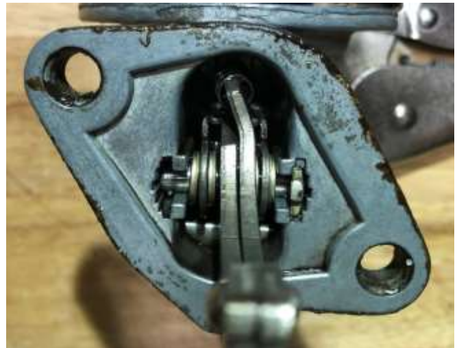
Pump off of John's car – note the left-hand wedge is missing, the right one was loose – this caused the shaft to translate and not rotate, and not pump

This seems like an inherent fault in the design and as such all people using these pumps should inspect them for shaft wedge failure in my opinion. Again, in my opinion one should stop using these pumps unless you do not plan to drive the car very often. If you do plan on driving the car I'd suggest using either an electric pump and a blanking plate, or probably my preferred option, rebuild a good original AC pump that has the shaft going through the pump body. Another option is Rimmers has a pump available from a Slovakian company that also uses peened body metal to hold in the shaft, but in this case the body metal seems to have a higher aluminum content which probably makes it more ductile and it uses a much greater area of peened metal which lessens the per-area stress on the peened metal. That said, it's still peened.