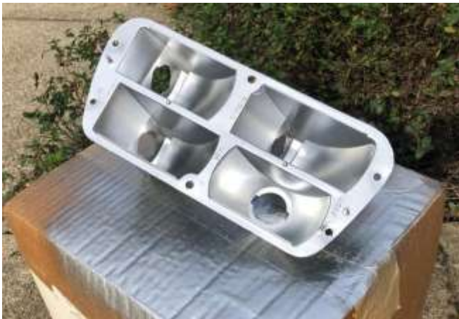
Chrome painted tail light housing

Inspection showed the chrome was shot on the reflectors – I expected that after working on too many Wedges. It is not an option to get out the #0000 steel wool and shine it up – the chrome layer is much too thin for that. I just shoot it with a good chrome paint.