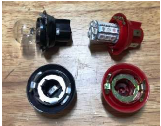
Original single filament bulb on the left, new dual filament bulb holder and dual brightness LED lights on the right.

Now, you just can't order these from Moss or VB – you have to go to British Heritage Motoring in the UK, and there you can order the TEX dual-filament bulb holder, so four I ordered and they showed up several days later.