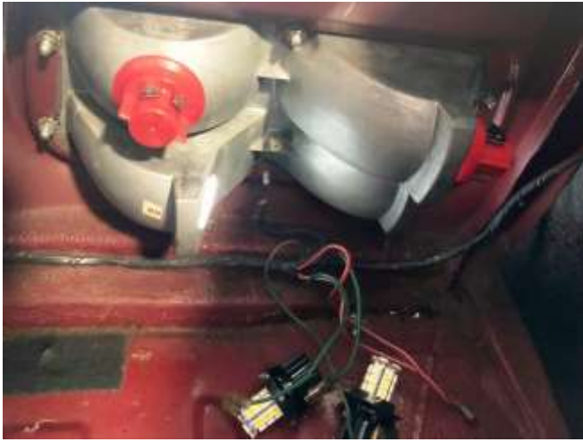
Left side housing back in car with new bulb holders trial fit

Turns out the holes for the original and new bulb holders are not exactly the same and you have to bend the holding ears just a little bit. I also added a ground wire to each new holder because I could.