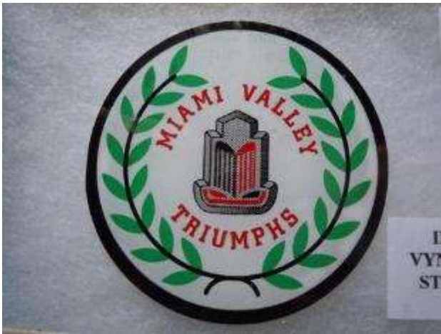
MVT Window Sticker - $1.00