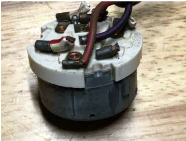
Tang with intact peen in the tang on the ignition switch

Pot metal is cheap, but it is also very brittle, you bend it, it cracks. The process of “punching a tang” is bending the metal. Peening (punching) pot metal doesn’t seem like a great idea. It’s not. Every time you use the ignition switch you cycle the load on the peened tangs which grows any initial cracks caused by the peening. Since cracks are guaranteed to be there due to the material properties, the ignition switch is a failure waiting to happen – it is not if , it is when .