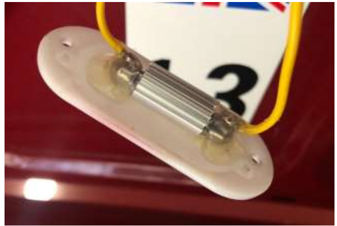
Who needs bulb holders when you have Gorilla Glue and hot glue...

Okay, so I tried to do what I did on Inca, bend the metal bulb contact/holder prongs a bit so the bulb can fit in and make contacts. That would have worked if the original light base wasn't brittle plastic and didn't crack. Rather than buying a new holder, I just Gorilla Glued the light to the lens. Fixed.