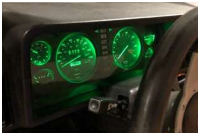
Nice and green!

The results range from wow to okay. The gauges are lit beautifully, but the switch lighting is only a little better. I'll take 50% right now.