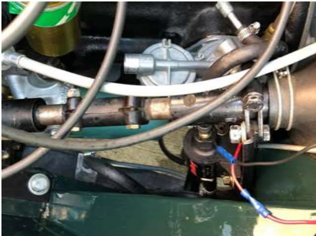
Non-working mechanical pump in place, working electrical pump below steering shaft

5 – Tech Session – We met at Coutant's to fix both fuel pump and tachometer issues.