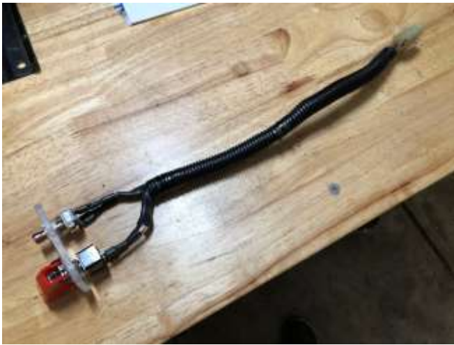
New emergency switch panel and wiring harness