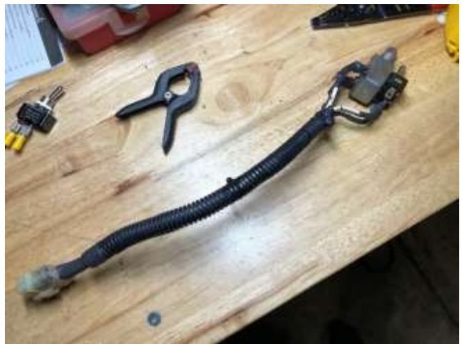
Emergency switch kept in Inca

Well, glad I never tried to use this one, lol. Now to make an emergency switch panel. The one I made years ago for Inca looks like this: