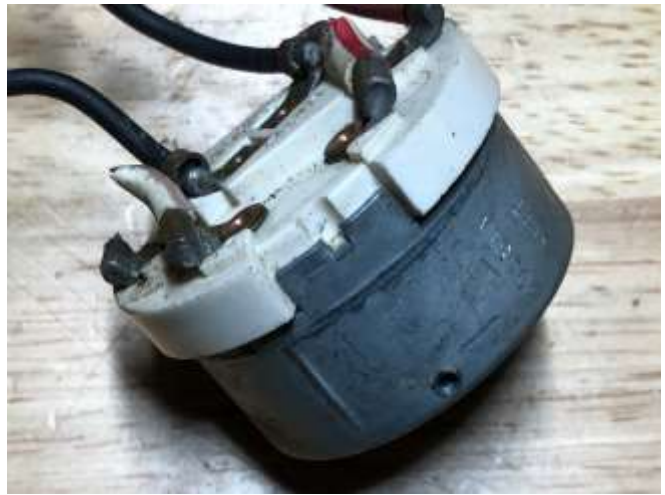
Peened tang with the peened part broken off by normal use - this switch has failed

Well, glad I never tried to use this one, lol. Now to make an emergency switch panel. The one I made years ago for Inca looks like this: