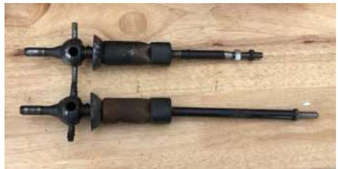
Original shifter on bottom, shortened shifter on top

Fortunately I had another shifter sitting in spares, so I took that to a local machine shop and had several inches taken off.