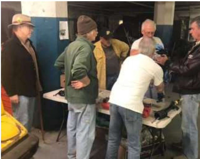
Suspension work, or Craps game? You be the judge...