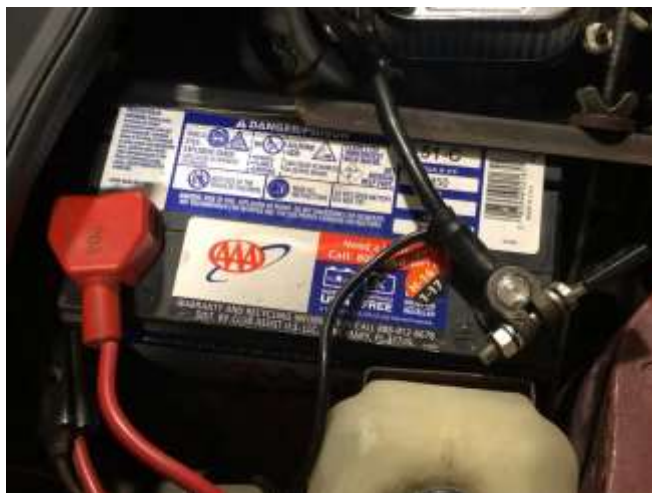
Battery, Type 51-C

So first, does anyone see anything amiss here?