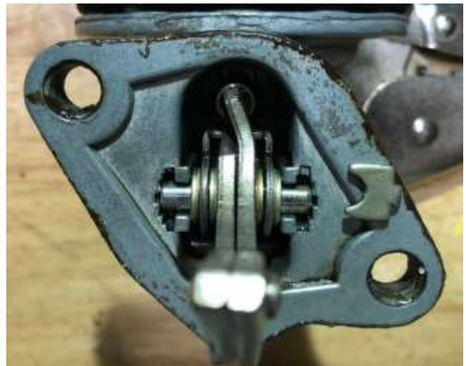
Another shot of the failed pump with the right-side wedge removed. You can pull the shaft rearward about 3/4 inch. Nonfunctional.