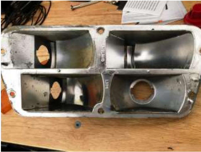
Right side tail light housing

Inspection showed the chrome was shot on the reflectors – I expected that after working on too many Wedges. It is not an option to get out the #0000 steel wool and shine it up – the chrome layer is much too thin for that. I just shoot it with a good chrome paint.