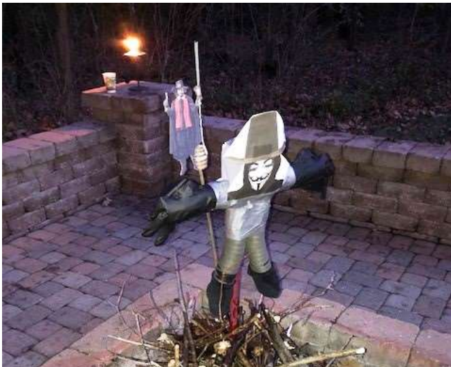
Dinner? Two Guys on a stick!