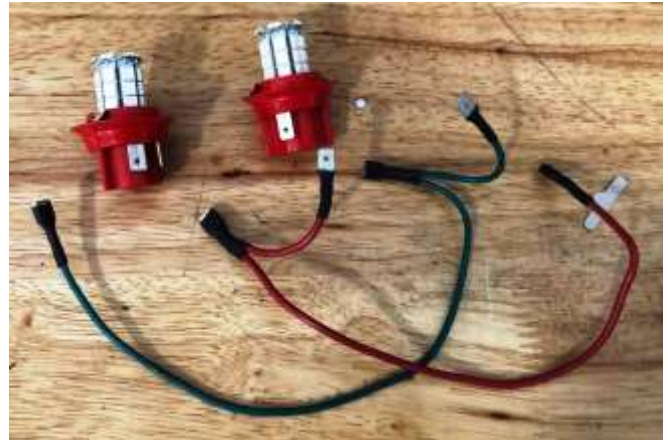
Bulbs, holders, and added wiring per side

the bulb holders and one male connector to plug into the existing connector. Since there are two bulbs per side I needed to make four of these.