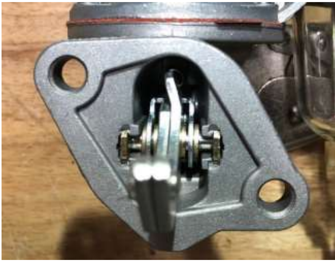
New Moss Pump 377-000 – note the Gold Cad Clad wedges on either side of the body – they go into slots in the body then the ends of the slots are peened (staked) to hold in the wedges which hold in the shaft

This seems like an inherent fault in the design and as such all people using these pumps should inspect them for shaft wedge failure in my opinion. Again, in my opinion one should stop using these pumps unless you do not plan to drive the car very often. If you do plan on driving the car I'd suggest using either an electric pump and a blanking plate, or probably my preferred option, rebuild a good original AC pump that has the shaft going through the pump body. Another option is Rimmers has a pump available from a Slovakian company that also uses peened body metal to hold in the shaft, but in this case the body metal seems to have a higher aluminum content which probably makes it more ductile and it uses a much greater area of peened metal which lessens the per-area stress on the peened metal. That said, it's still peened.