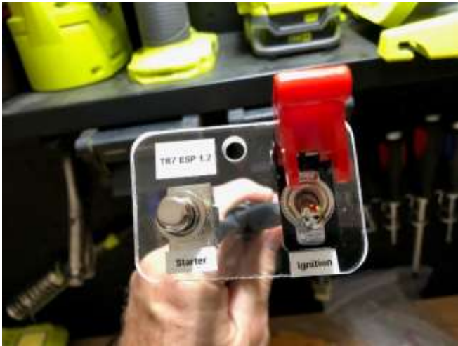
The switch panel – hole in the top is to use a long wire tie to hold it up when in use.