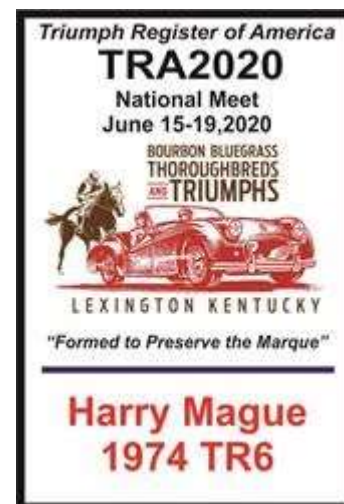
Dash Plaque Design 3