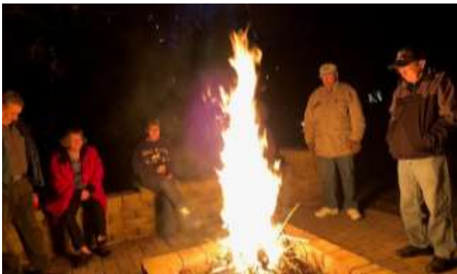
Soon all were bathed in the glory of the Guys' demise!

Afterwards a few of us snuck down to The Den for a few wee drams of good whiskey while the rest of the team debated whether to burn the rest of