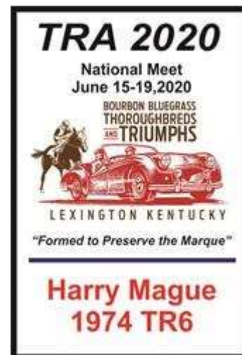
Dash Plaque Design 2