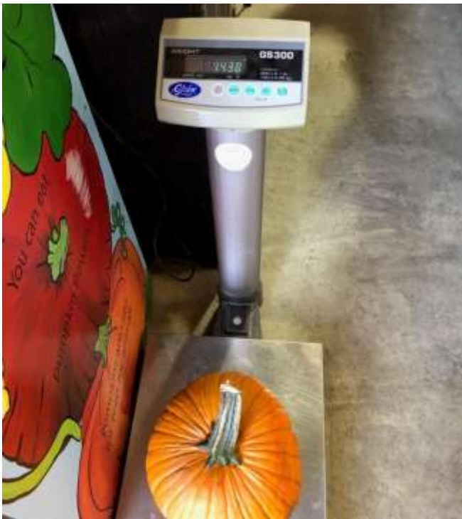
Houston, we have the pumpkin!

After we had our fill of Pumpkins the longest leg of the drive commenced – from Spring Valley to south of Oregonia then back up near Waynesville back and forth over the Little Miami on some of the prettiest roads around here. Had to stop once