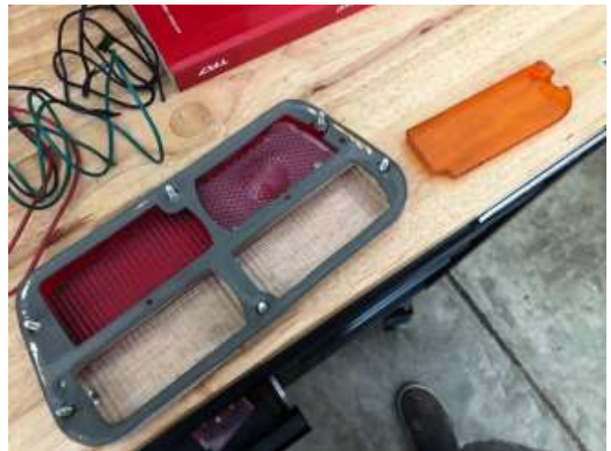
Amber filter separated from the lens – it just pulls out easy

Connections were soldered and protected with shrink wrap. Now to put things back together. One of the things I didn't put back on was the amber filter used for the turn signals – this is a separate piece and comes right out. Since the turn signals are amber anyway this is not needed. (Note that I am keeping all the parts I take off the car for the next owner, so these will not be in the Holiday Soiree bags).