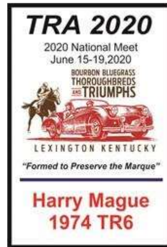
Dash Plaque Design 1

We have three designs and we are looking for your input.