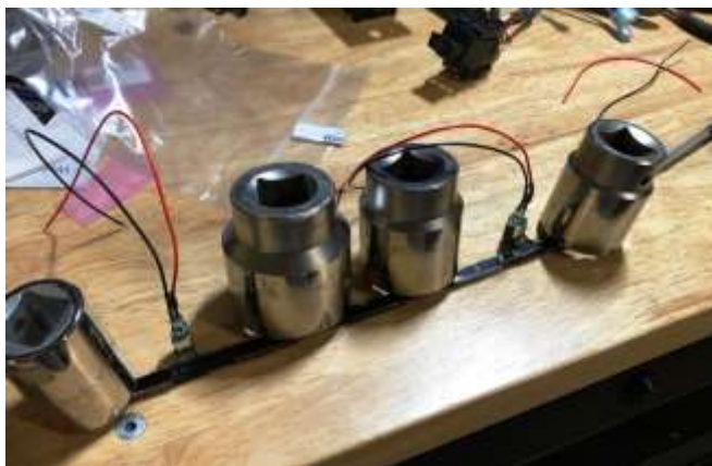
Fixing the switch lighting for good

The switch labels on the switch panel have always been problematic to get good brightness. If you look at how it works, light from the side of a bulb goes through green paint on some clear plastic – once inside the plastic light travels through a 90 degree turn into the back side of the label bar. The labels are molded into the plastic so they are illuminated by the light passing by. To get more light into the bar I affixed some white LEDs directly on to the light entry point, then silver painted that with shrink-wrap over the outside to try and keep light inside the LED-plastic junction.