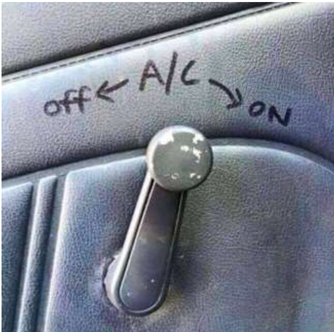
Overlooked AC option on most Triumphs