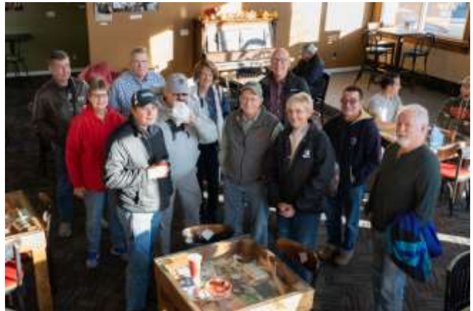
The gang's all here!