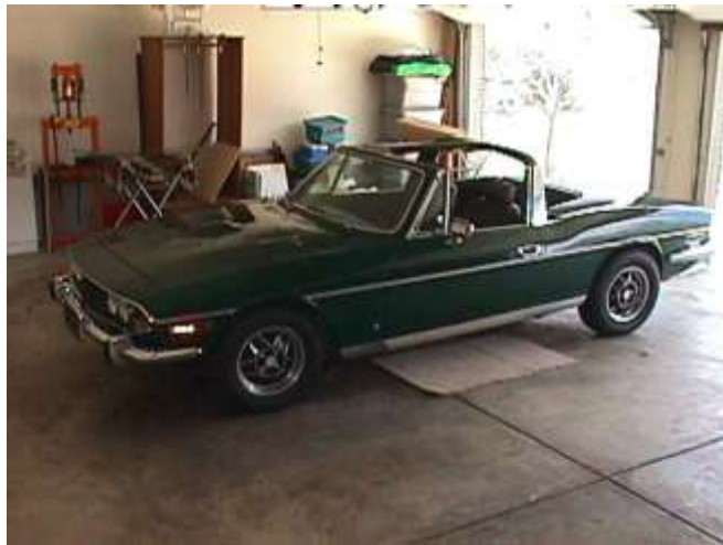
Fall 2004 – As it came

The FrankenStag is now sold and waiting to head to a new owner in VA. When we bought Carma I knew it was time to get rid of the Stag. The car has been an interesting experience – essentially a fun car to do anything to because you could. It allowed us to go as a family to Triumph events and shows, but now the kids (and one is not a “kid” anymore) have cars and drive themselves