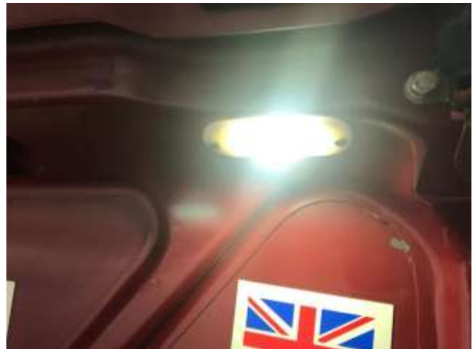
Let there be trunk light!