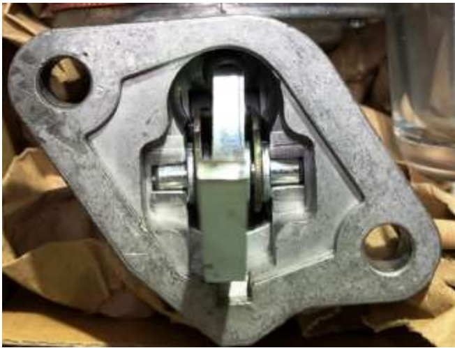
Slovak fuel pump