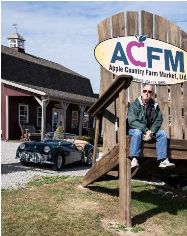
A man and his car – a beautiful thing!