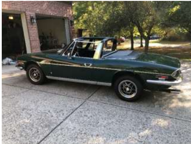
Fall 2019 – last drive

and cannot fit in the back seat anyway. The car is actually a bit of a chore to drive without fantastic maneuverability and is a little underpowered, so it wasn't a hard decision to make.