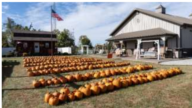
We found them!