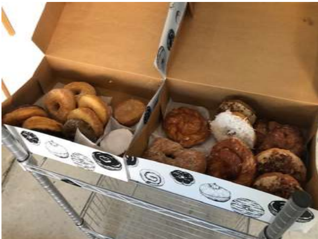
MVT Hook was baited