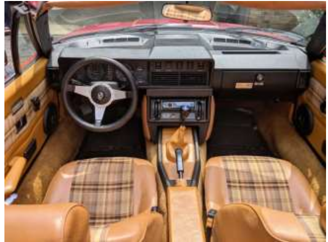
Carmine as it came – high shifter and pointed to the right.

So what does that have to do with TR7s? Easy, Big Daddy Rat designed the shifter on the TR7 we just bought (now called “Carmine” due to the paint. If you looked at the car as we got it (below) you’d notice that the top of the shifter is almost higher than the radio level. It shifts, but the throw is long and wide plus it’s easy to miss 3 rd and finally it sits in neutral pointed right, not straight up and down.