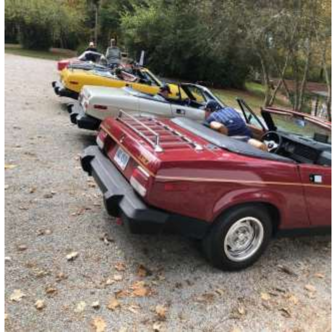
All the purty cars parked in a row at The Secret Garden

when the clutch pedal connector pin fell out of Karl's TR7, but we were back on the road before I could give him a chicken. Our long tour leg ended up at the Secret Garden on OH 73 just west of Waynesville for folks to look for yard art and other seasonal goods.