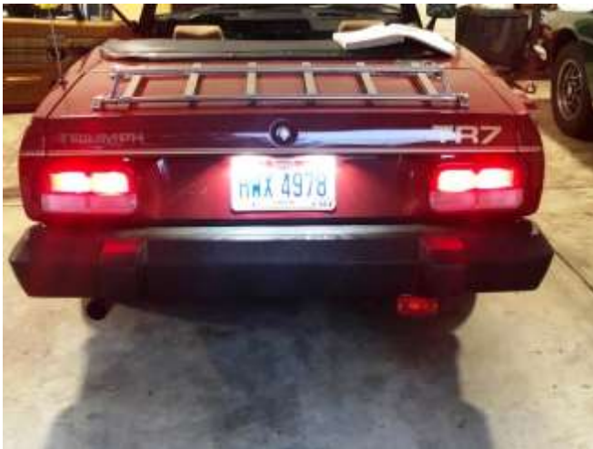
Rear tail lights – brighter and less power draw, and less heat if anyone cares...

Firing up the lights I am happy – much more light, much less current draw. Total time to do this was three hours, but I was multi-tasking (which I cannot do BTW) so it was less if this was all you do – I did put the painted housings in the sun with a fan on them on an 80+ degree day, so that helped also.