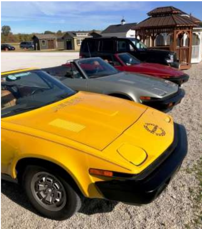
Three '80 Wedges all in a row...

when the clutch pedal connector pin fell out of Karl's TR7, but we were back on the road before I could give him a chicken. Our long tour leg ended up at the Secret Garden on OH 73 just west of Waynesville for folks to look for yard art and other seasonal goods.