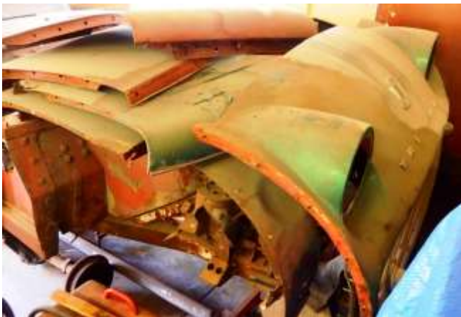
Hey – that nose looks pretty-darn straight!