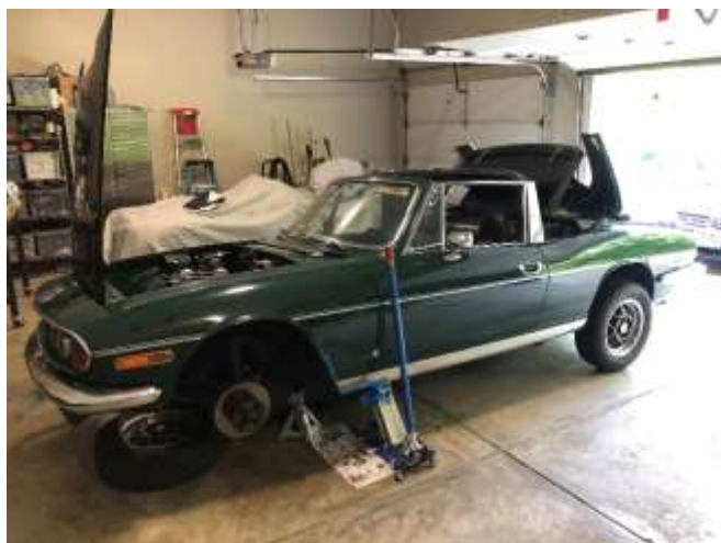
To new home...