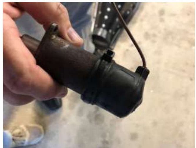
No, the tie is not factory...

First thing we did was pull the OD solenoid and check it. The nylon tie around the weather shield rubber indicated someone has been here before.