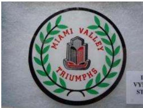
MVT Window Sticker - $1.00