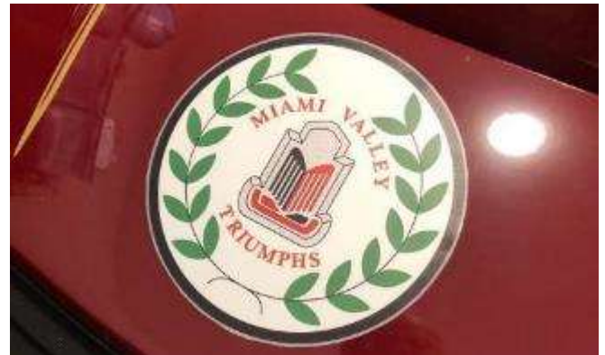
They look very spiffy on a TR7...