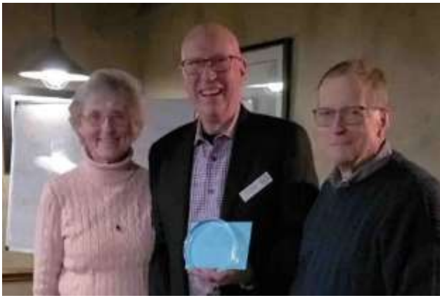
Keep it on the road went to the Whites and their driving of their TR6