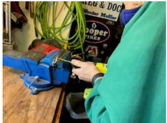
John making the plate fit

First step is to remove the current points and condenser from the distributor. After everything is removed, a mounting plate to hold the Pertronix sensor is installed. This is where we stopped before. This time the fit was better but we still had to enlarge a few of the smaller holes to get a good fit. The Pertronix unit is then held to the mounting plate with two nuts and a ring with magnets is slid over the shaft of the distributor. Directions were to adjust the gap between the ring and the unit to 0.030". Of course, the gap was too big so some more drilling to allow the adjustment to close to thirty thousandths. Then cut the wires to the Pertronix unit to length, solder on some fittings, and connect to the positive and negative side of the coil. Put the rotor and cap back on and good to go.