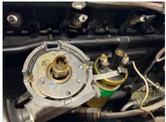
Hey, this plate fits!