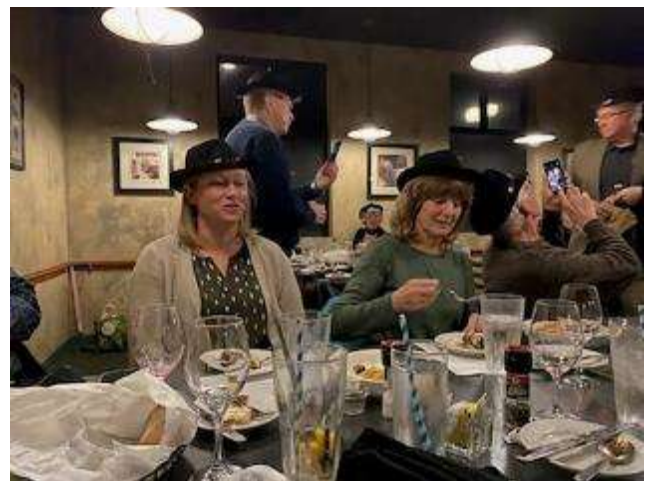
Fedora Central – we all feel very spiffy now!