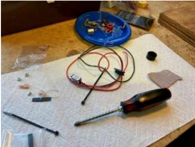
Little wires ready for modification...

Next is timing. It seems that a Pertronix unit is shifted a bit. TR3s are usually timed statically and we had an outline for that which we tried. It did not seem to be correct. It was getting late and so we timed it by ear. That ended up fairly close and a quick ride around the block seemed OK. With some time, we'll come back to the timing, probably trying dynamic timing at higher rpms. Stay tuned.