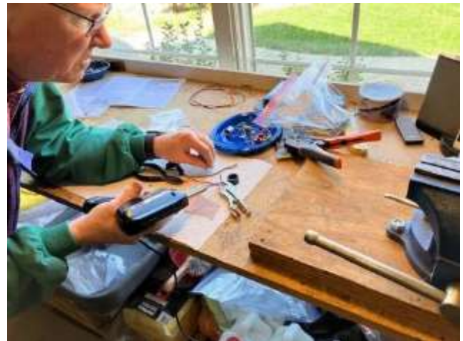
Little wires being modified...

One note in the instructions I overlooked was not to use with solid core wires. Why? Well digging around the internet it seems solid core wires do not suppress electromagnetic interference (EMI). With solid core wires the EMI/RFI is strong enough to interfere with electronic ignitions, even cause damage especially at high rpms. I had a set of solid core wires in the TR3 (which I did not know were solid core until after) but luckily one of the connectors broke and so we used my backup cap and wires (which I did not realize were suppression wires). I went to get a replacement set of suppression wires for my main cap and discovered it is not easy to get 7mm wires or understand if are suppression wires (they need to be 7mm to fit in the distributor cap as standard 8mm don't fit). I did manage to find a couple places that had black 7mm wires for a Triumph TR3.