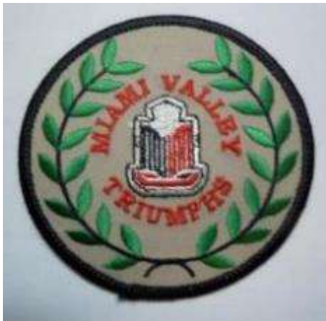
MVT Cloth Patch - $12.00