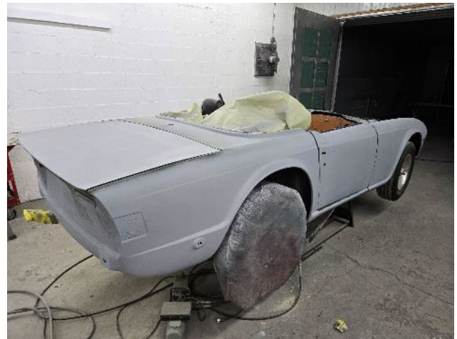
Chuck added primer for the celebration