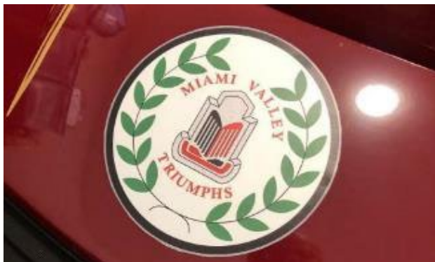
They look very spiffy on a TR7...