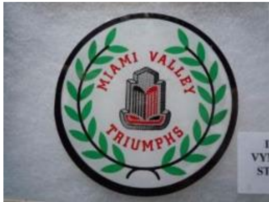
MVT Window Sticker - $1.00