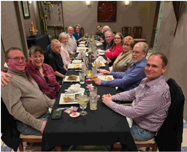
What a crew!

MVT has its Valentine's Day Dinner at El Meson on the 22 nd . 16 folks showed up for good food, good drinks, and, well, we might have some stories about service, but all was well in the end.