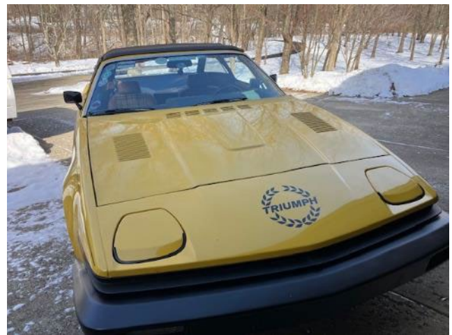
Bruce threw in a January pic...