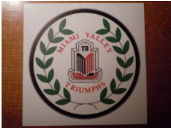
MVT Magnetic Signs – these can be easily cut so they are round. They are 12"x12", 11" in diameter if cut round. - $12