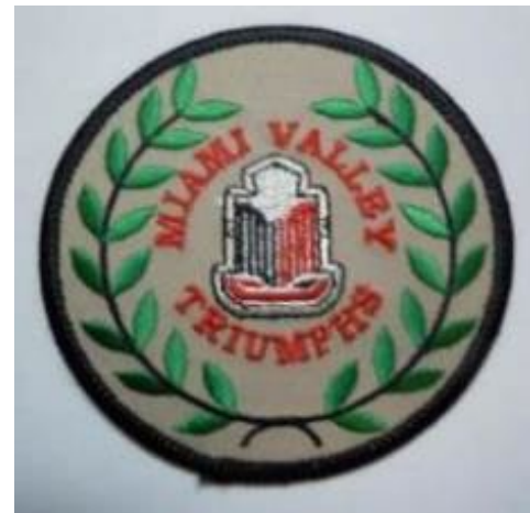
MVT Cloth Patch - $12.00