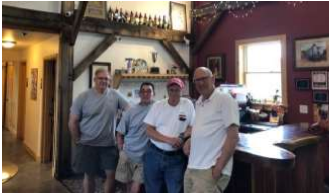
Last winery in TN – the MVT Lush Team by the bar – their smoothies are incredibly dangerous!