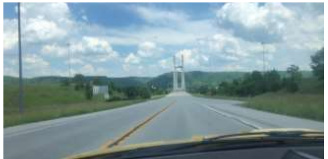
Crossing back into Ohio – beating it home before the rains came!