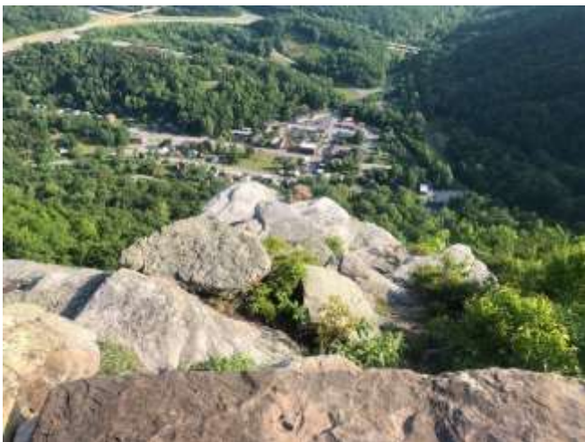
And this is the view down to where we were staying.