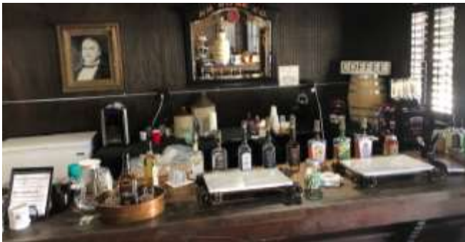
Next day I led a local distillery tour – this was the Rose Distillery that was just in front of where we were staying...