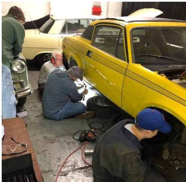
MVT'ers giving it more love