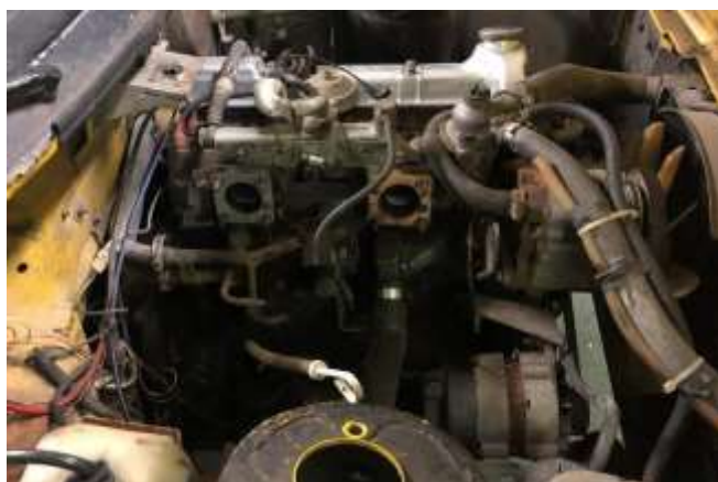
More love even - the Sisters of TR7 Mercy are striking!