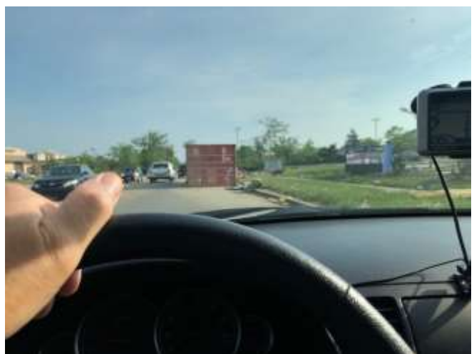
This is why you want to be below ground level during a tornado – this container full of construction materials was blown over 50