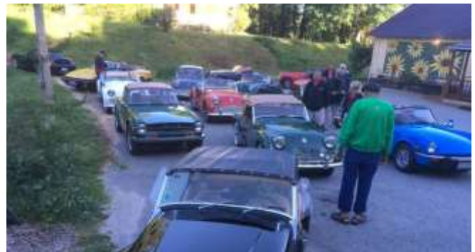
Here we are at the Breakfast stop – worked well! Tasted good – after this we went to a couple of pottery shops and then helped Ed and Marcia Oot whose TR4 had a clogged fuel line, and Ashford Little who blew a tire on his TR6 – chickens for the masses! We spent the rest of the day working on folk's car, or attending several workshops.