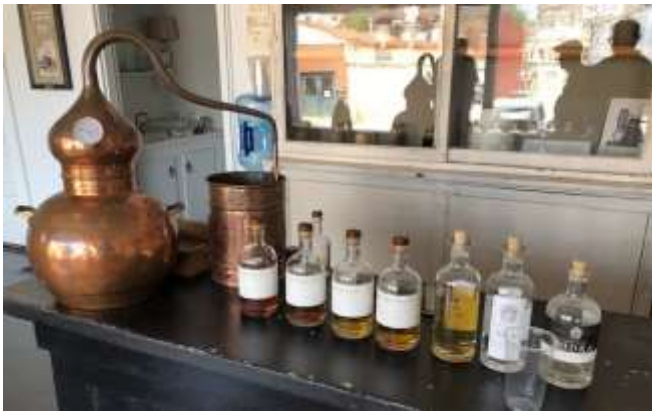
...bourbon – you guessed it – guilty!