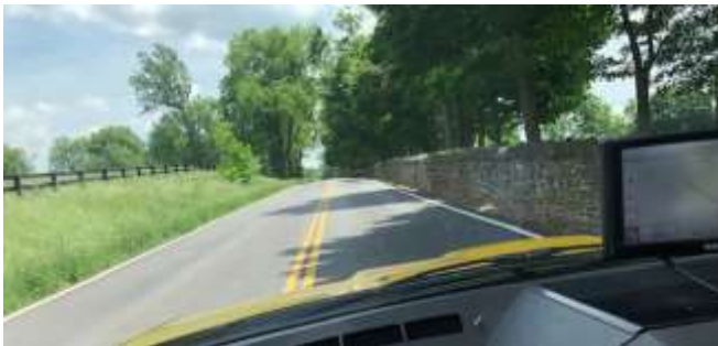
South out of Paris is pure horse country – stone and wood fences line to road as you pass the big horse farms – more TRA 2020 roads!