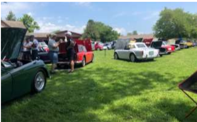
Another shot of the Concours