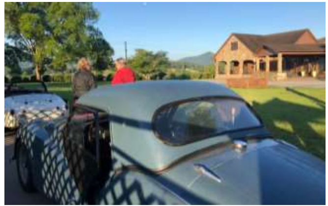
Next morning we lined up for the Early Morning Run to breakfast.