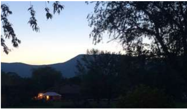
Night is falling – the view west to the mountains from my parking lot.