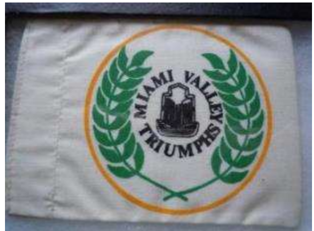
MVT Car Flag - $5.00