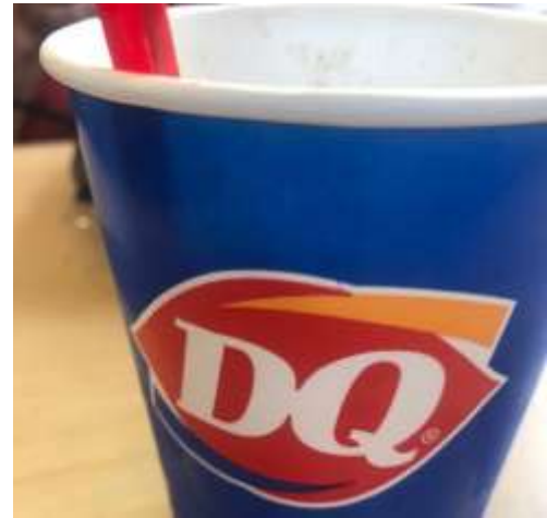
Lunch at Paris Kentucky – what else?