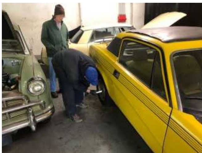
Jackson applying love