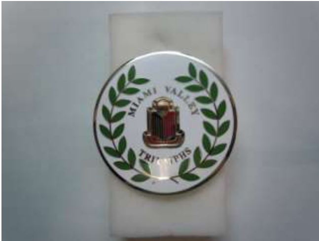
MVT Enamel Car Badge - $30.00

The Club has the following fantastic, wonderful memorabilia for sale. Show your colors in public, on your car or on you! Look at all we have: