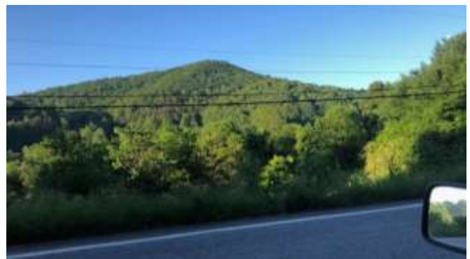
The Early Morning Breakfast Run took us through some great scenery – here we are in the mountains west of Clayton, GA.