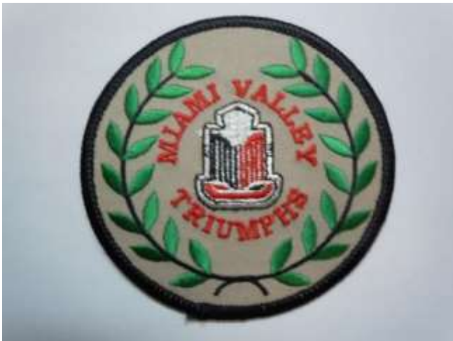
MVT Cloth Patch - $12.00