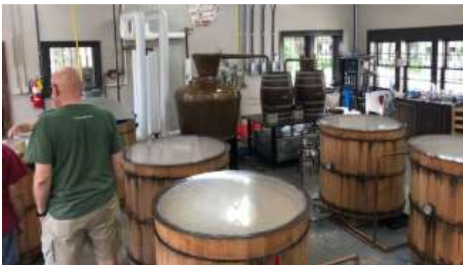
...which actually produced some fine bourbon. Talked a bit with the master distiller who had worked at some of the large guys in his past. Nice operation!