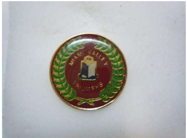
MVT Pin - $5.00