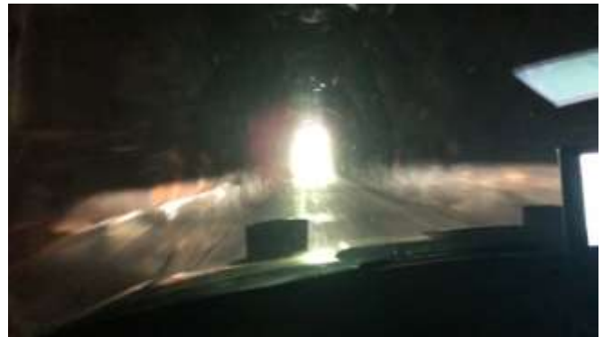
We next drove through Red River Gorge area with a one-car-at-a-time tunnel – try driving this with sun glasses on!