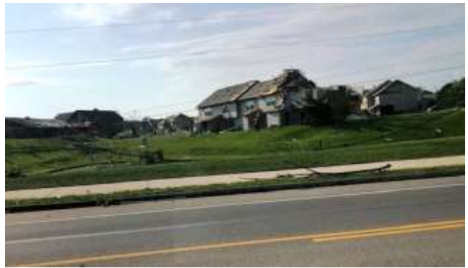
Apartments off Grange Hall damaged – the area between Grange Hall and Kemp is thick with apartment complexes and most had damage of some kind.

Ed: a few shots from Grange Hall, Kemp Road part of Beavercreek. Pls remember to give a bit more through whichever charity you can.