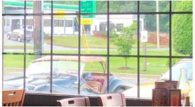
Next morning breakfast at a Cracker Barrel – been years since I’ve done this!