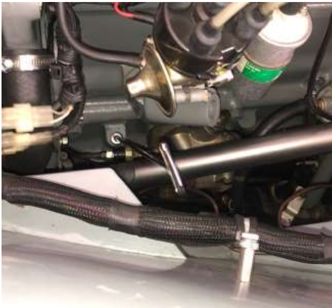
My one buy at TRA 2019 – a chrome dip stick for The Grey Ghost – nice!