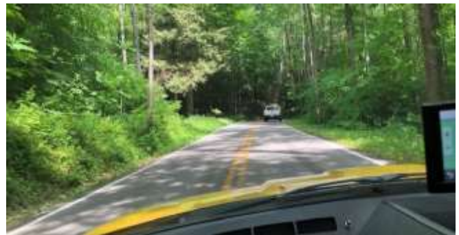
Once outside the tunnel the roads were very twisty and turny, and slow behind the park ranger's pick-up!