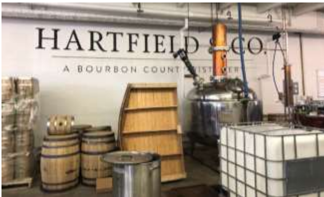
Hartfield & Co is just in Paris KY, and might be on a TRA 2020 trip...