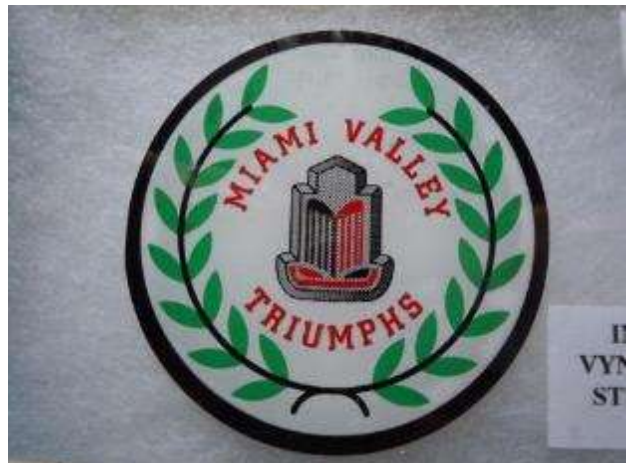
MVT Window Sticker - $1.00