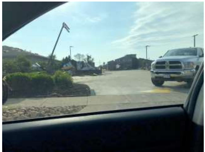
Mike Car Wash on North Fairfield was pretty much destroyed.