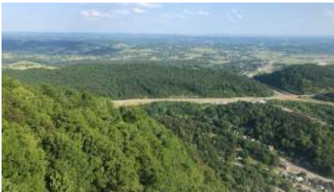
That night we stayed at Cumberland Gap TN – this is a view SE from the top of Cumberland Mountain in Cumberland Gap Park