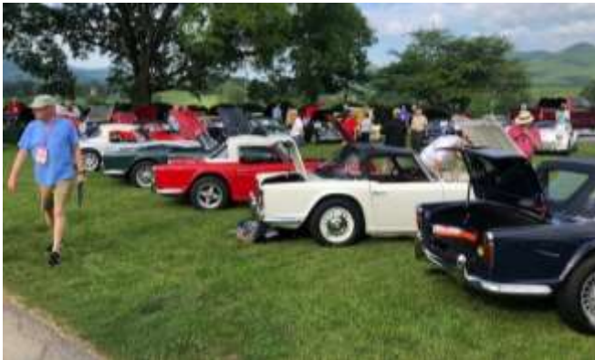
One shot of the Councours.