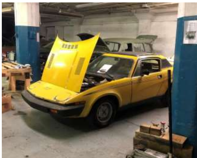
Looking a little lonely, it needs love.