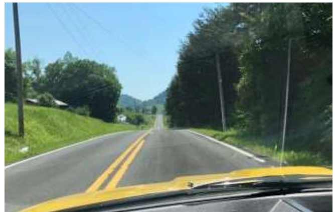
Morning of the 18 th saw us on some great state routes through the mountains. Due to detours maybe not the roads I wanted to take, but good twisty roads anyway!