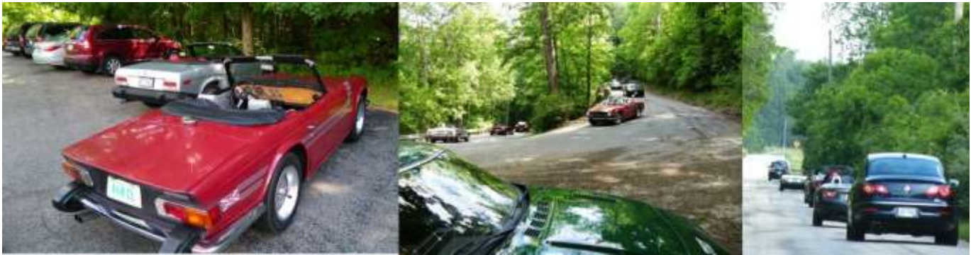
Oh, yes, there were Triumphs on the run, physically there as well in spirit!