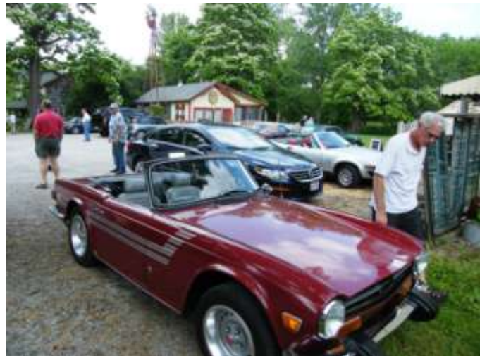
MVT Cars at Verona Shops