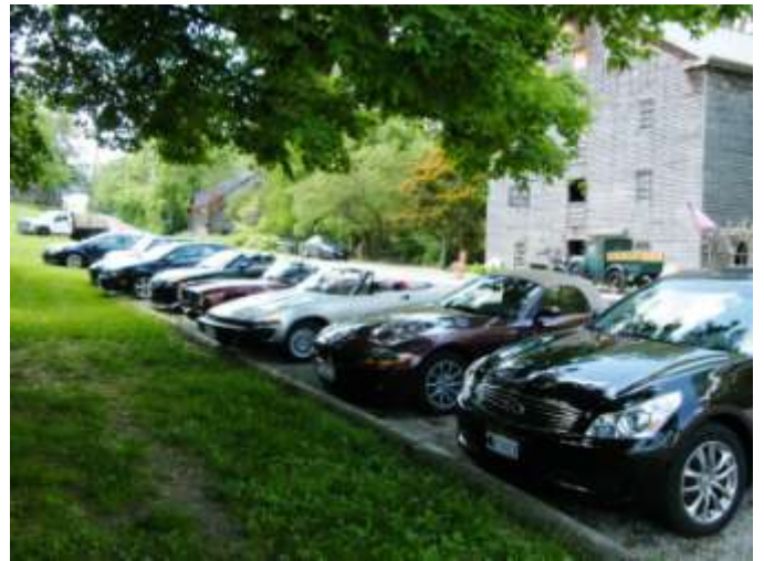
MVT Cars at Bears Mill