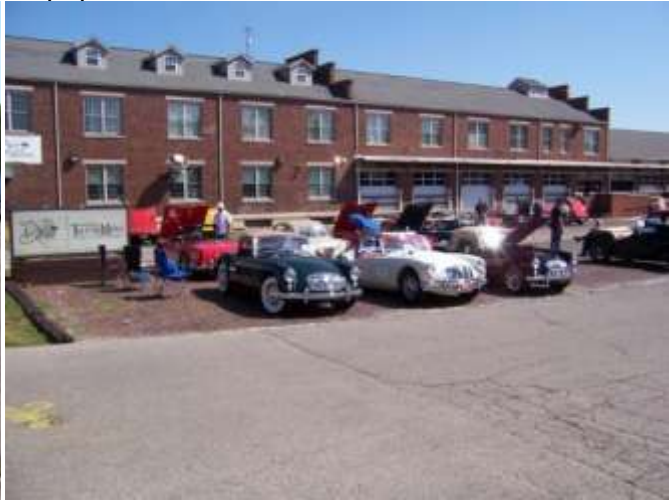
Several views of the show field early in the morning at the BTM-BCD@2ndStMrkt! (got that?)