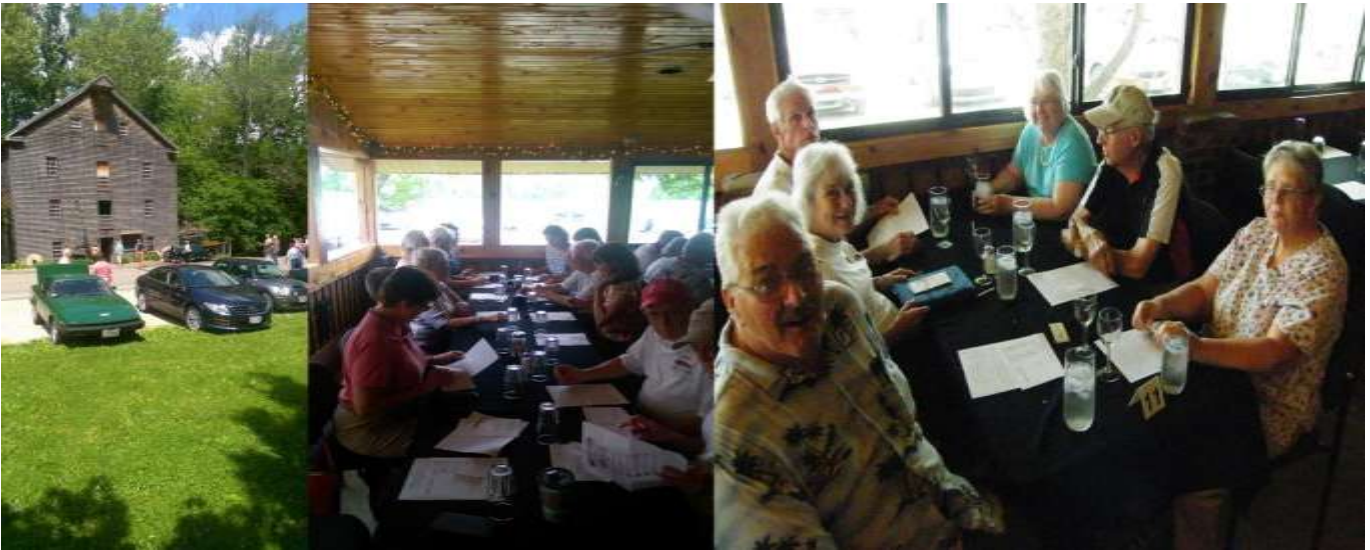
Bear's Mill to the left, center and right was the happy lunch crowd at the Winery at Versailles

After stuffing our faces with food and drinking specially-rotted grapes we headed south and east, stopping at an antique store, okay, actually it was an antique, junk, collectables, lumber, custom furniture, poultry, flea market. Any place that has a wandering male domestic turkey named Buster is okay with me. Anyway, we stayed there until it looked like a thunderstorm was going to over-run us, then we high-tailed it to the Old Mason Winery near West Milton to wait out the storm. Tough thing to do, you bet!