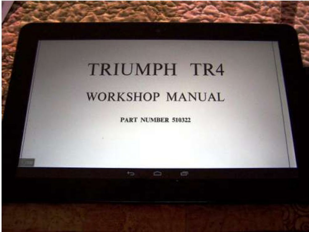
Example of the title page for one of the manuals on the tablet