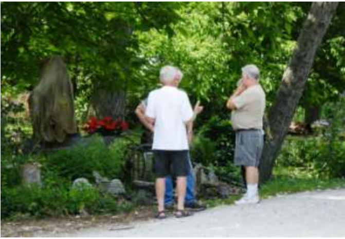
What is it? At Verona Shops