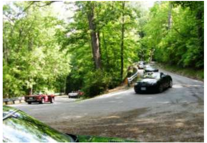
C & C Yanity at Horseshoe Bend