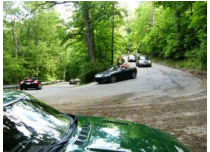
The Whites at Horseshoe Bend