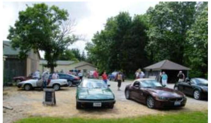
MVT Cars at Verona Shops