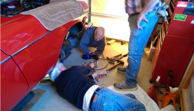
Working on the front springs on the P1800 – much easier than a TR8, or a TR3 for that matter...