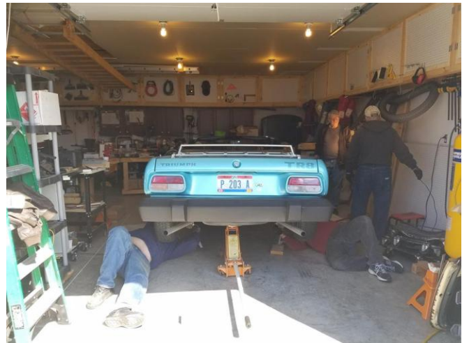
Don't know what all the fuss is about, Ted's car looks normal...