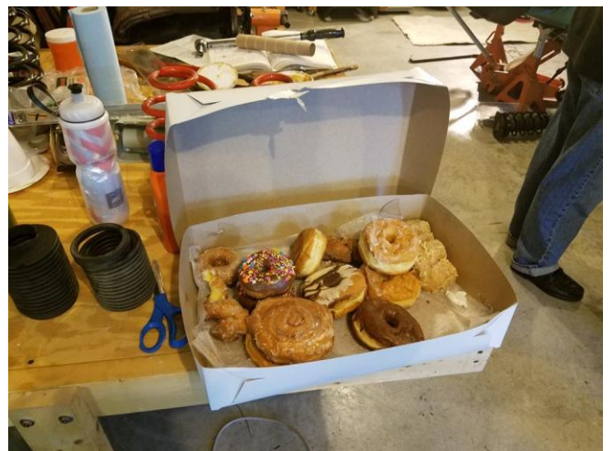
The real reason they all showed up...

Happy to report the car is all back together and at the correct ride height. Ted will no longer scrape