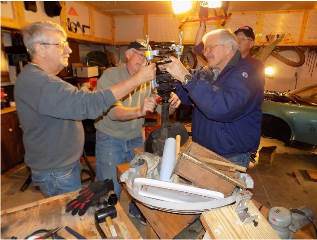
So how many MVT'ers does it take to swap a spring? More than were there evidently...