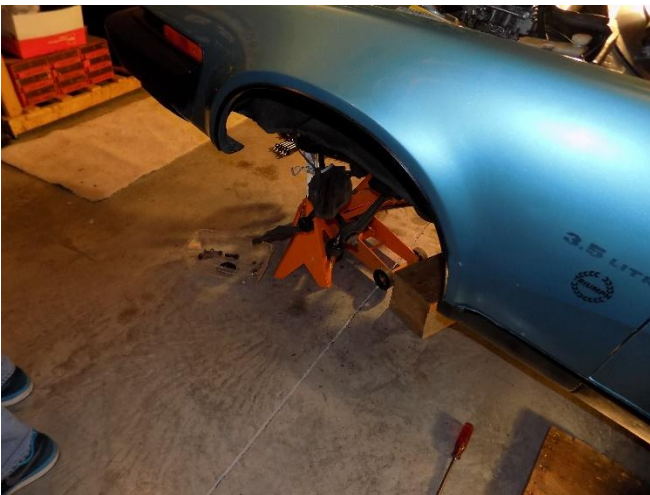
The victim after we got done with it.