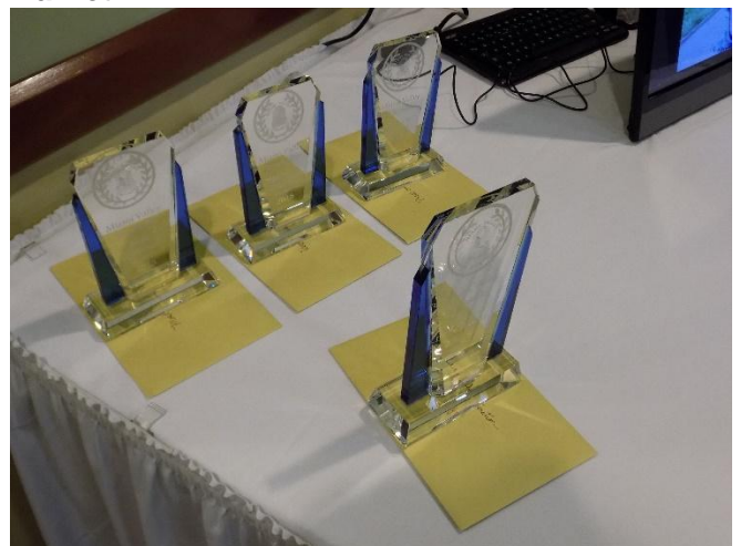
The awards awaiting new owners