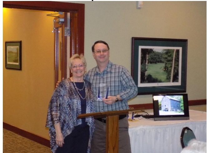
The Owens's take "Most Improved"