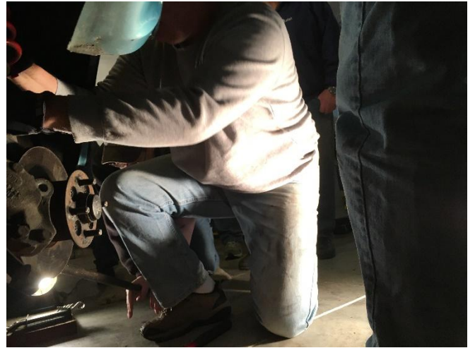
The dark recesses under the TR8 – several trepid MVT’ers explore

We worked at it for several hours, getting both struts off and apart, but in the end we had to stop since we (okay, Ted) needed to order more parts.