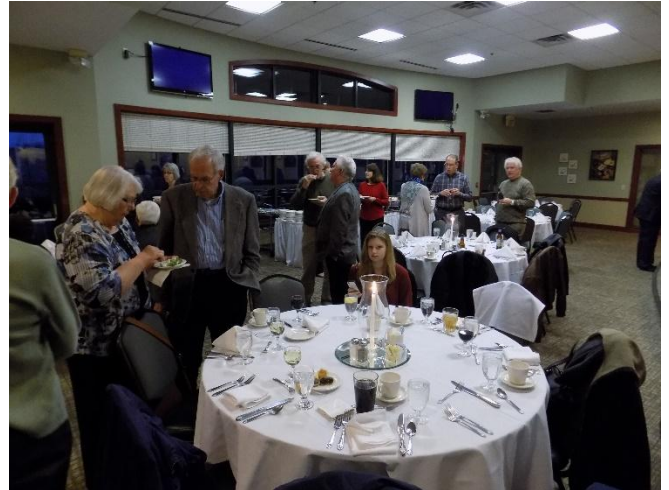
The folks gather for the feast!

Beaver Creek Golf Club, and as usual the food was great and the drinks poured tall. We like traditions.