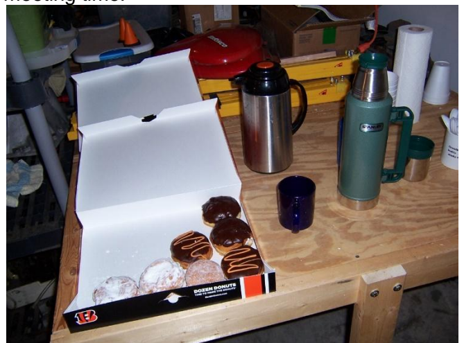
You want more of these, we know you do!