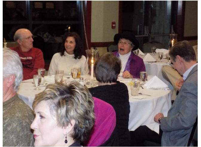
...and Lois orders a pizza, no pepperoni!