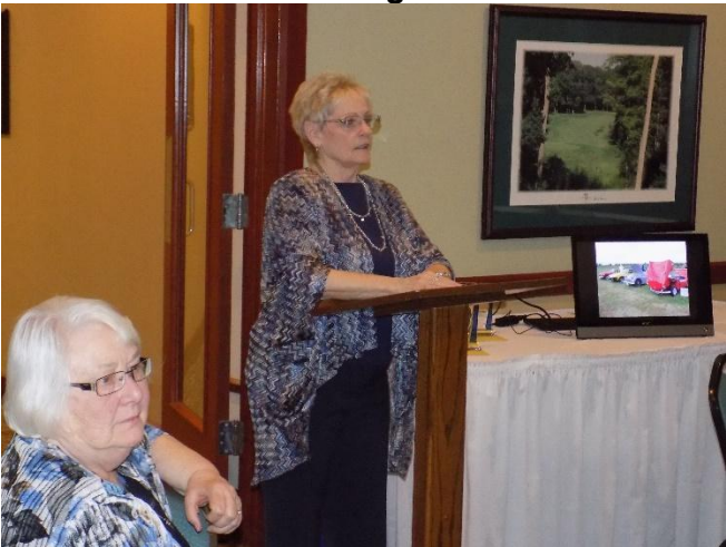
The Prez brings the house to order...