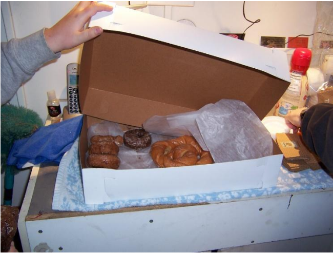
The true focus of the MVT tech session!