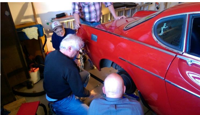
The back springs were the easiest to replace I've ever seen, even with the aftermarket sway-bar attached