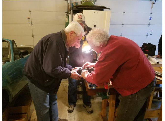
Here padawan, you must master this to become a Koni Knight!