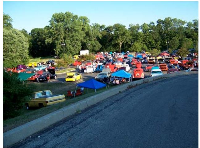
Car show at The Dutchman taken as we were leaving for home. They had about 200 cars there throughout the day. They were boasting they beat Middletown's attendance! They had a bad DJ, so it was like the rest of the cruise-ins I've gone to!