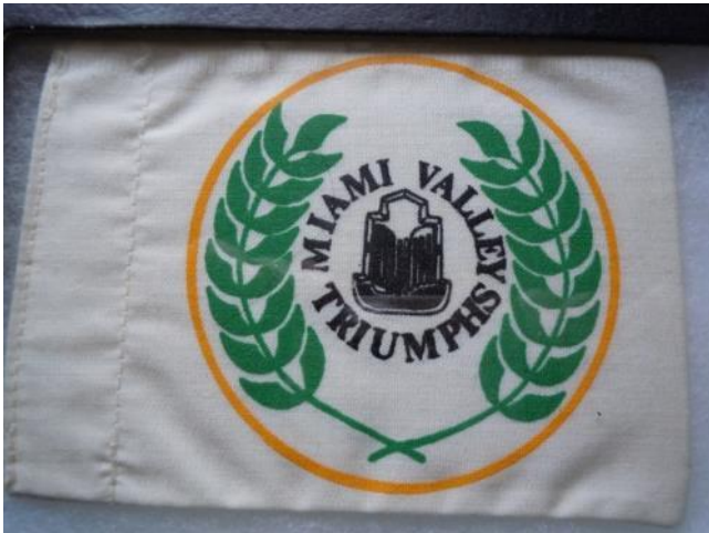
MVT Car Flag - $5.00