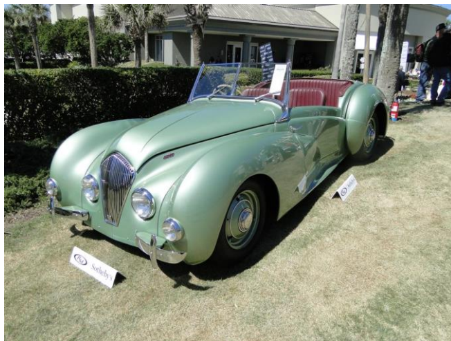
1948 Healey Westland at the RM auction

It was a great show with over 300 cars and motorcycles on the show field. I hope for better weather next year.