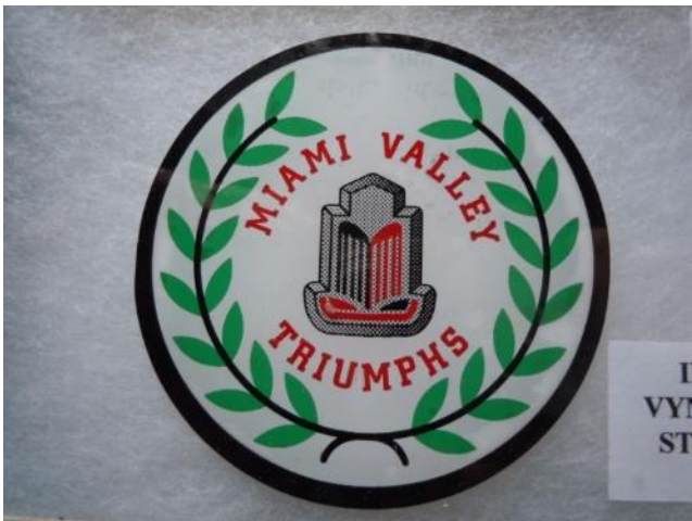
MVT Window Sticker - $1.00

All the memorabilia is available at each Club meeting upon request. Pls contact our MVT