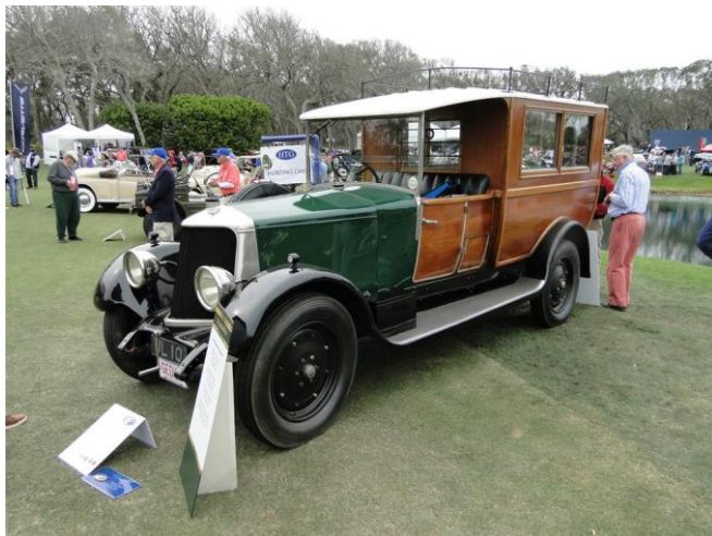
1928 Armstrong Siddeley at the show