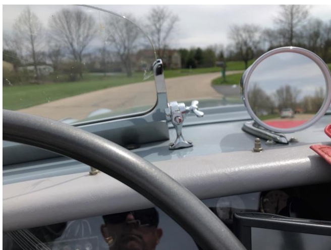
Just another decent Spring Day in Ohio...

Meanwhile, since the car is still very drivable I am driving it quite a bit!