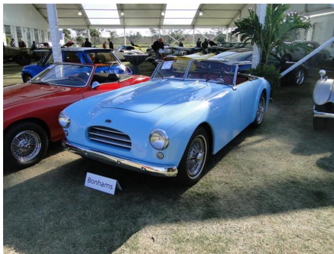
1954 Allard K3 roadster at the Bonhams auction