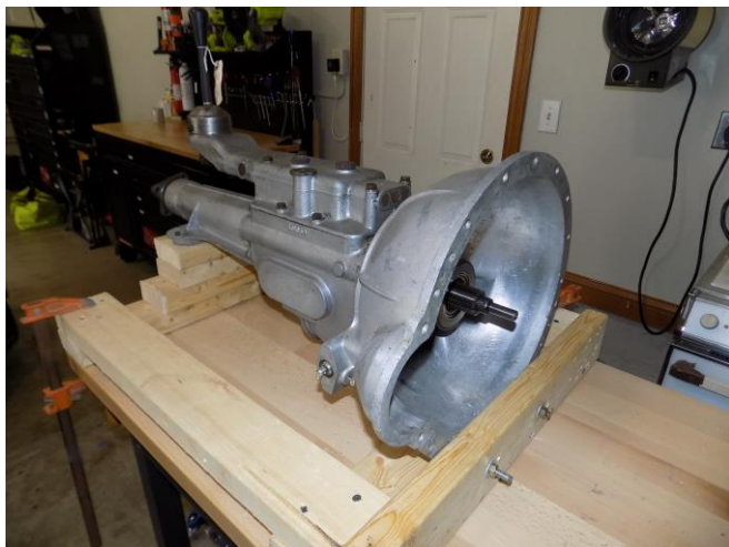
Look maw, a stand!

First stand is to hold the tranny in place while I remove the release bearing fork and top shifting assembly. Went to the shed. Got some 2x4's. Went to the tool chest and dug out the cordless saber saw, drill, and driver. 30 minutes later I had a stand. Also managed to drop the tranny on a finger while building it, so hopefully the neighbors did not hear those choice words.