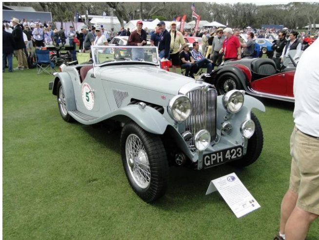
1938 AC Acec 16/80

Triumphs were hard to find this year with only this 1957 TR3 at the Gooding auction that I got a picture of. But there were many British cars at all venues with the following as a small representation: