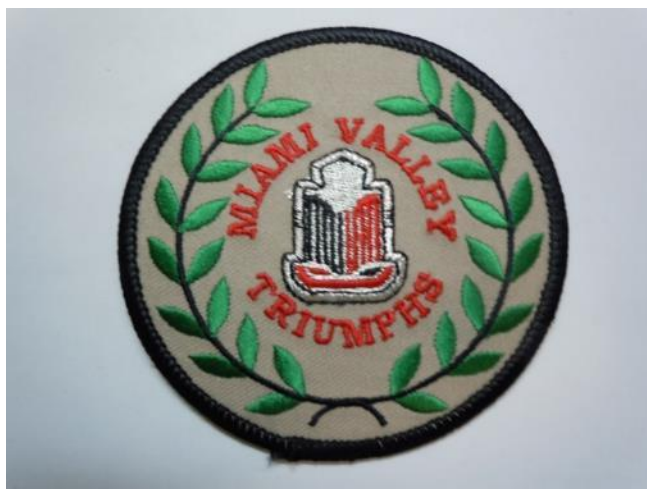
MVT Cloth Patch - $12.00