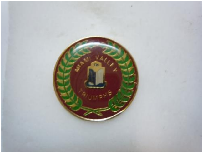
MVT Pin - $5.00