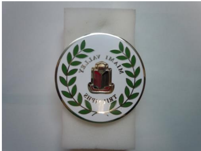
MVT Enamel Car Badge - $30.00

The Club has the following fantastic, wonderful memorabilia for sale. Show your colors in public, on your car or on you! Look at all we have: