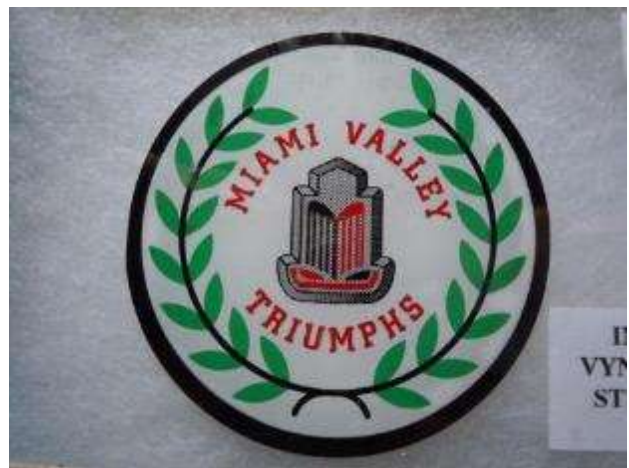
MVT Window Sticker - $1.00