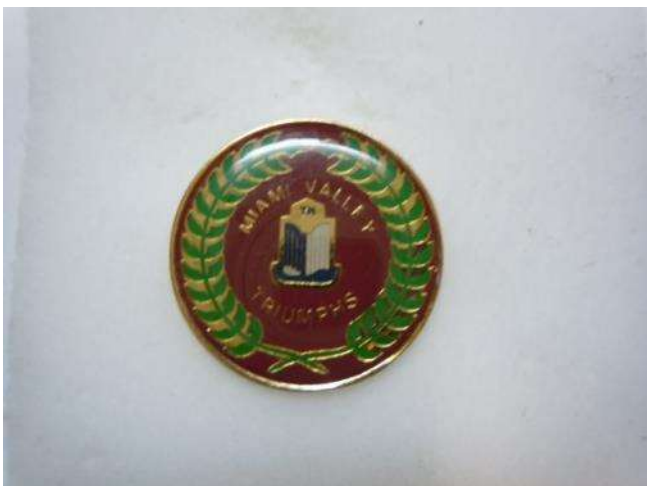
MVT Pin - $5.00