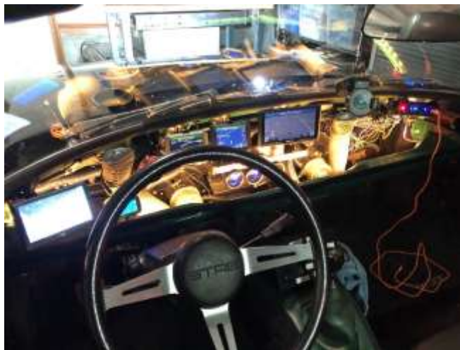
FrankenStag dash as of late December 2018

It's not worthy of a separate technical write-up, but I have got most of the dash in the FrankenStag reworked with remote cameras, lots of nav gear, and tire pressure sensors. I still have to add some sound systems gear, but I think I am mostly done – when the weather breaks I'm going to be working on the suspension, carbs, and the Grey Ghost's trannie.