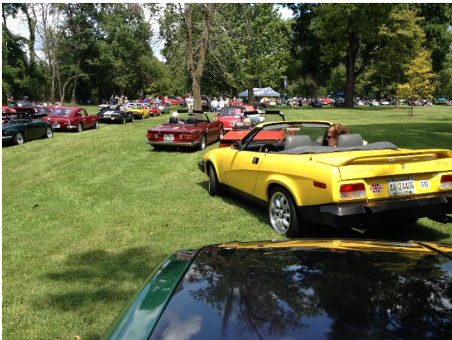
Always fun being a winner!