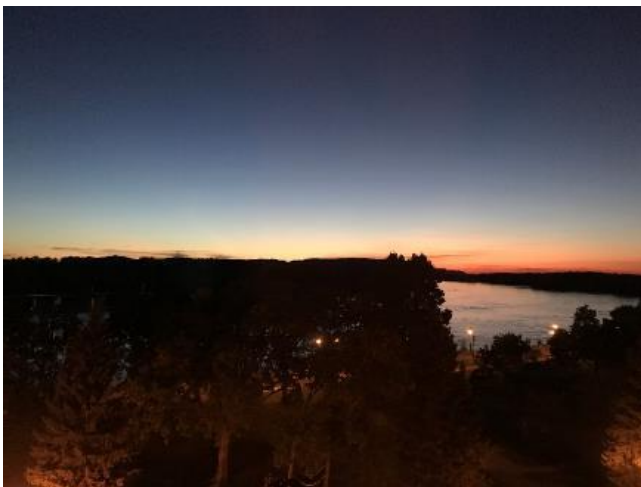
View from the Hotel

I learned a long time ago though to recognize signs of premonitions of future events.