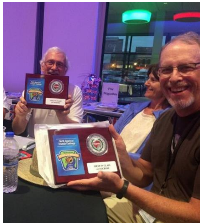
Don't let it go to your heads guys!