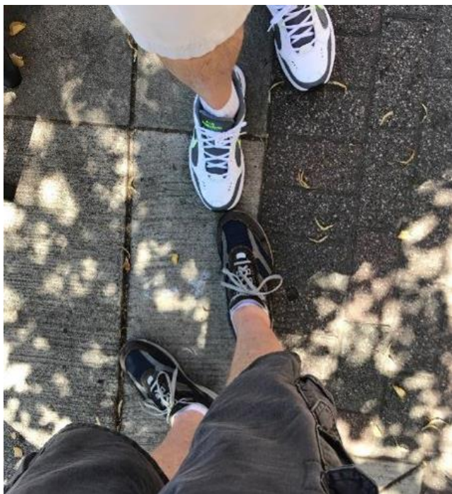
Obligatory feet shot

So, all of us had great fun during the trip, just some had a few unfortunate bad memories associated with the breakdowns. We were able to get some shopping in between events.