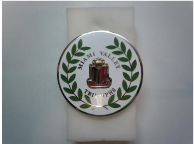
MVT Enamel Car Badge - $30.00

The Club has the following fantastic, wonderful memorabilia for sale. Show your colors in public, on your car or on you! Look at all we have: