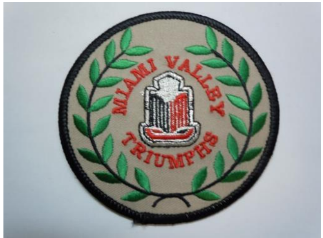
MVT Cloth Patch - $12.00