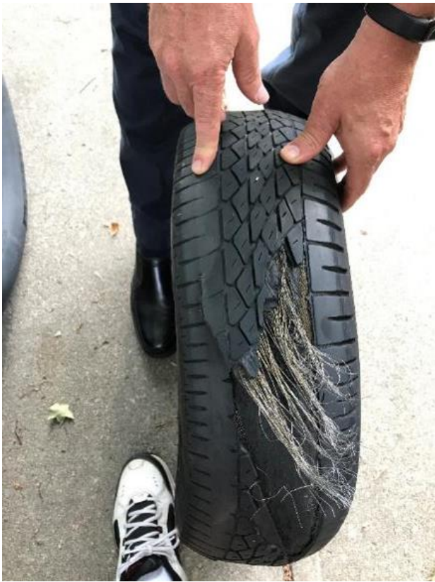
A Fine Used Tire

A second cluck also occurred to their Spitfire on the way home when one of the 16-year-old tires shredded itself approaching Champaign Illinois. In Jeff's defense, the tires "looked new" when he bought the car 12 years ago and he had no idea they were even older. When the tread and steel belt separated, it caused some damage to the wheel well before he could stop and put the spare on.