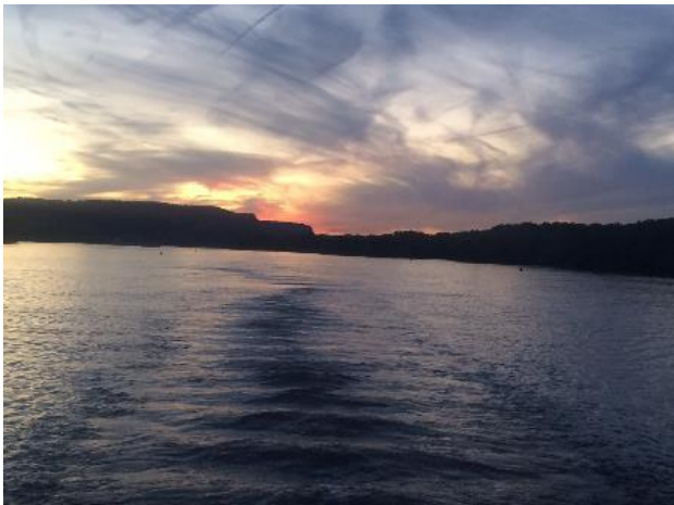
Sunset on the Father of Waters...