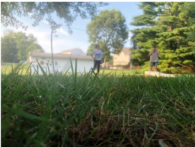
Corn Hole for the masses!