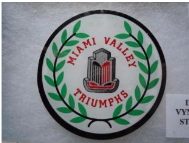
MVT Window Sticker - $1.00