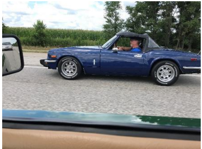
"Rolling down the highway"

It was dark and stormy night. Well, that really didn't work for Snoopy and I don't think it will work for me. Actually, it was a little overcast when we left Englewood. New friendships begun and old friendships hopefully strengthened. We left and headed for Brownsburg, Indiana to rendezvous with one more couple in their TR8.