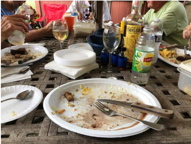
Burp – the food was very good!