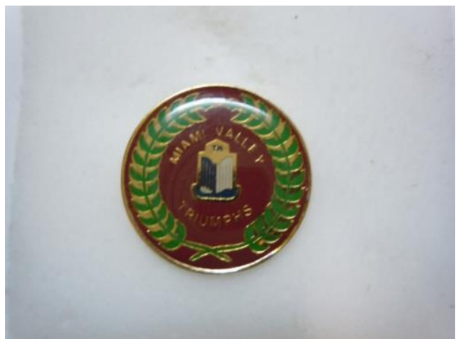
MVT Pin - $5.00