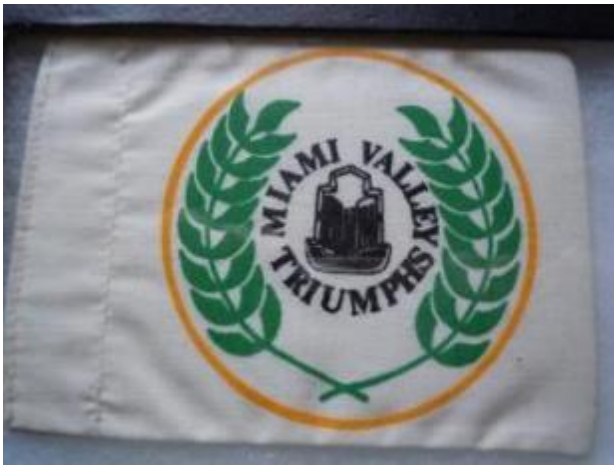
MVT Car Flag - $5.00