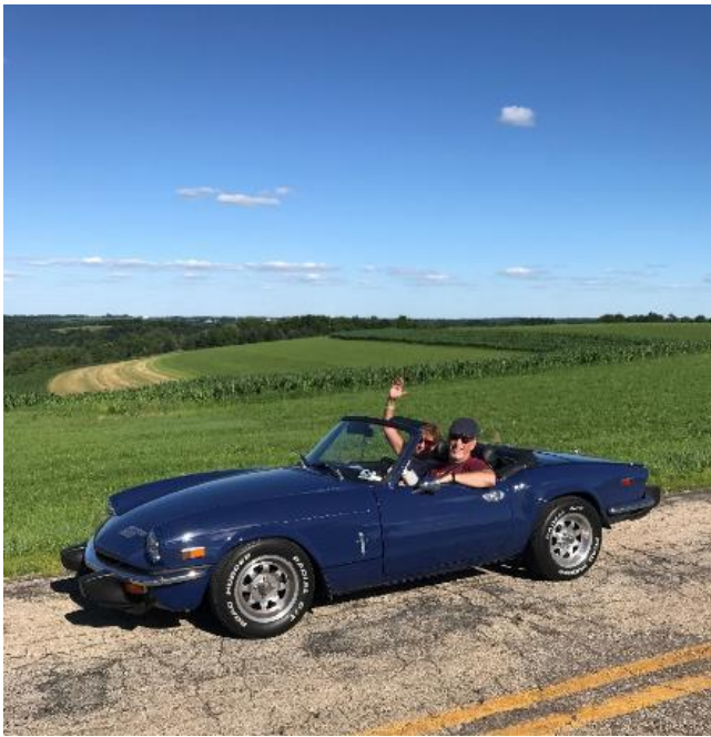
One of the Drives