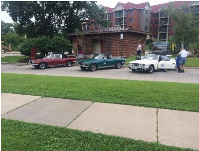
Stags at Concoors – if they are trying to be the Italian Flag they are in the wrong order...