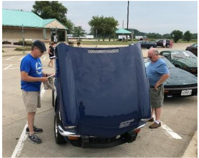
All I have to do is water it and give it a little fertilizer and it will grow up to be a V8

could check out the car and only 10 minutes away.