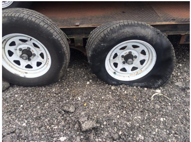
Just a flesh wound...