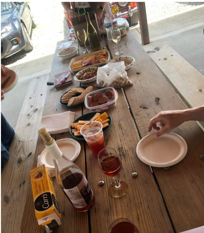
Fantastic Food at the Vineyards

3 – BCD Preparation – Eastwood Park off Woodman Drive. Show up at 6PM to help pack registration bags as well as mark parking spaces and to yap with all the other British Sports Car fanatics that will be there!