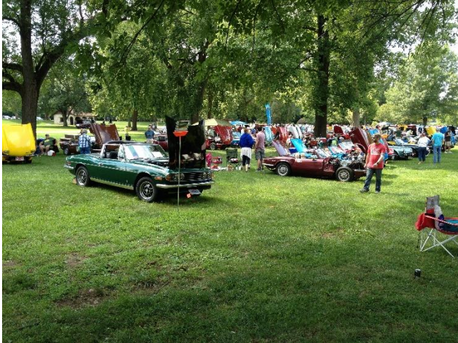
I hear Dayton BCD, it is calling you, and can't you hear it?