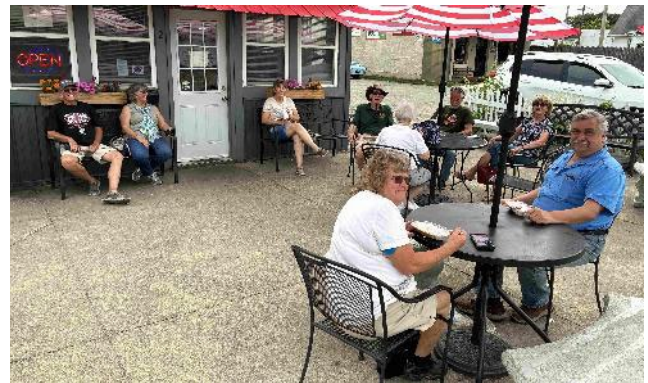
We all scream for ice cream!

entire drive so we might have to do something like that again!