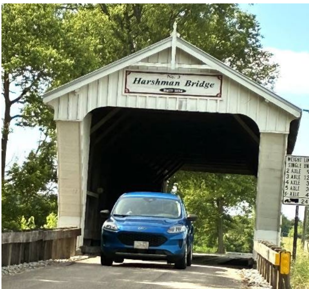
Senter's TRord coming out of the bridge