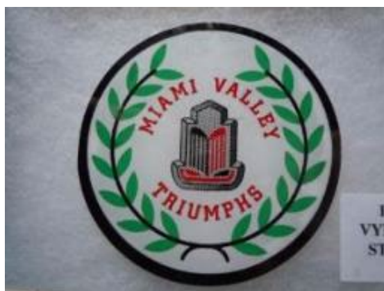
MVT Window Sticker - $1.00