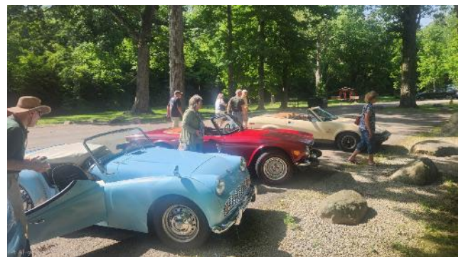
TRs at the Park