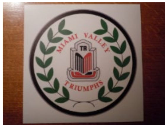
MVT Magnetic Signs – these can be easily cut so they are round. They are 12"x12", 11" in diameter if cut round. - $12