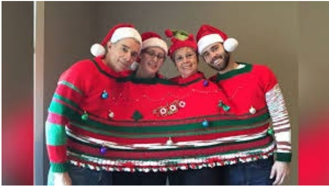
TBD – Ugly Sweater Contest – Details TBD