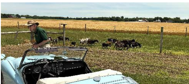
The OG meets the G's!