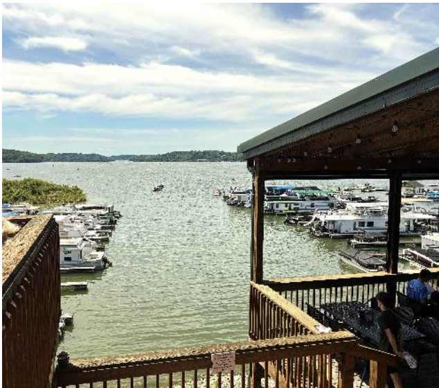
The view from Ainsley's Café

entire drive so we might have to do something like that again!