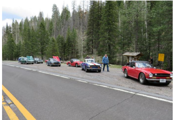
Pit stop and carb tweaking along US 60 in New Mexico