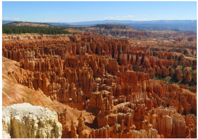
Scenic overlook at Bryce Canyon National Park