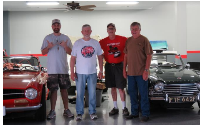
Checking out two of the cars the night before the tour start

The tour followed primarily secondary/scenic roads through West Texas, New Mexico, Arizona, Utah, western Colorado, back through New Mexico and a two day return drive to Houston (see overview map below). The trip covered approximately 4,700 miles in 16 days (May 14 – 29). In addition to travelling on scenic roads, the trip itinerary always includes visiting an array of automotive related venues, various museums, military related venues and national parks/monuments. This year's drive included a good mix of all of the above: