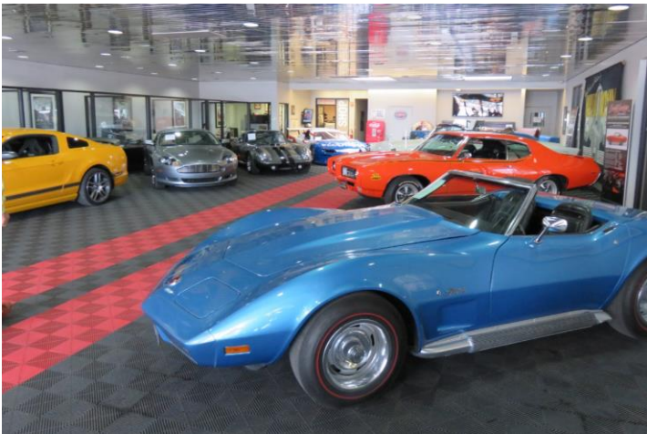
Barrett-Jackson Collector Car Showroom