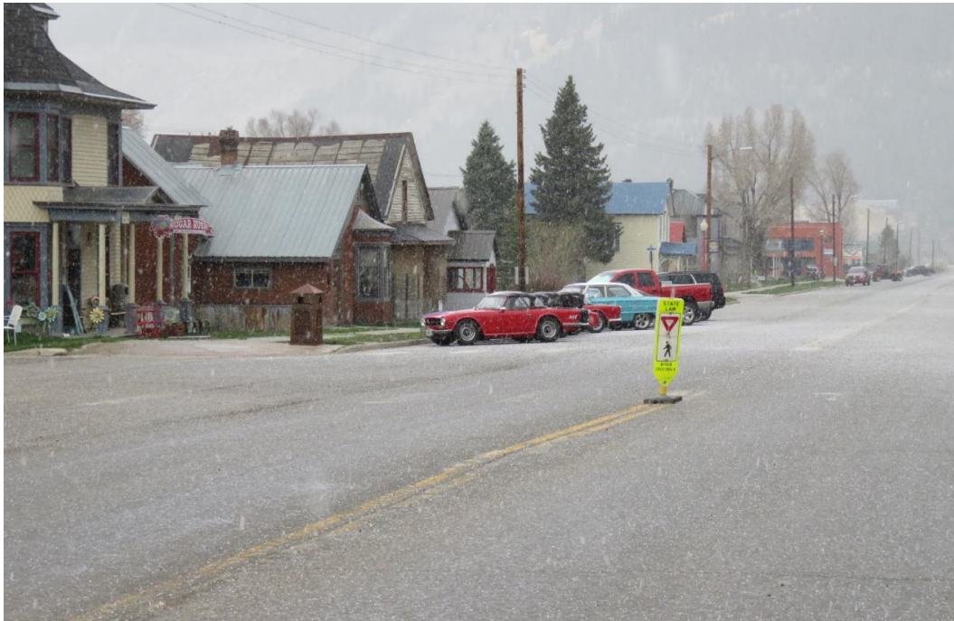
Snowing in Silverton, CO