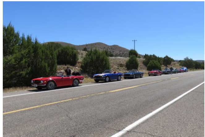
Pit stop along the way to Carlsbad, NM