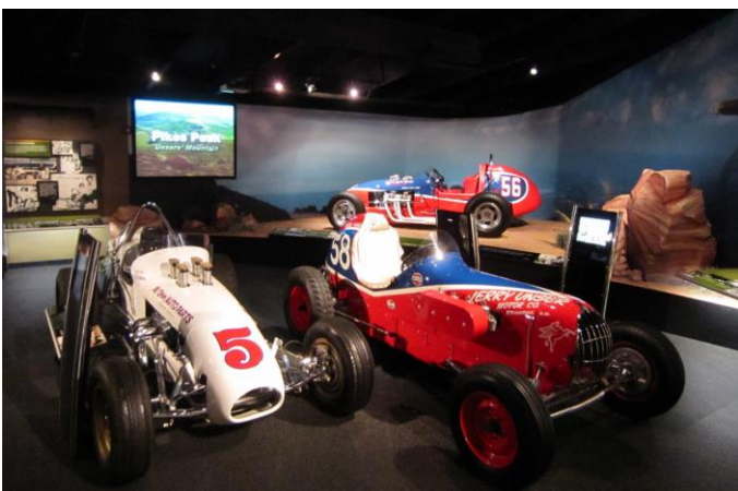
Inside exhibit at Unser Racing Museum