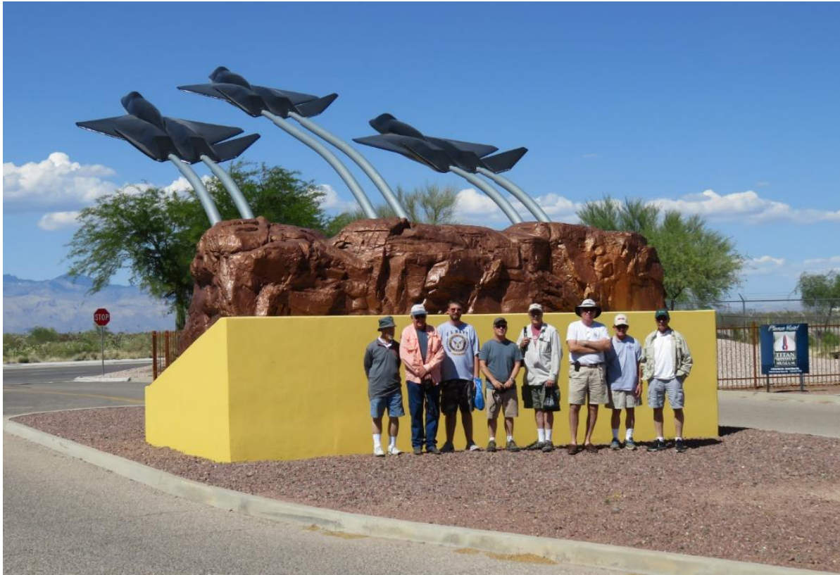
Group photo at entrance to Pima Air Museum