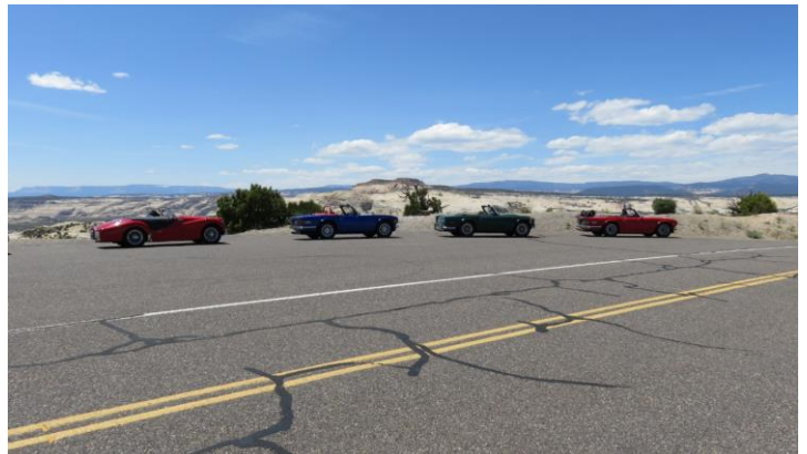
Scenic overlook along route to Price, UT