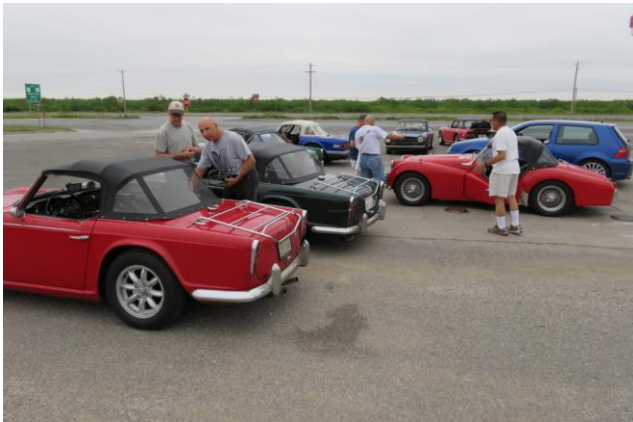
Pit stop along US 90A on Day 1