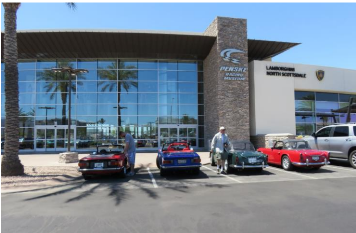
Penske Racing Museum in Phoenix, AZ