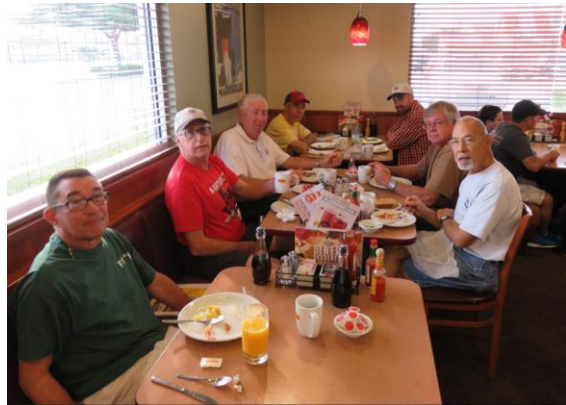
Breakfast gathering Day 1