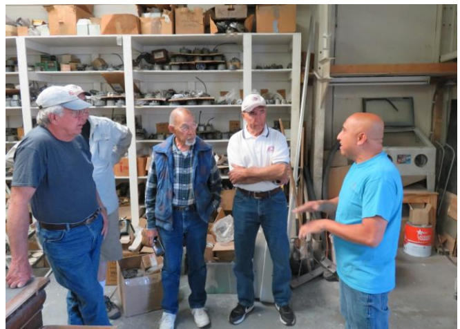
A visit to Mo-Ma Manufacturing in Albuquerque, NM