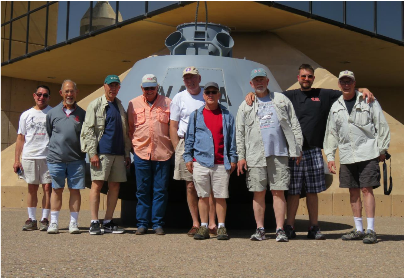
New Mexico Museum of Space History