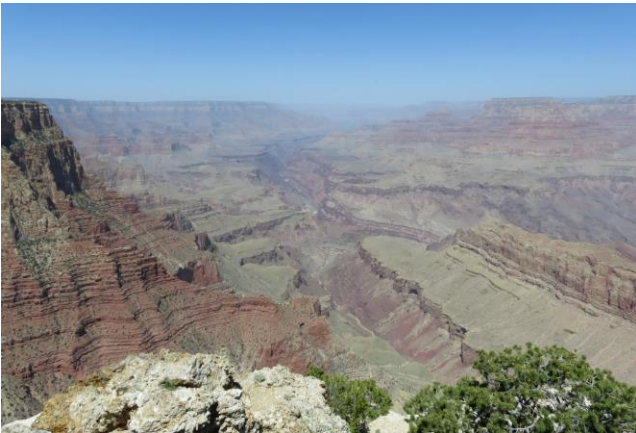
Scenic overlook to Grand Canyon