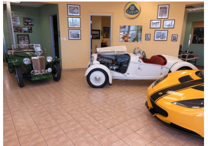
Brighton Motorsports Showroom in Scottsdale, AZ