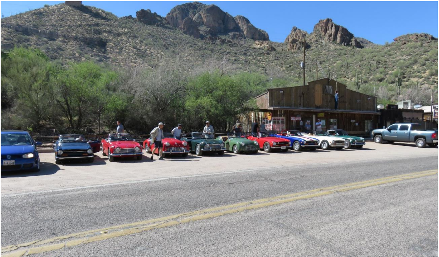
Gathering of Triumphs at Superstition Saloon and Restaurant in Tortilla Flats, AZ