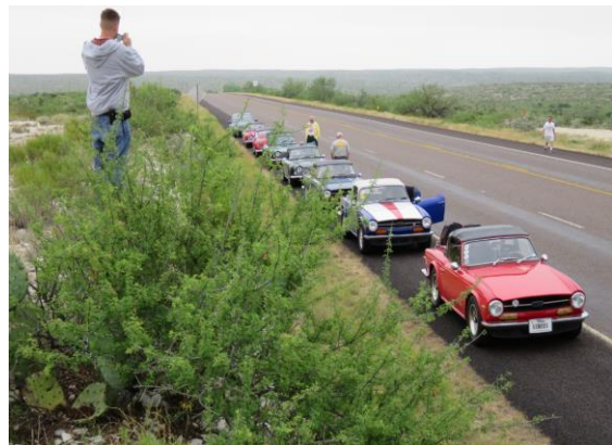
Pit stop in West Texas on Day 1