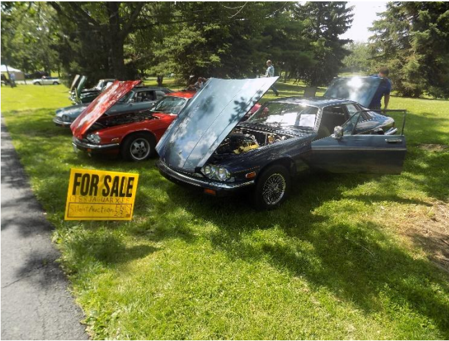
Want a Jag sedan? Went for $750, ran, and came with spare parts!