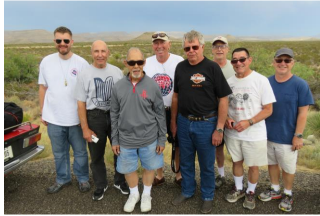
Scenic stop to view El Capitan Mountain