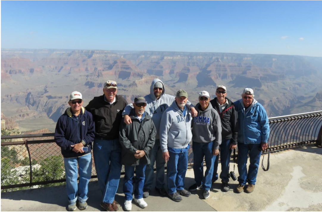
Texas FOGs arrive at Grand Canyon