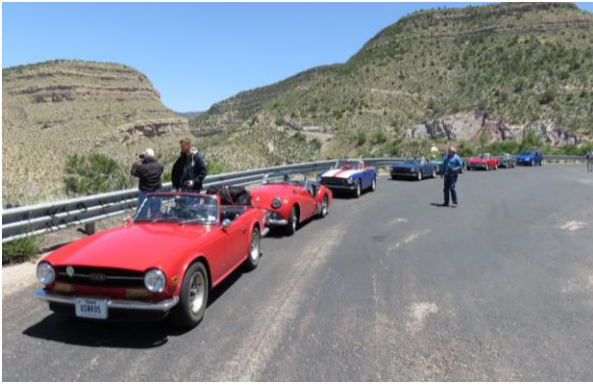
Along US 82 heading to Alamogordo, NM