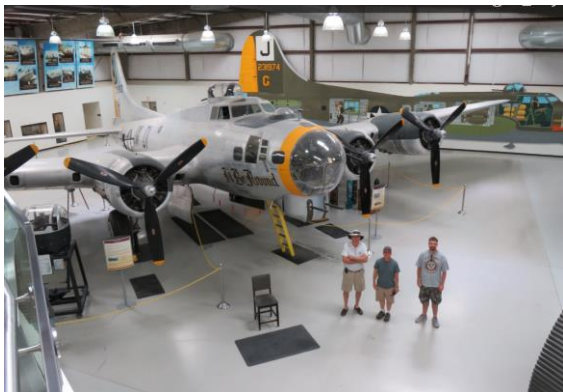
B-17 Bomber at Pima Air Museum, Tucson

The itinerary for the day included a visit to the Pima Air Museum and Airplane Boneyard in Tucson. We decided to sign-up for a guided tram tour of the outside static displays at the museum, which proved to be a very informative and an efficient way to see the multitude of aircraft on display. There were also several buildings/hangars containing many more aircraft from WWI through to Cold War aircraft. We next took a tram tour of the Airplane Boneyard which is located on the grounds of Davis-Monthan Air Force Base. This is reportedly the world's largest aircraft boneyard. The current aircraft stored are essentially Vietnam/Cold War vintage military planes. There are a considerable variety of aircraft stored but more impressive are the numbers of aircraft stored, reportedly over 4000. After our tour of the museum, the boneyard and lunch at the museum grill we headed for Tempe, AZ.