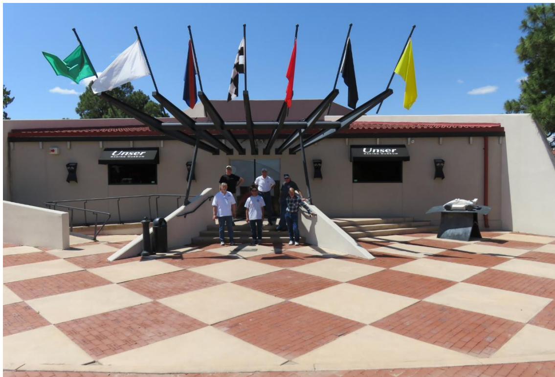
Visit to the Unser Racing Museum in Albuquerque