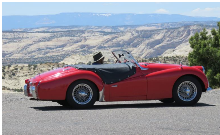
Russ Seto taking in a scenic view along road to Price, UT