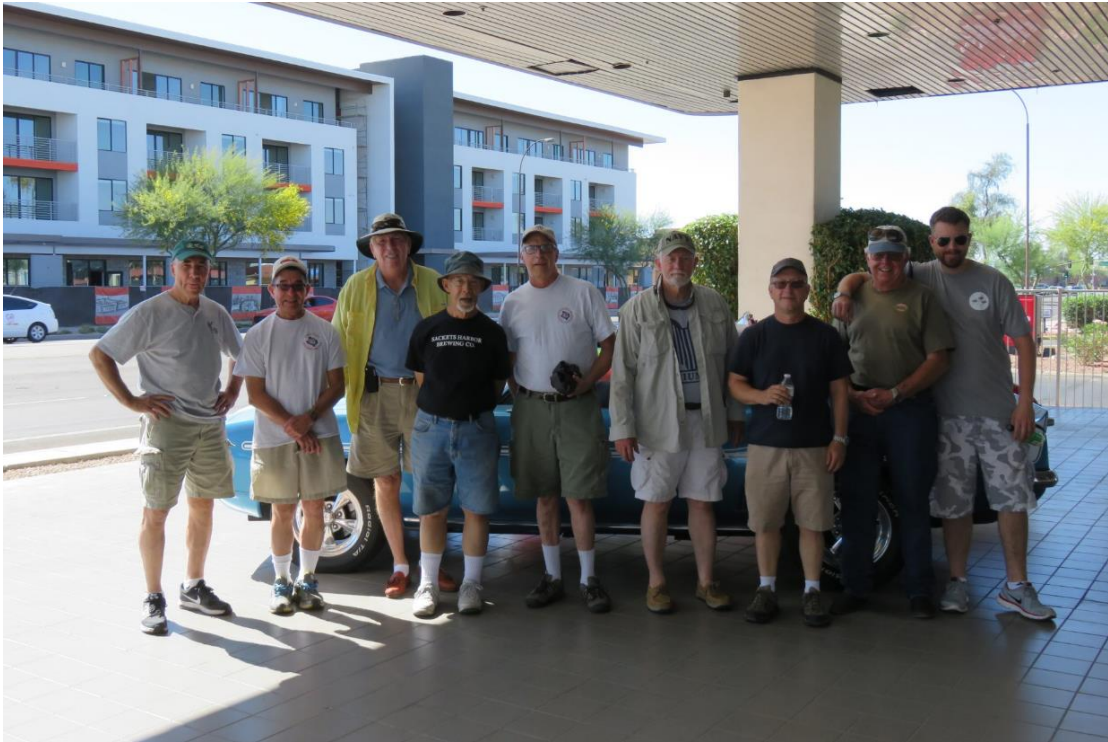
Group photo at Barrett-Jackson Collector Car Showroom in Scottsdale, AZ