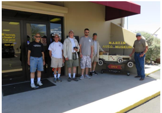
Martin Auto Museum in Phoenix, AZ