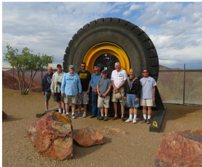
Standing in front of the Morenci Copper Mine ore truck wheels