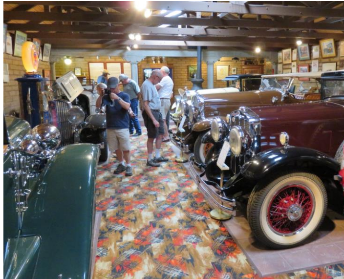
Franklin Auto Museum, Tucson