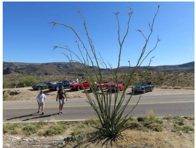
Scenic stop along Apache Trail morning drive