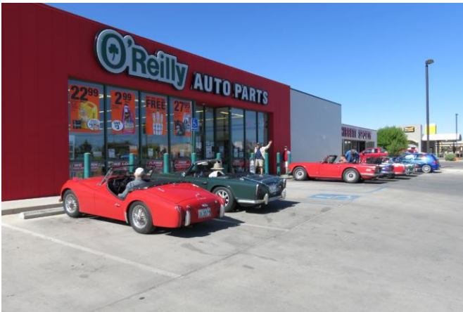
Stop for supplies