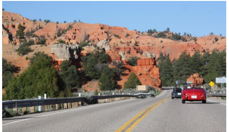
Along UT 12 highway toward Bryce Canyon, UT