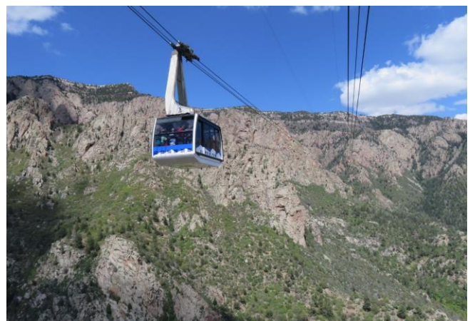
On-coming traffic on Sandia Peak Tram