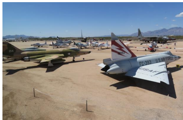
Outdoor static displays at Pima Air Museum