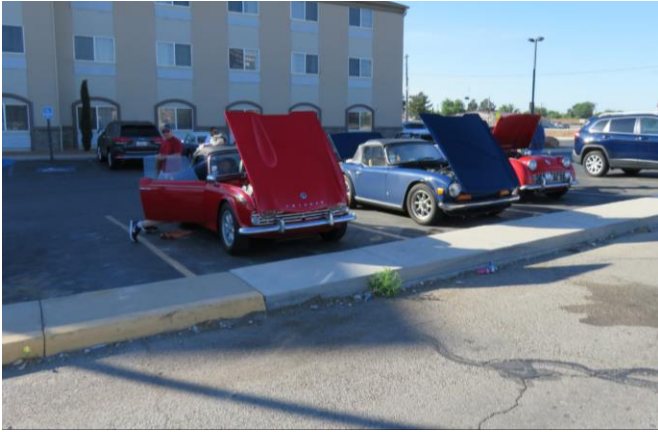
Morning prep in hotel parking lot on Day 2