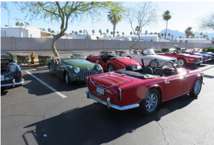
Morning rendezvous with local Phoenix TRA members

The plan for Day 8 was to meet up with some of the local TRA folks for an early morning drive up the Apache Trail (AZ 88) scenic road and have breakfast at the Superstition Saloon and Restaurant in Tortilla Flat, AZ. The drive was great, a bit bumpy on the first half, but improved as we climbed into the Superstition Mountains. The restaurant was very interesting with every wall covered with one dollar bills. After breakfast, Karl Rettenmaier headed back to his house in Tucson to leave his TR6 and fly back to Houston. We also bid farewell and thanked the four Desert Center TRA members for a great morning. After push starting my TR6, our drive north toward the Grand Canyon included travelling on some very scenic secondary roads through several historic Arizona towns such as Wickenburg, Prescott, the old mining town of Jerome, Sedona and Flagstaff. We didn't arrive to our hotel in Tusayan until shortly after 9:00 pm and needless to say, there was no wine hour! Due to a limited selection of dinner venues that were still open and not overly crowded, we enjoyed a wonderful meal across the street at MacDonald's !