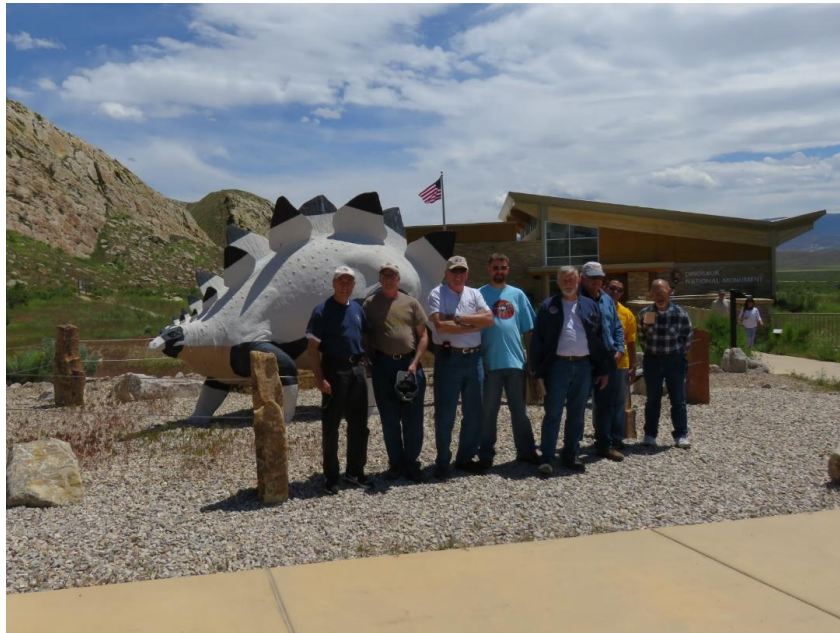
Texas FOGs at Dinosaur National Monument in Jensen, UT