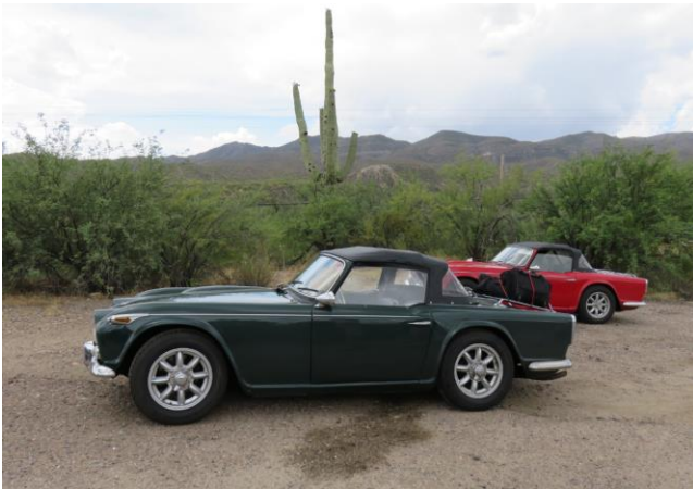
Saguaro cactus along the road to Tucson