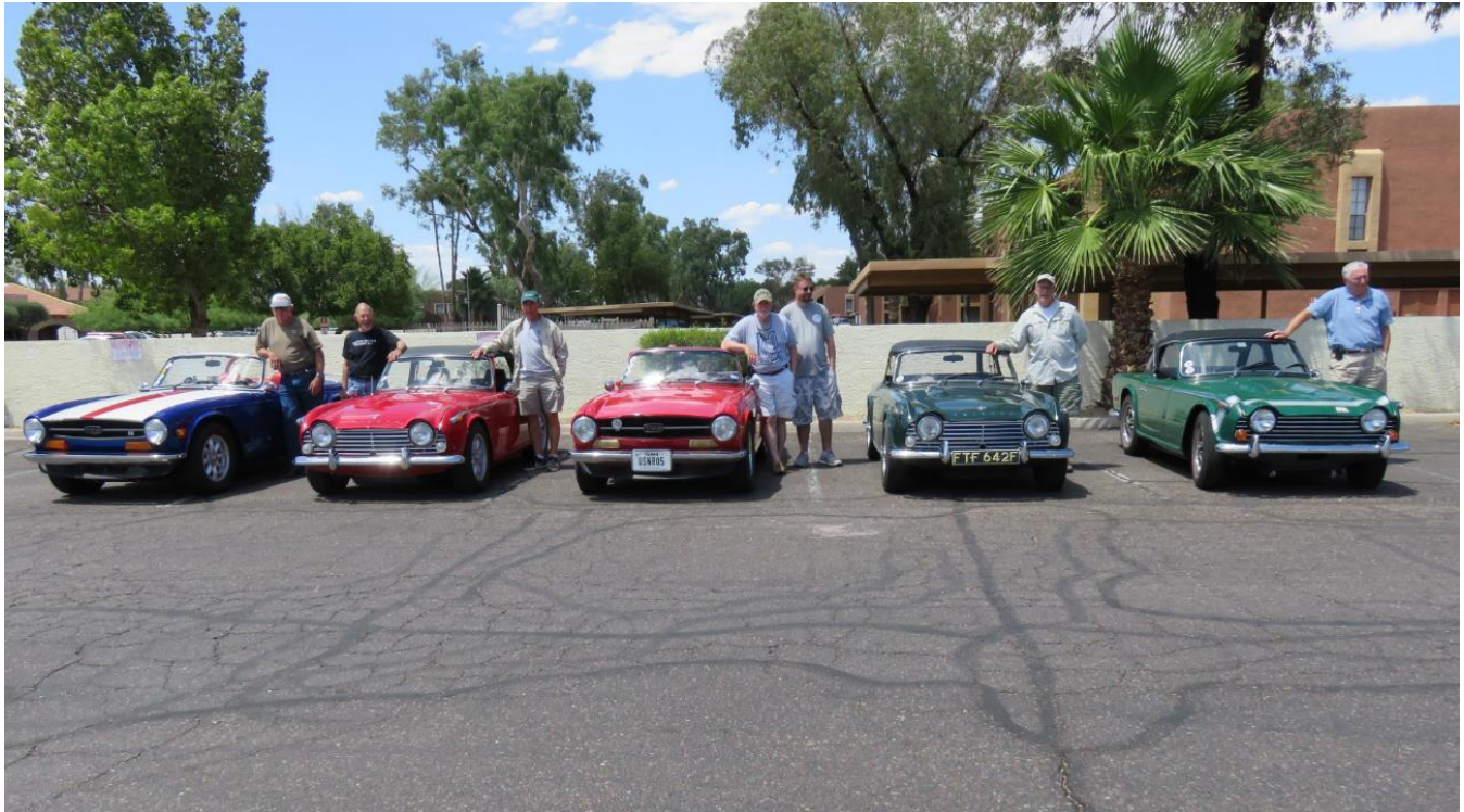
Group photo at Fast Eddie's Diner , lunch stop Day 7 in Phoenix