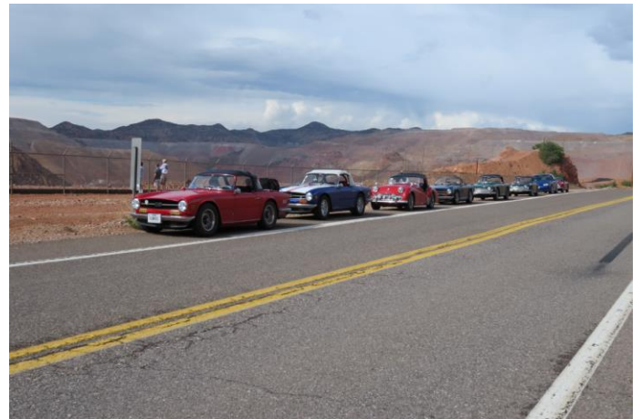
Scenic overlook to the Morenci copper mine in Arizona