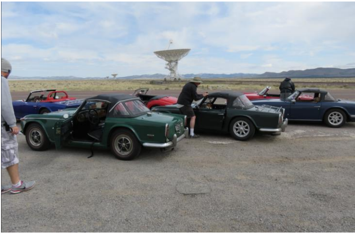
VLA Radio Telescopes in the Plains of San Augustine

standing by ore truck wheel). The next stop was at our scheduled hotel in Safford, AZ. While unloading the luggage from my TR6, I heard a threatening noise in the rear of the car. After some investigation by several members of the group, we determined that my right rear wheel bearing was giving up. Several possible scenarios were discussed, but in the end we decided that the bearing probably could hang-on for the remainder of the drive.