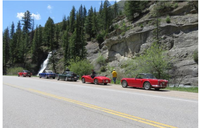
Photo stops along route to Montrose, CO