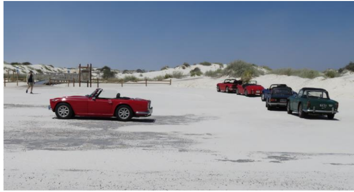
White Sands National Monument