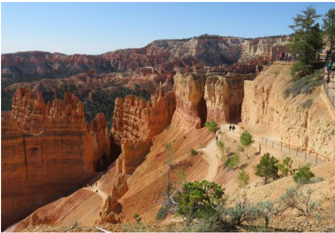
Scenic overlook at Bryce Canyon National Park