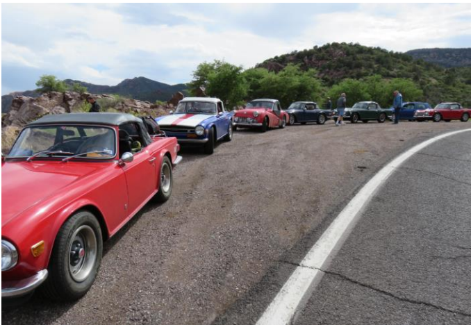
Scenic overview along US 180/US191 in Arizona