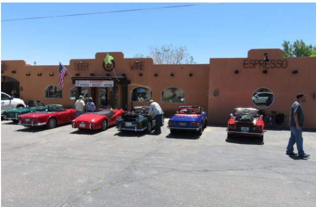
Lunch stop at Circle D restaurant in Escalante, UT