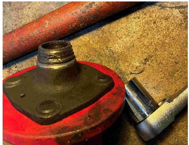
The wheel hub lying on the floor

Removal of the hub went smoothly, but why not - that hub has been removed a few times over the last 3 years. Once it was removed a visual inspection of the axle, while running at idle was performed but seemed very difficult to determine anything other than the continued grinding noise previously mentioned. On to further removal and examination.