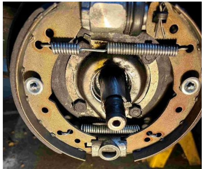
Nothing obvious here...

A week or so ago I finally got out to the garage to put the rear of the Spit up on jacks to find out exactly what had happened. With the wheel off and a closer examination it appeared that the brake issue was simply a loose connection and our tightening along the back road had resolved the issue. Wheel outside and inside both appeared to be dry. On to locate and get a better look at the grinding noise that ended our trip.