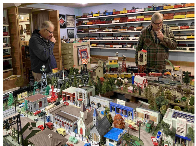
...nor here either – where is that guy?