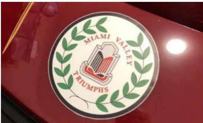
They look very spiffy on a TR7...