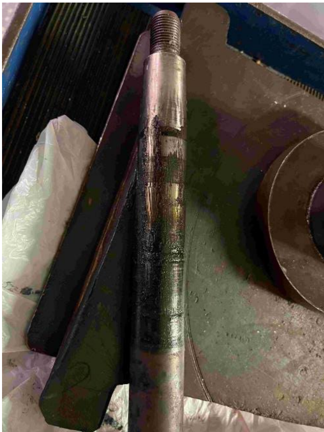
Picture of Axle without Trunnion

The resulting examination only confirms the need to find the elusive driveshaft(axle), which at this time only appears to be available if one can find one in the wild. None appear to be available in captivity at any of the popular spots for Rimmers, Moss, British Parts Northwest or other lesser-known establishments.