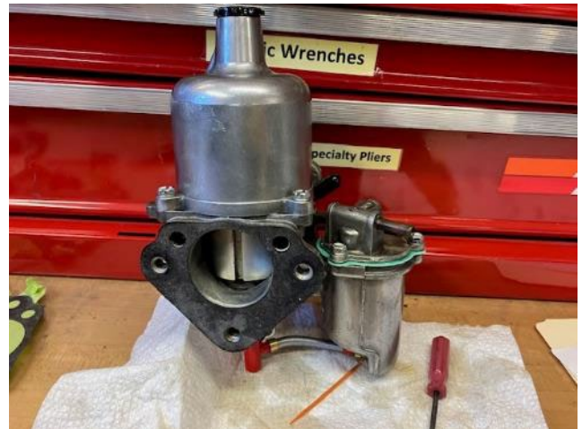
Okay – one is done.