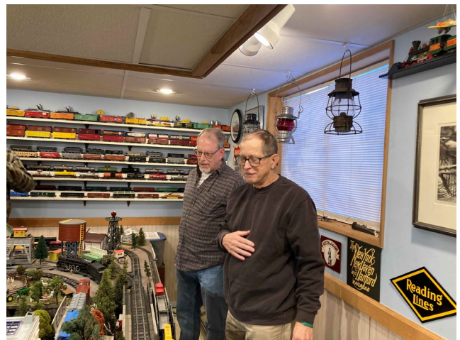
No, the wino isn't here...