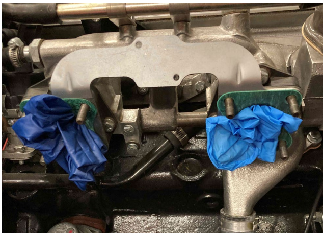
High tech debris protection...