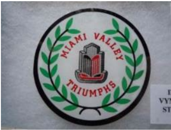
MVT Window Sticker - $1.00