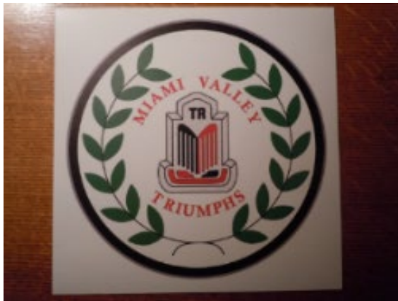
MVT Magnetic Signs – these can be easily cut so they are round. They are 12”x12”, 11” in diameter if cut round. - $12