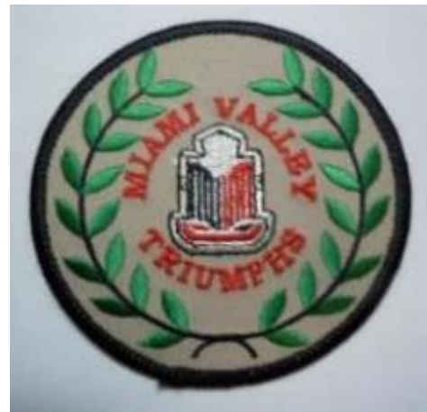
MVT Cloth Patch - $12.00