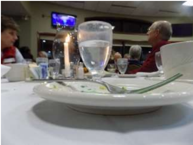
MVT Awards Banquet Dinner from the fork's view. More inside!