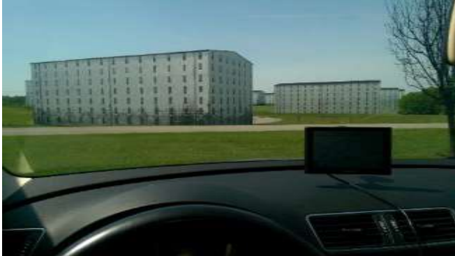
Rik Barns, Heavenly Hill Distillery