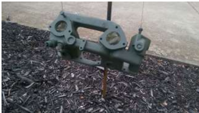
Figure 5: Primed manifold waiting to be put in the oven to cure.

The rattle-can paint worked fine. Remember to shake it well and clean the nozzle before using. Nice even coat (Figure 5) was laid, then I put it in the oven to cure. Since I was painting aluminum I used a self-etching primer so it will stick and the top coat will stick also.