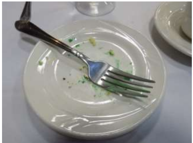
Cake? It was good.