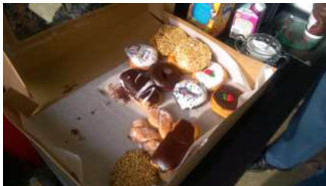
Of course there were donuts!