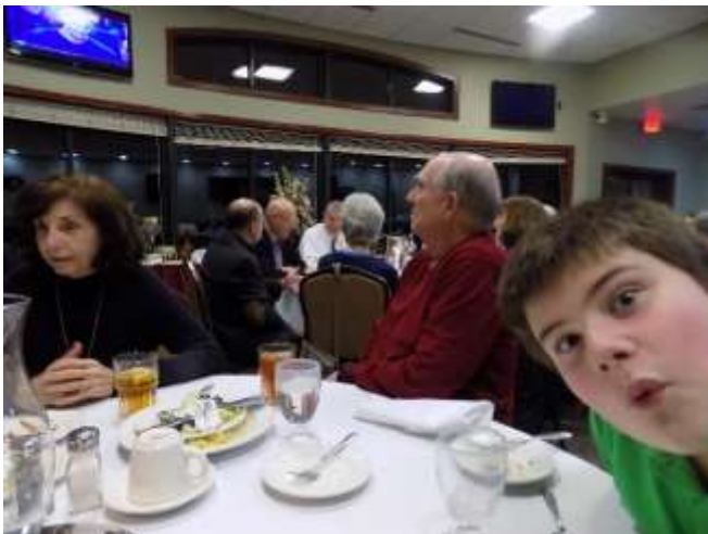
The packed room and my son the photo bomber. He is very proud of it.