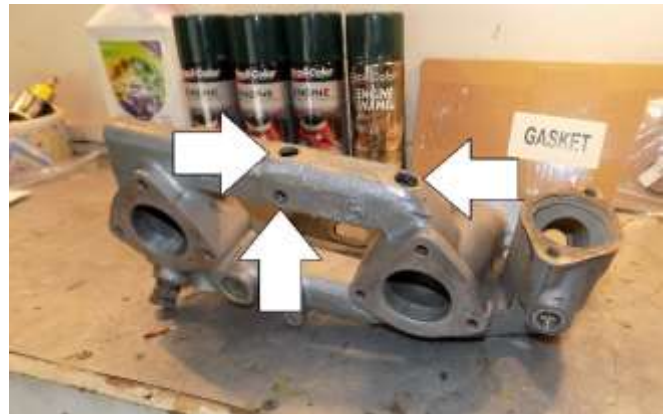
Figure 2: New manifold showing some of the holes to weld shut.

So what do I do? Take off the manifold and redo the plugs, then put it back on? Could. Or maybe find another manifold on ebay and fix that one while I still use the old one (so I can still drive the car)? Even better – so find another manifold! Turns out there was one on ebay real cheap, so I snagged it. When it came in cut off/filed off the metal build up around the holes so when it's welded up it will look smoother (Figure 2).