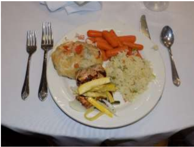
Some of the food laid out by the Country Club folks for MVT. I did clean my plate.