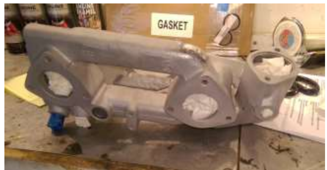
Figure 3: Manifold back from the machine shop getting ready to paint – no more holes!

It came back from welding pretty smooth so I prepped it for paint (Figure 3).