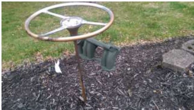
Figure 4: It works perfect.

I used my usual paint booth, the old TR3-steering-wheel-on-shaft-shoved-into-the-mulch-bed (Figure 4). It's a beautiful thing.