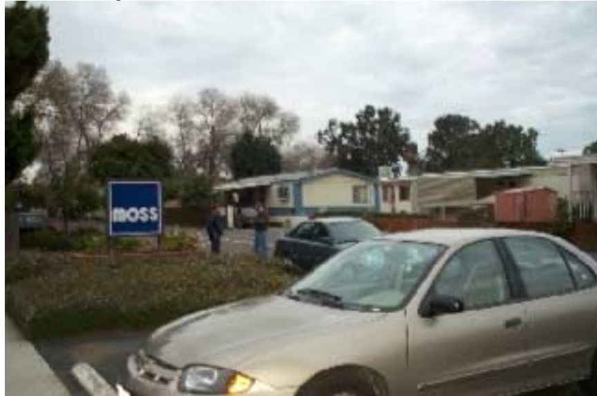
Seldom seen view of the Moss neighborhood.

If you’re ever near Santa Barbara, by all means stop in and visit the place where so much of your money disappears. But having been there, I wouldn’t make a special trip from LA or San Francisco just to go there. After all, it’s just a building with cubicles and a warehouse, and that blue & white Moss sign out front!