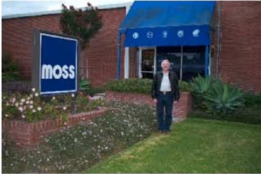
MVT-VP walks on 'Holy Ground' outside the Moss Motors Goleta CA complex.

OK. I'll admit that I have never looked at a California map to see where Goleta, home of Moss Motors, is located. Had no reason to even think about it. I'm more concerned about whether my order is in stock in Moss's New Jersey warehouse so I can get it in 2 days as opposed to a week. But then there was the "where's Michael Jackson" event on TV, and my Moss sales rep happened to mention that the news helicopters were hovering over the Moss Motors building all day, and I quickly learned that the Santa Barbara airport is in Goleta. As luck would have it, I had an overnight trip to Santa Barbara scheduled for the end of December. With Rutherford Street only 4 blocks from the airport, I simply had to stop in for a visit.